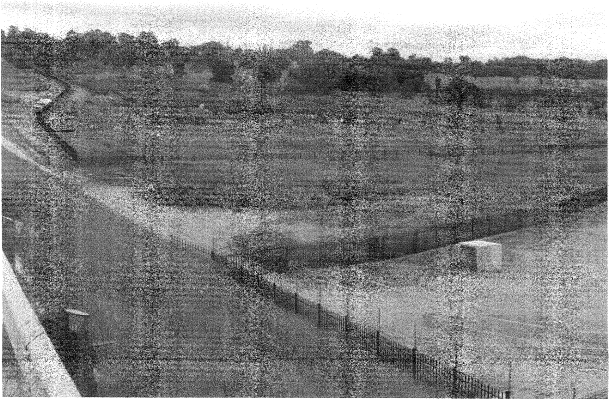
Another view of the area