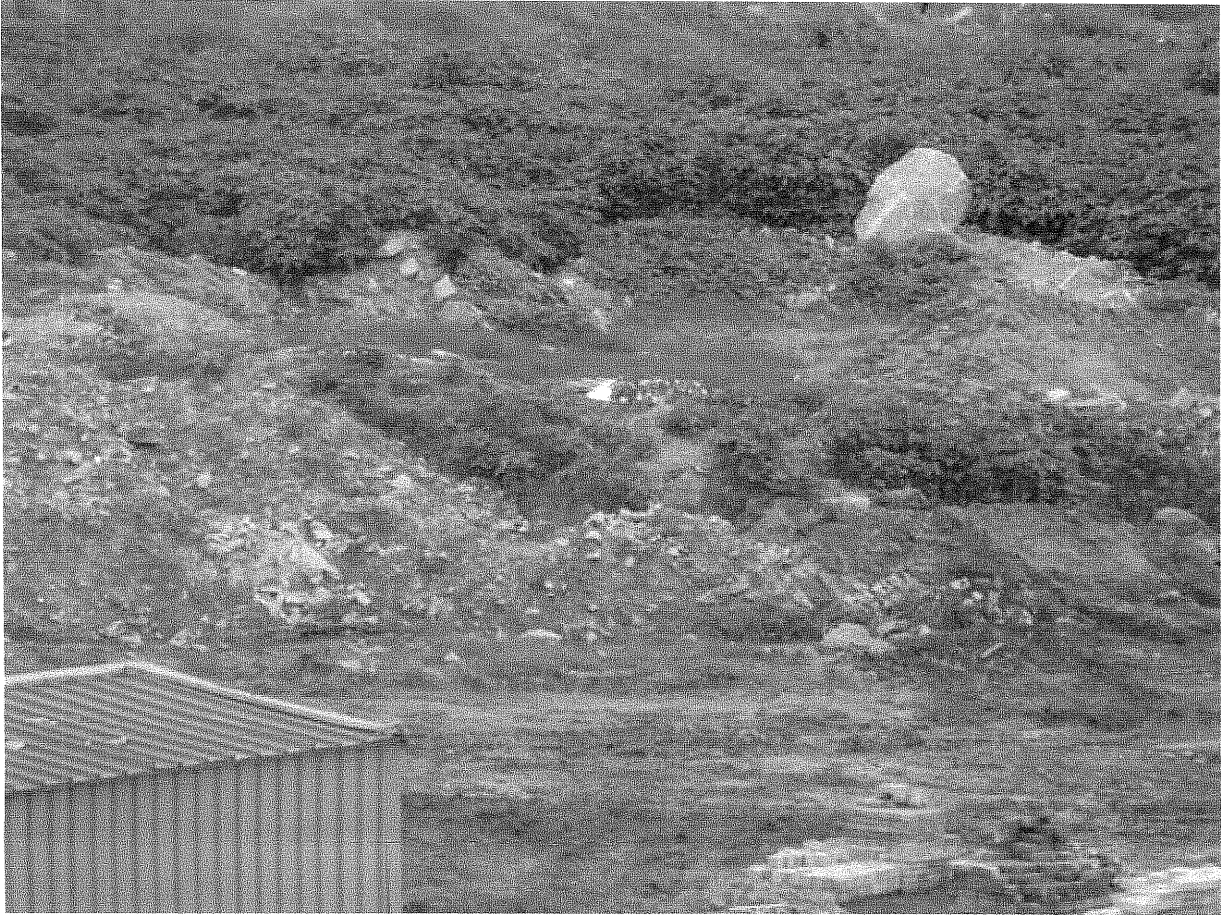
Close-up of soil heaps and residential dumping in the area