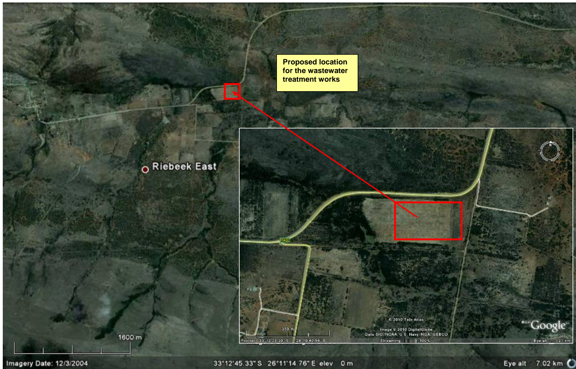
Map 2. Aerial views of the location of the proposed wastewater treatment works on Erf 202 at Riebeek East.