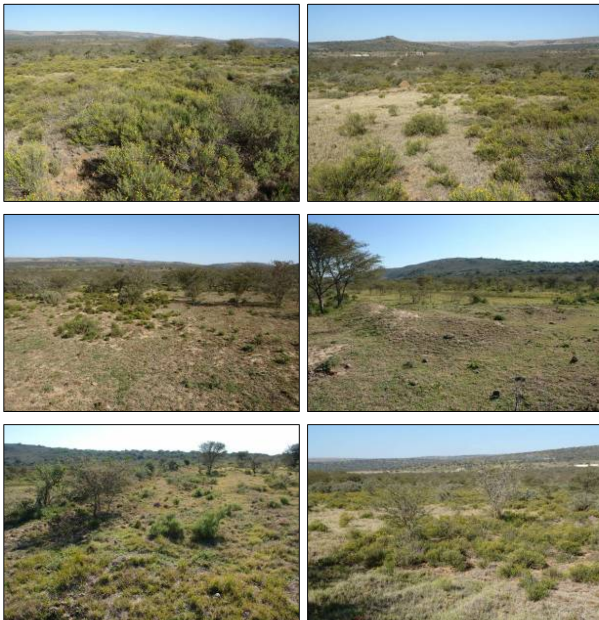
Figs 1-4. Different views of the proposed location for the construction of a wastewater treatment works. The red arrow indicates the location of the dam wall and the circle the water level.

The investigation was conducted on foot. GPS readings were taken with a Garmin and all important features were digitally recorded. The proposed area for the construction of a wastewater treatment works is relatively level with a slight slope to the south. The area comprised of old ploughed fields covered with low scrubs, grass and patches of thorn trees. (Figs 1-4). No archaeological sites/materials were found during the survey, and in general it would appear unlikely that any archaeological heritage remains will be exposed during the development. There are no buildings or graves older than 60 years on the property.