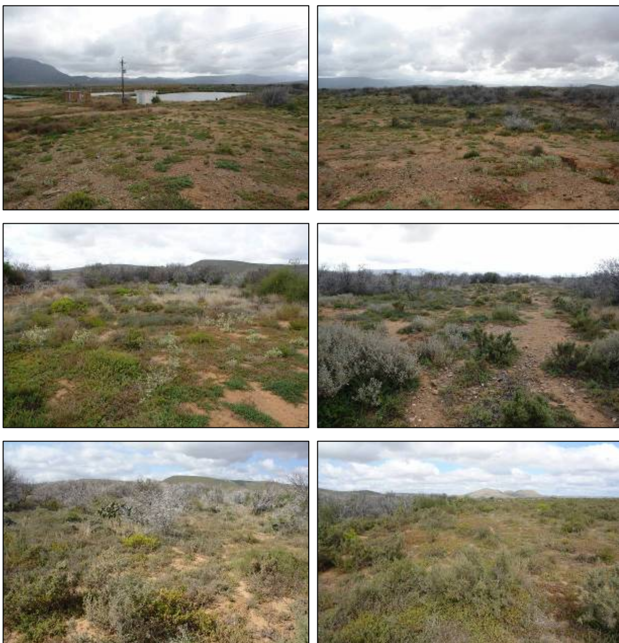
Figs 1-6. Different views of the proposed indicate the location of the proposed refurbishment of the Willowmore wastewater treatment works.

The investigation was conducted on foot. GPS readings were taken with a Garmin and all important features were digitally recorded. The proposed property for the extension of the waste water treatment works is situated on a relatively flat flood plain east of the small dry Steyns River. Construction of dams, roads and fences has disturbed the area in the past. The surrounding area is covered by dense grass and low bushes and patches of thorn trees (Figs 1-6). Only two weathered hornfels Middle Stone Age stone tools were observed in secondary context. In general it is unlikely that any archaeological remains will be exposed during the development. There are no buildings or graves older than 60 years on the property.