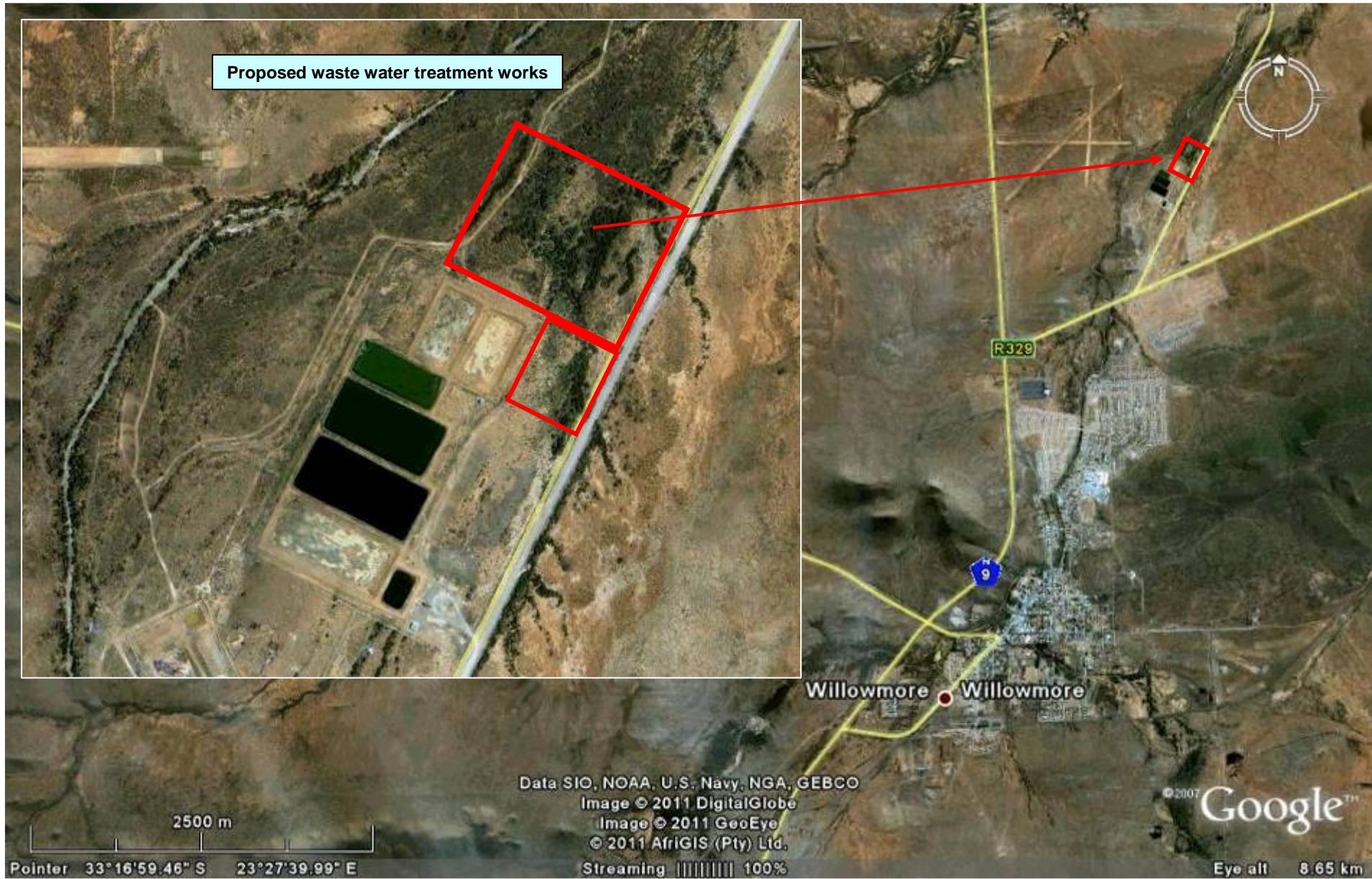
Map 2. Aerial views indicate the location of the proposed refurbishment of the Willowmore wastewater treatment works.