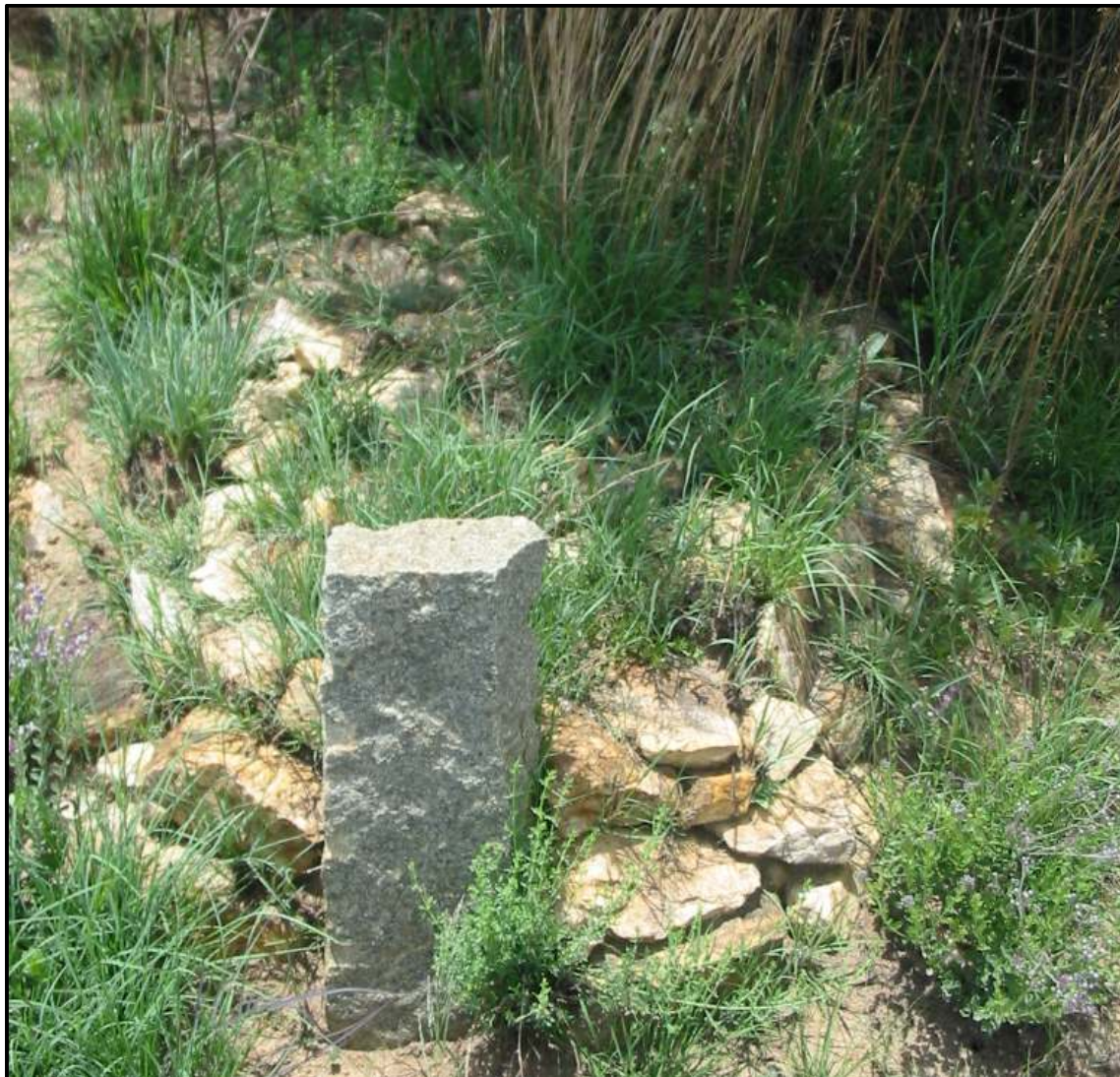
Figure 3: Stone packed grave