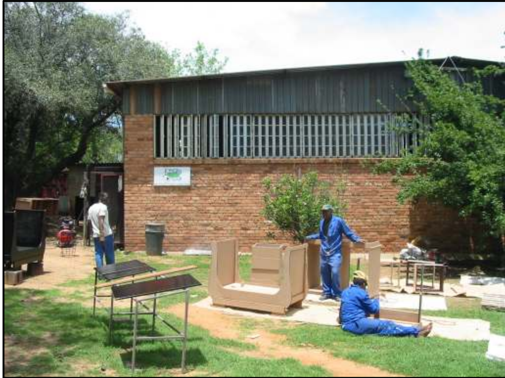
Figure 2: Structure on site

Several residential dwellings and associated outbuildings occur on site. These buildings are not older than 60 years and therefore not protected by legislation.