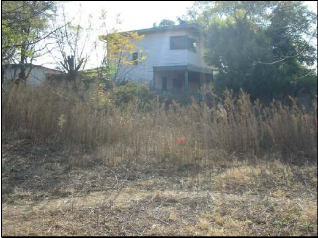
Figure 3: Residential dwelling