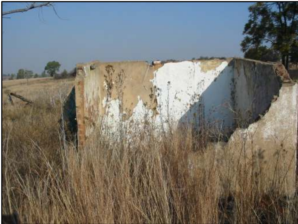
Figure 4: Partly demolished structure