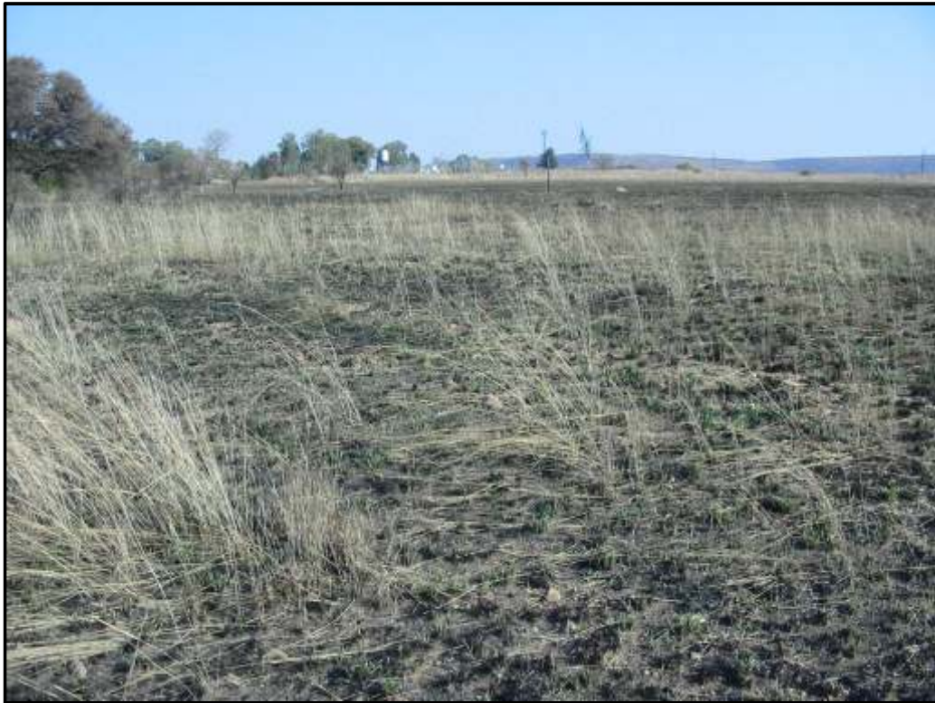
Figure 2: General Site Conditions

At present a residential dwelling with associated outbuildings exist on site that is not indicated on the archival maps. This building can therefore not be older than 60 years and is not protected by legislation. The area is characterized by the dumping of building rubble, irrigation furrows, dams and partly demolished buildings (that is also not indicated on the archival maps). Ground visibility is fair in some parts of the study area due to a recent field fire.