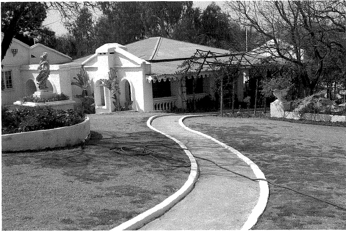
Figure 2a. Office.