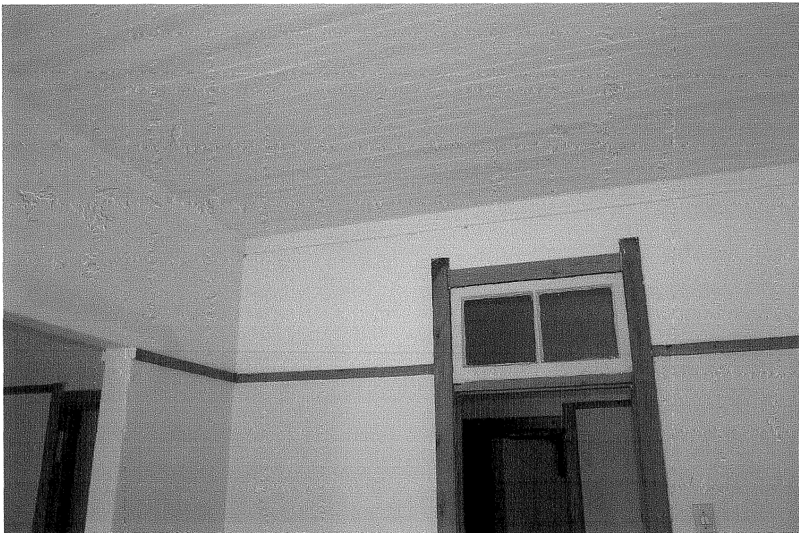
Figure 2b. Wooden ceiling inside office.