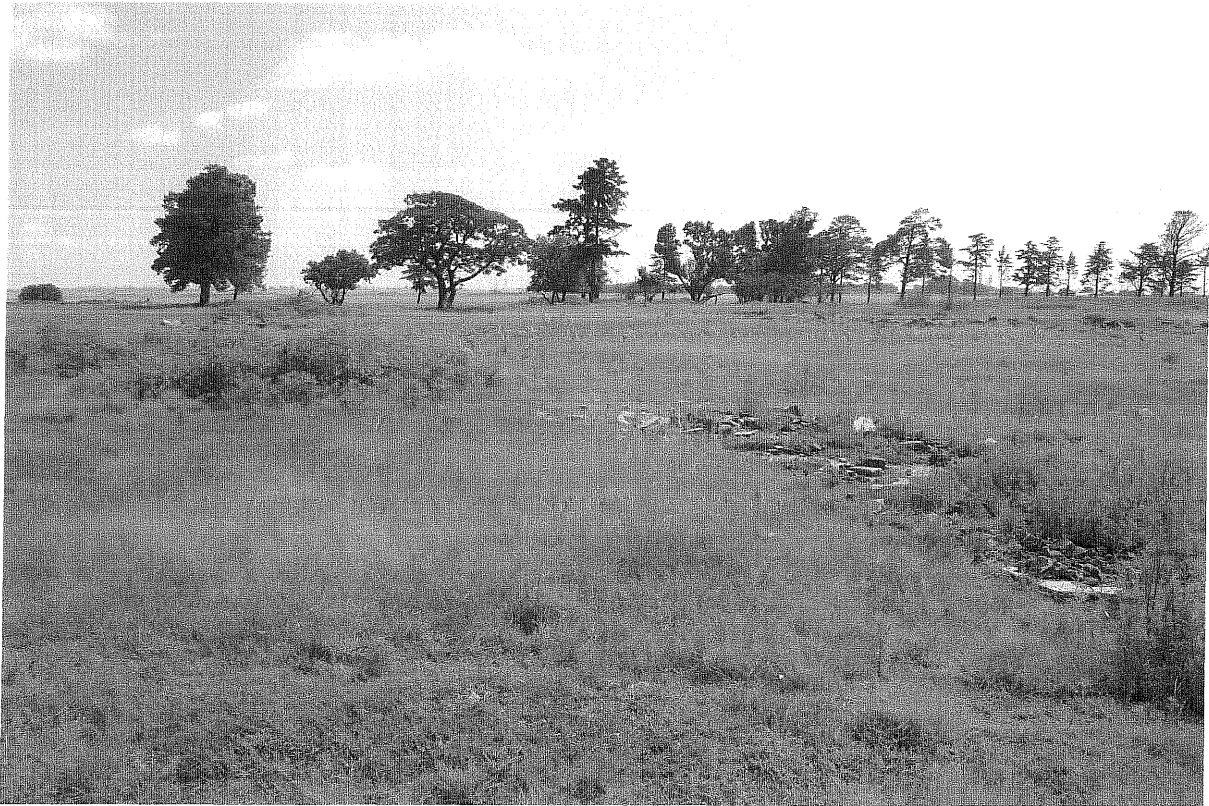
Figure 3. Remains of site 2, Zuurbekom farm.