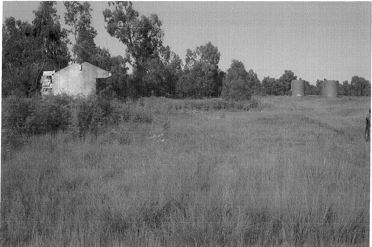
Figure 2. African housing and silos at site 1.

18S; 27 47E) includes the foundations of African housing and standing silos inside a gum tree plantation (Figure 2). The second, the Zuurbekom Farm (Site 2: 26 16S; 27 46E), is marked by the foundation of the main house and a few other structures and trees (Figure 3). In both cases, the farms appear too recent to have had their own cemeteries. They also appear to be less than 60 years old, and thus of no historical significance.