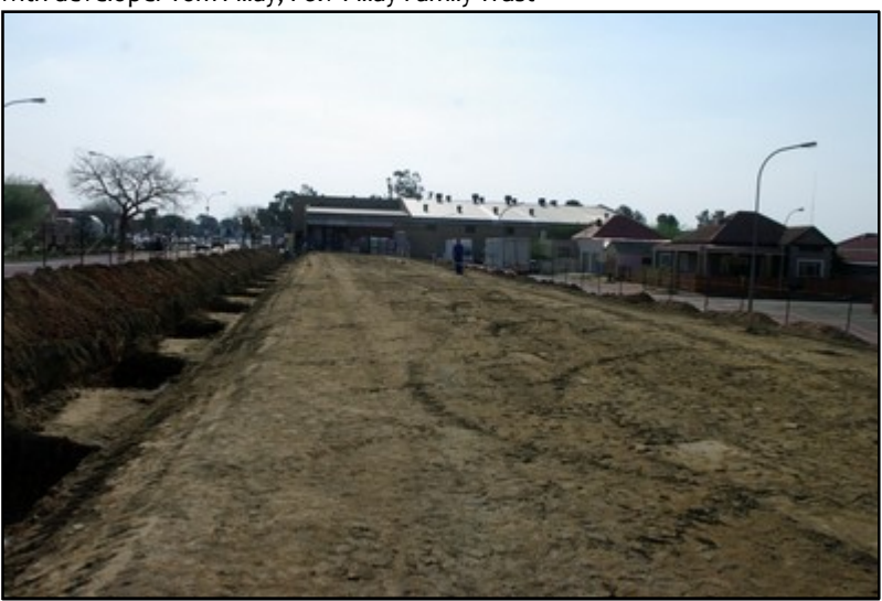
Plate 12: General site view after foundation trenching, with the Samy's wholesalers depot in the background