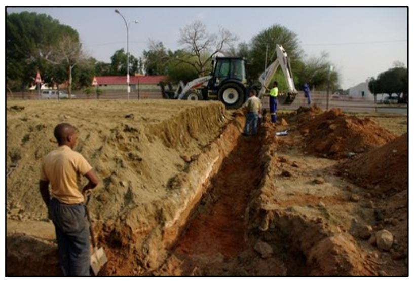
Plate 4: Mechanical trenching – western structure foundations