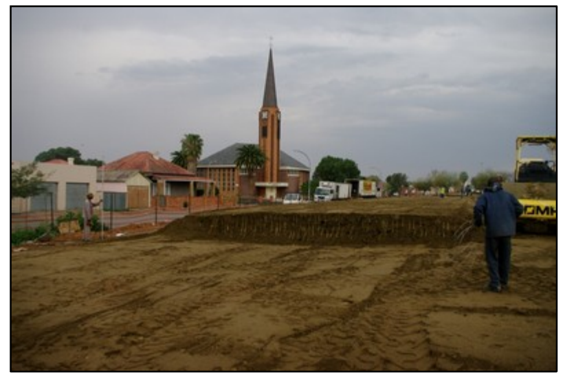
Plate 1: Final site measurements prior to mechanical trench foundation excavations