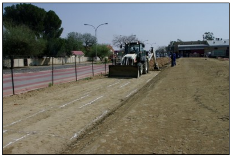
Plate 7: Foundation demarcation and trench excavation, southern structure foundations