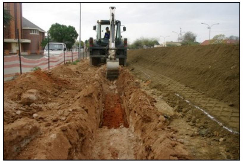
Plate 2: Mechanical trenching – northern structure foundations [1]