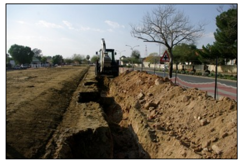
Plate 5: Mechanical trenching – southern structure foundations [1]