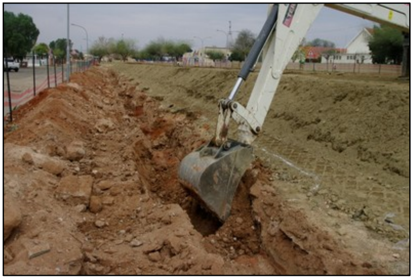
Plate 3: Mechanical trenching – northern structure foundations [2]