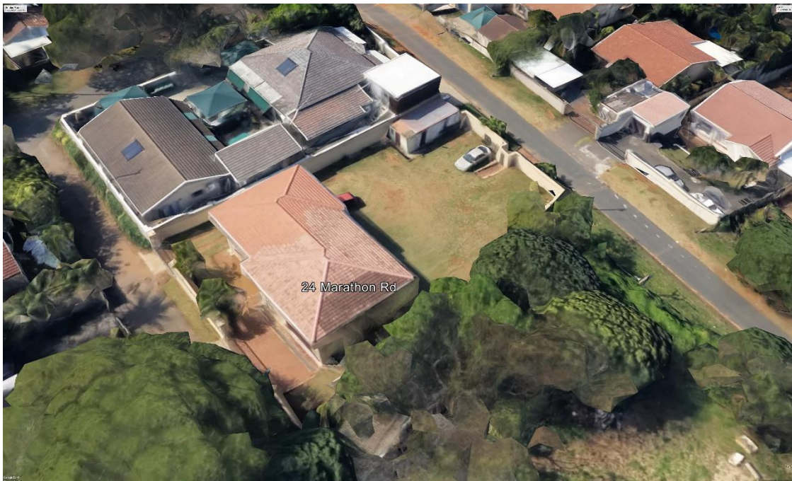
AERIAL VIEW OF 24 MARATHON ROAD