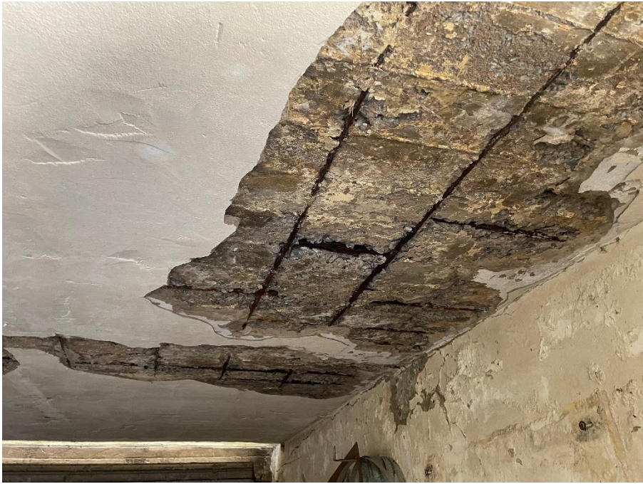
INTERIOR SLAB VIEW