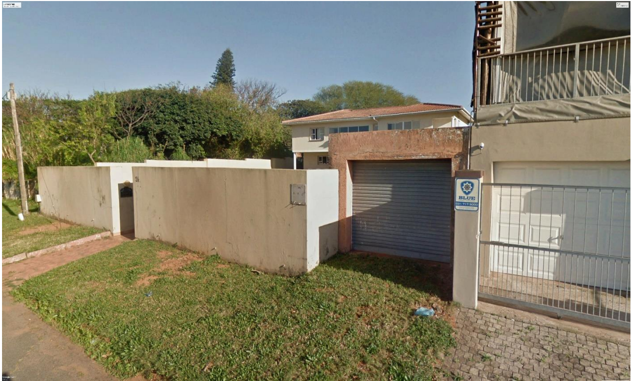
FRONT ELEVATION OF HOUSE