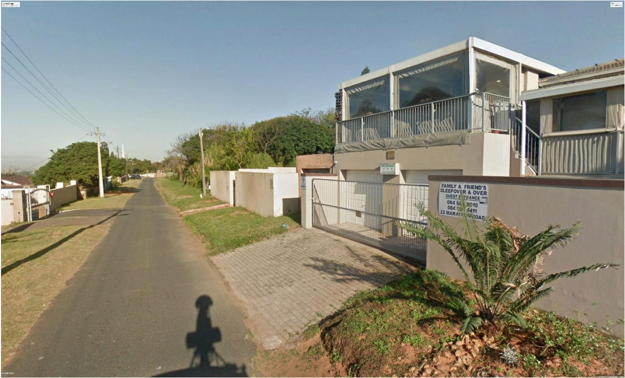
STREET VIEW LOOKING WEST