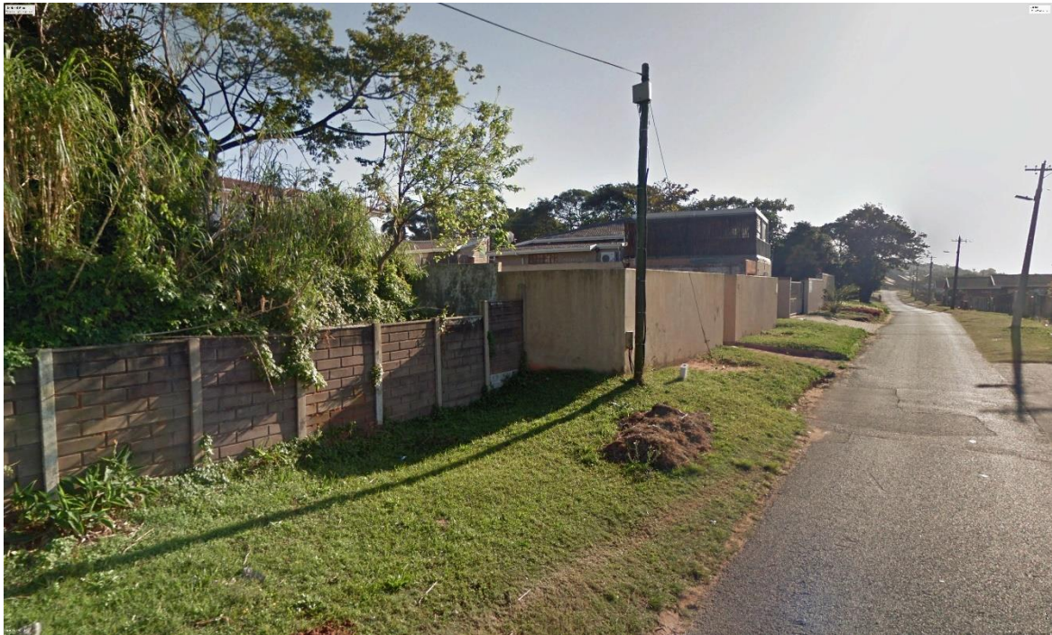
STREET VIEW LOOKING EAST