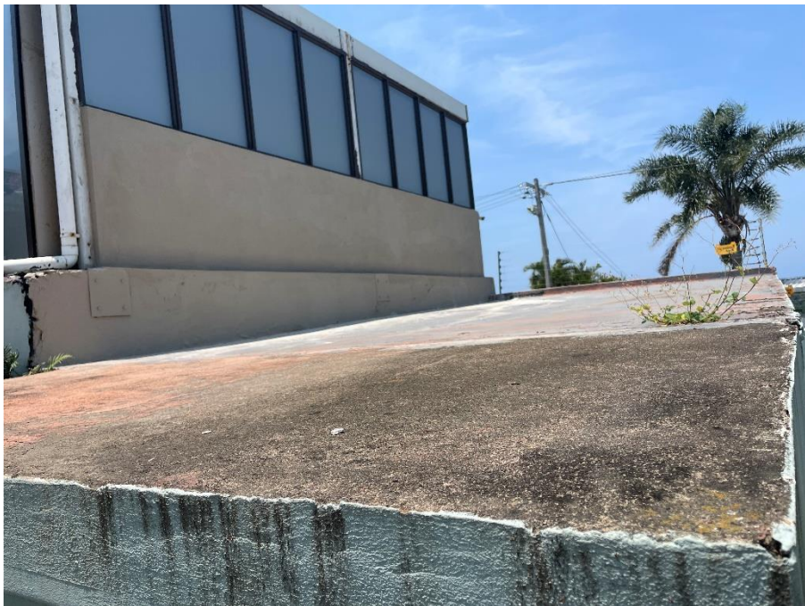
TOP OF GARAGE VIEW