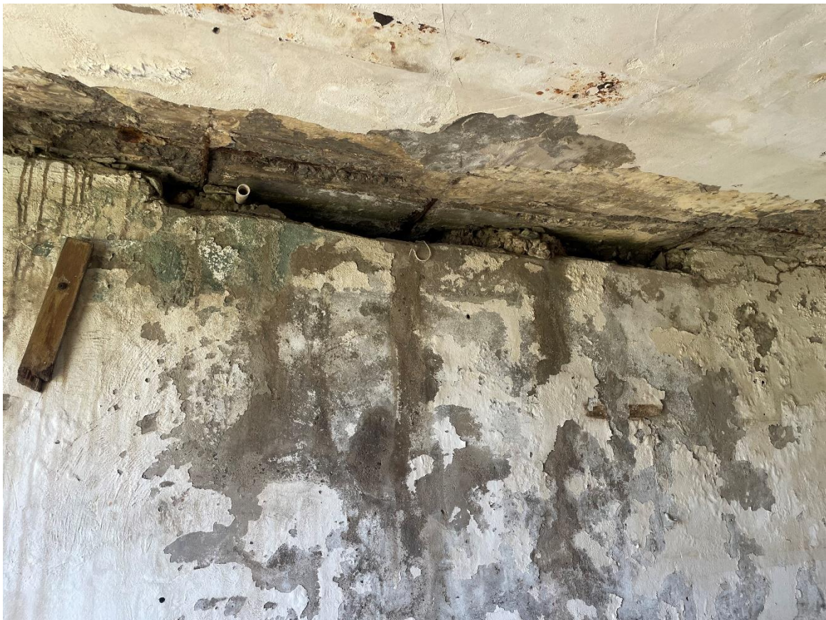
INTERIOR VIEW OF GARAGE (CRACKED SLAB WITH WATER SEEPING IN)