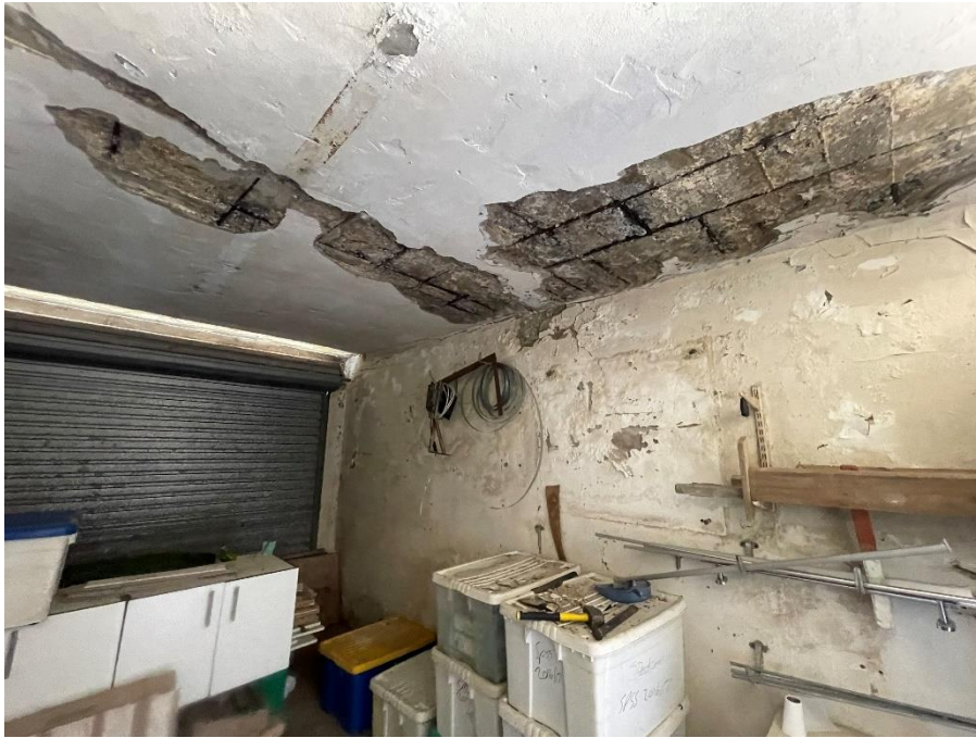
INTERIOR VIEW OF THE GARAGE (SLAB DAMAGE AND EXPOSED STEEL)