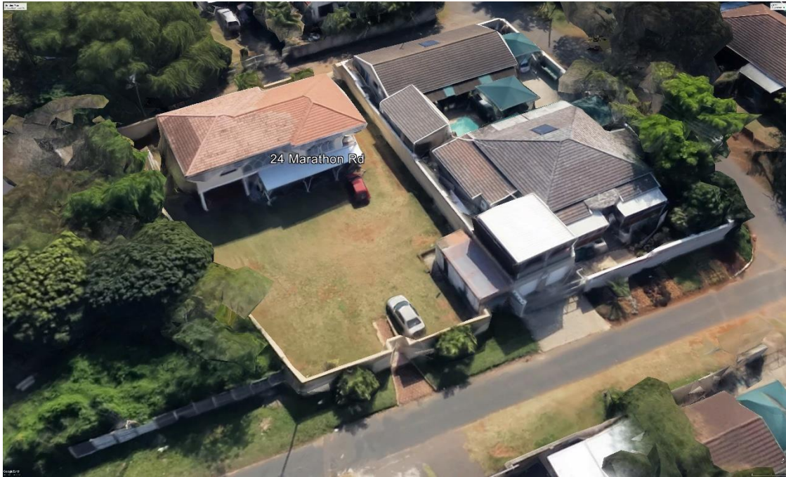
AERIAL VIEW OF 24 MARATHON ROAD