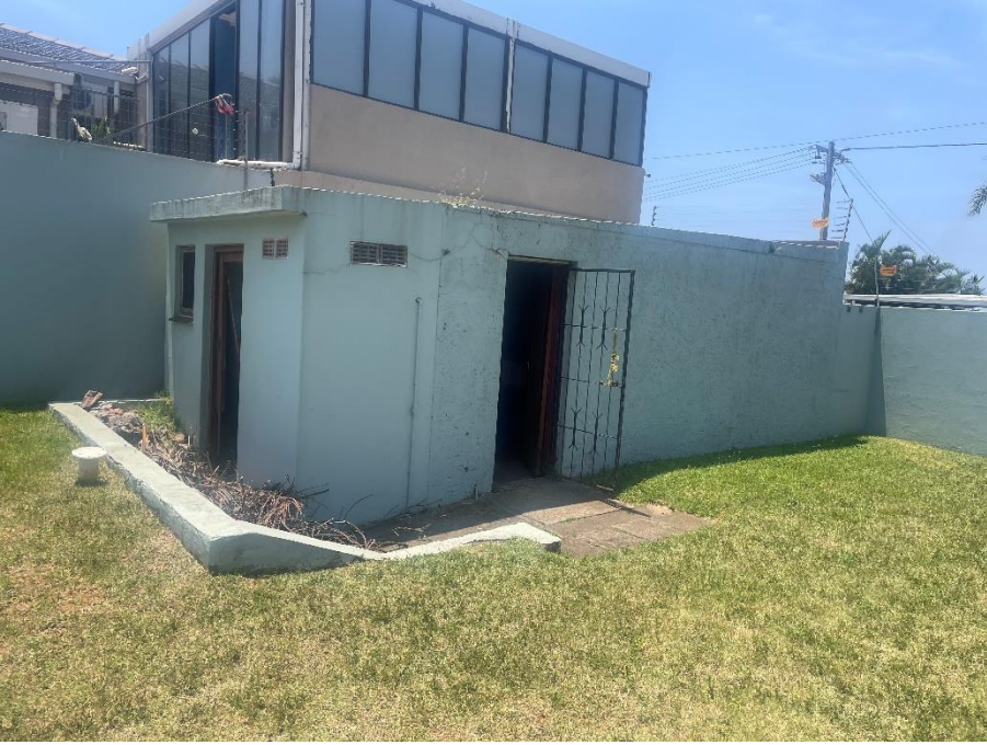
VIEW OF THE GARAGE FROM THE INTERIOR OF THE SITE