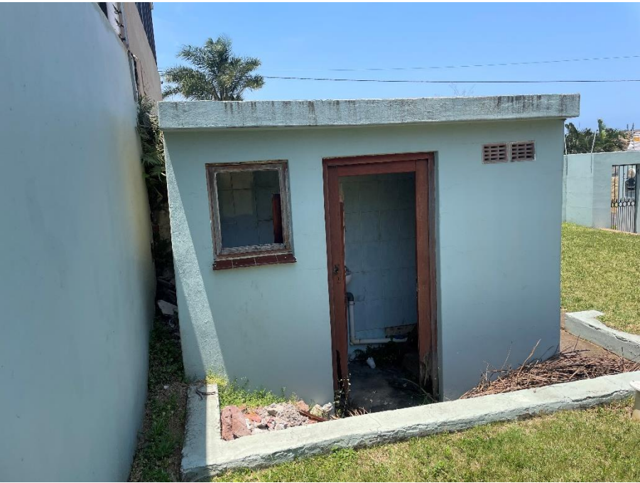
BACK ELEVATION OF THE GARAGE FROM THE SITE