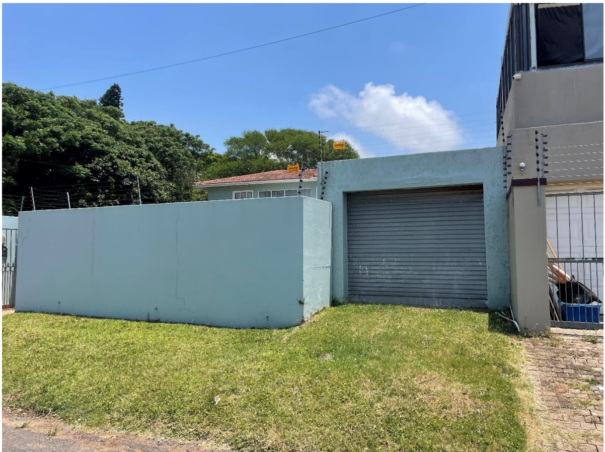
FRONT ELEVATION FROM MARATHON ROAD – NORTH-EAST ELEVATION