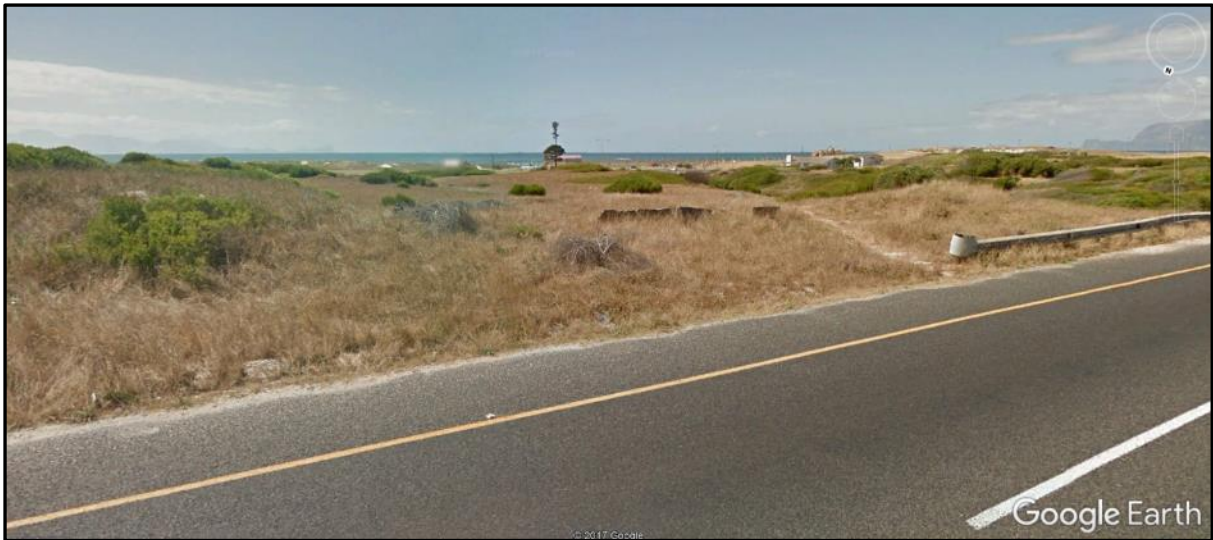
Photograph 1: Stranfontein pavilion seen from Baden Powel Dr to the north east of the intersection with Strandfontein Rd (Google Earth Street View, September 2009)