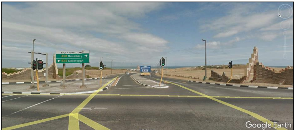
Photograph 2: Entrance to Strandfontein Resort off Baden Powel Dr, looking south from intersection with Strandfontein Rd (Google Earth Street View, September 2009)