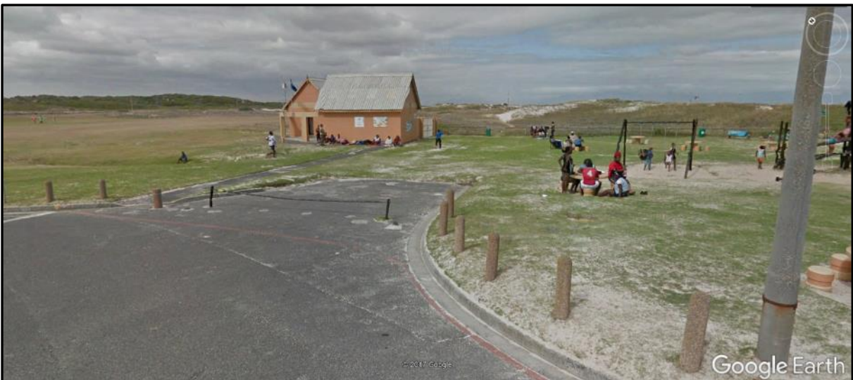
Photograph 6: Southernmost portion of desalination plant site (left of building). The brine discharge pipeline would be located approximately 20 m to the east (behind) the building; the raw water pipeline would be located to the west of the building (viewer's side), and skirt the playground to the west (immediate foreground).