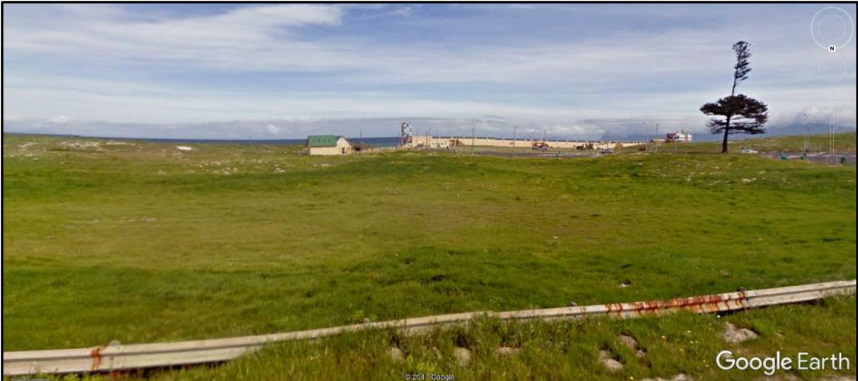
Photograph 5: Desalination plant site seen from east along internal road north of parking area (Google Earth Street View, September 2009)