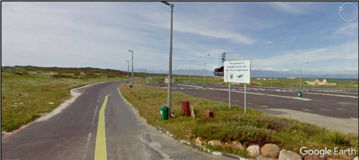
Photograph 3: Internal Rd to the north of the parking terrain west of the Strandfontein Pavilion, looking east.

The proposed desalination plant site is located at the far (eastern) end of the parking area. The treated water injection pipeline would be aligned to the north of the road (i.e. left in the photo).