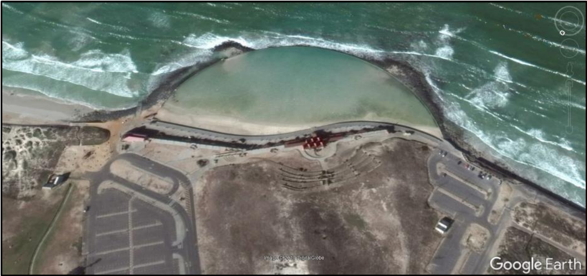
Photograph 9: 2017 satellite image of tidal pool.