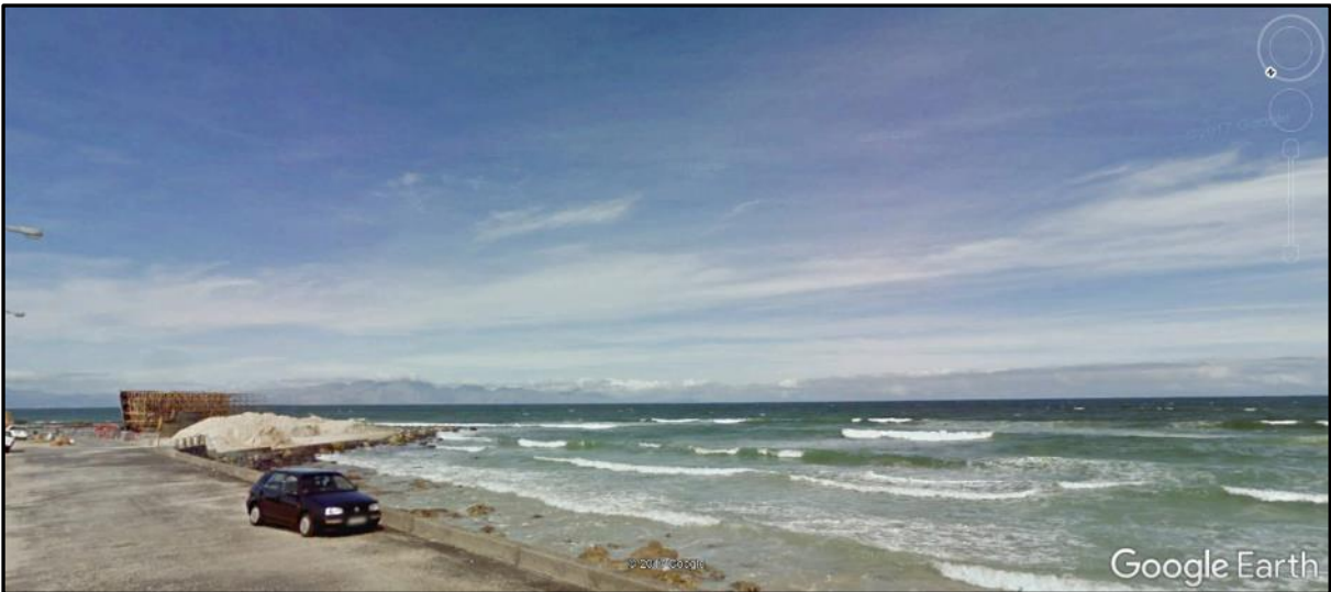
Photograph 10: Tidal pool viewed from parking area to the west of the Pavilion (Google Earth Street View, September 2009)