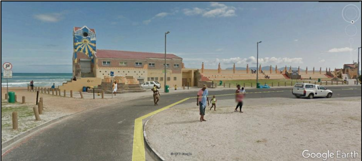
Photograph 7: Strandfontein Pavilion viewed from north-east.