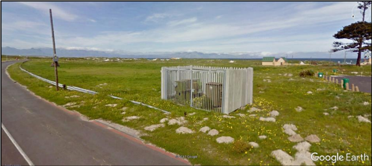
Photograph 4: Desalination plant site seen from parking area west of Pavilion, looking east. The site immediately behind the electricity infrastructure.

(Google Earth Street View, September 2009)