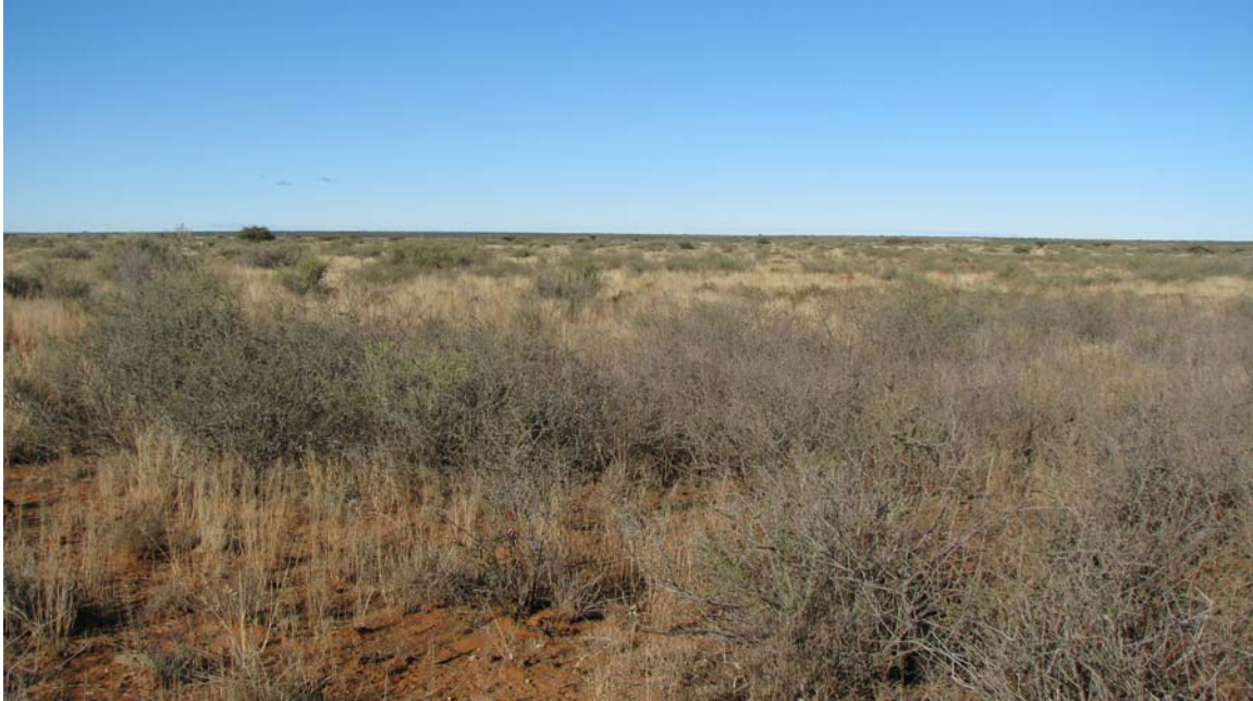
View across the Greefspan site.