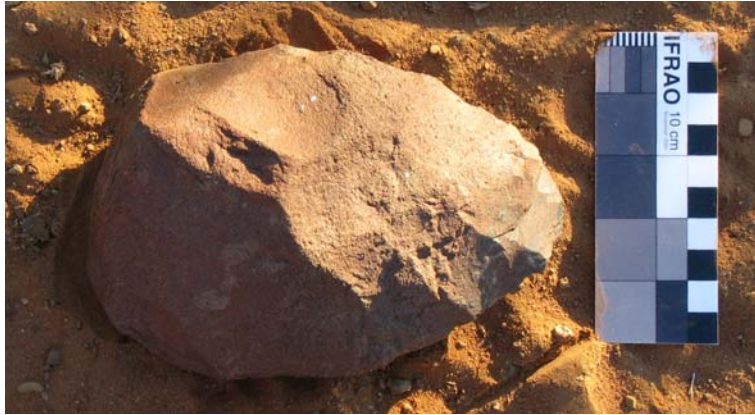
Handaxe at 29^{\circ}23'34.3'' S 23^{\circ}18'23.4'' E (above) and Victoria West core at 29^{\circ}23'30.9'' S 23^{\circ}18'34.6'' E (below)

No finds during the extended survey contradicted the conclusions from the June 2010 survey.