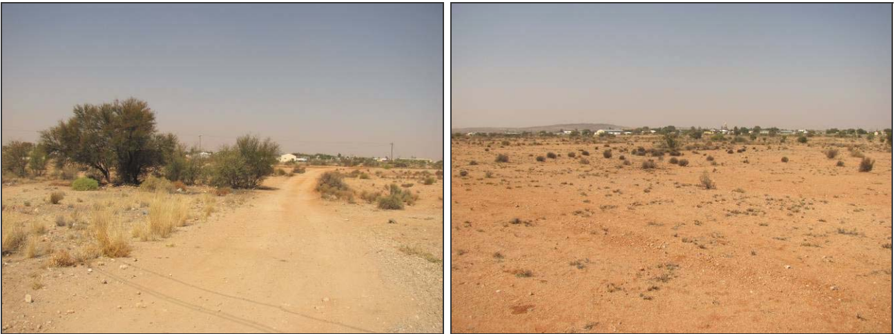
(l&r) The receiving environment looking east towards Pofadder