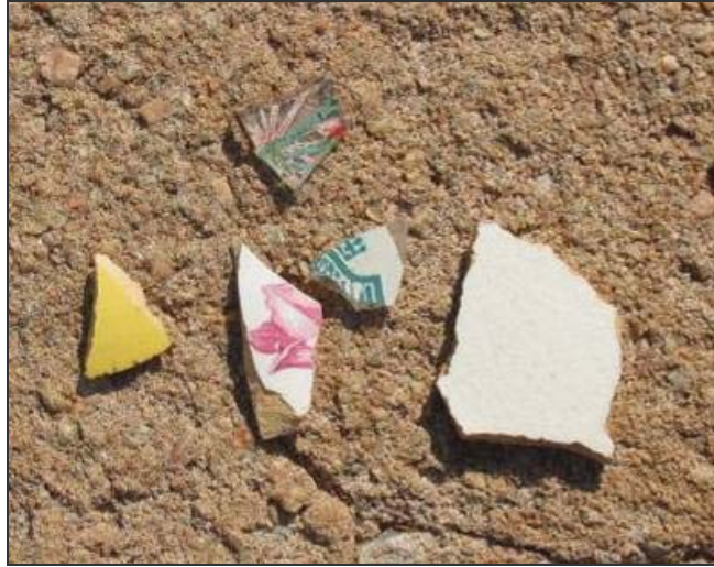
Ceramics and glass found near the ruin at PO2