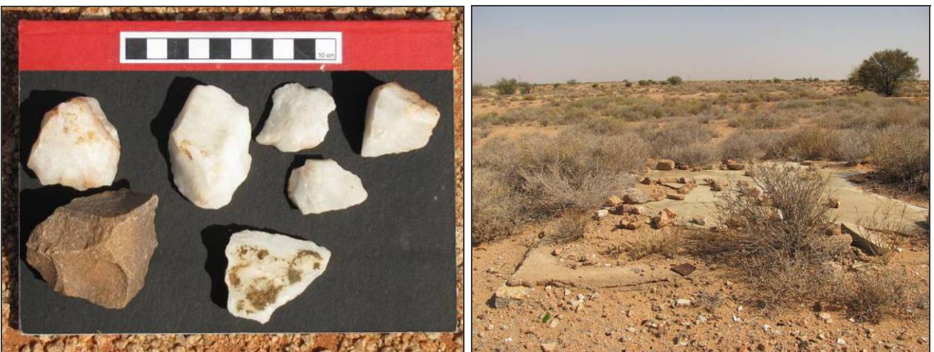
(l) Examples of artefacts, probably Middle Stone Age, quartz and quartzite from PO1 (r) The foundations of a small house - PO2