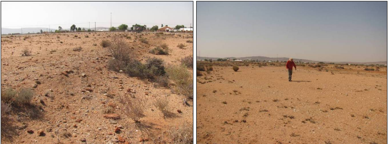
(l) a possible pipeline runs n-s marked by a low soil mound (r) typical flat surfaces where artefacts are found - this is PO1