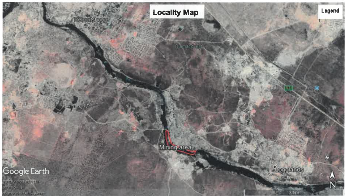
Figure 2: Google-Earth map shows the location of the proposed mining on the Vaal River between Longlands and Delpoortshoop.

Over a period of thousands of years the Vaal River has flowed over a wide plain with its water channels shifting and in the process depositing gravels mixed with sand. Geological theory has it that the diamonds were eroded from kimberlite pipes and deposited along the course of the river.