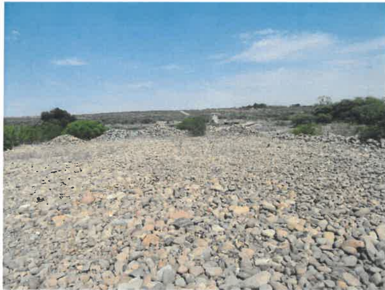
Figure 5: Evidence of recent mine workings.