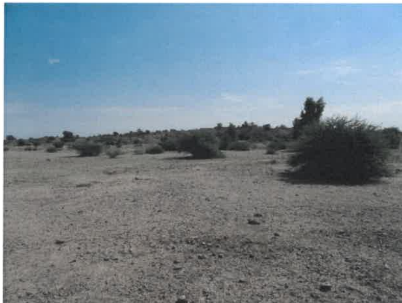
Figure 6: Degrade vegetation, acacia bushes.