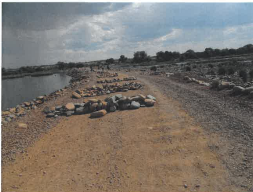
Figure 7: Drift across the Vaal River at Gong Gong now controlled by members of the local community.

River used by miners and farmers (Figures 7). They were demanding an informal levy. The agreement between Kimswa Mining Pty Ltd and the Community Property Association to establish a mutually beneficial partnership to provide employment relief through a quota system in favour of local youth is therefore hailed as a practical remedy likely to bring material benefits in the short term. This is strong motivation for the proposed mining project.