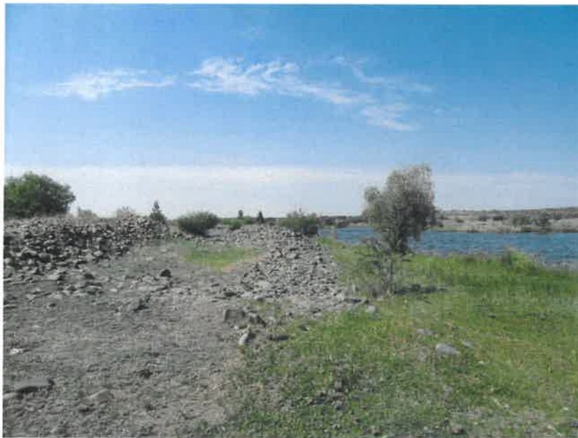
Figure 4: Stone dykes on the north bank of the Vaal River