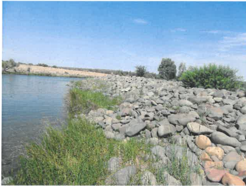
Figure 8: Stone dyke on the bank of the river dyke (Lat: 28°27'21.1"S, 24°19'48.5"E)