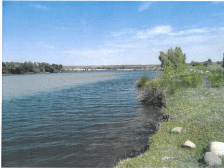
Figure 3: Section of the Vaal River shows the north bank.

after the alluvial action. Vegetation is largely degraded mixed scrub of the Kimberley Thornveld dominated by acacias (Figures 2-6).