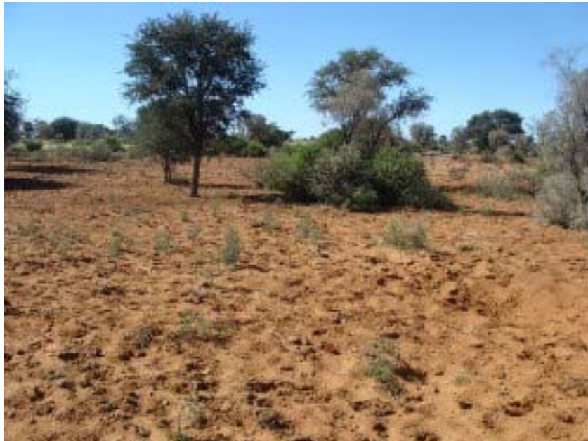
Figure 5: Another view of the area, showing exposed sand because of grazing.