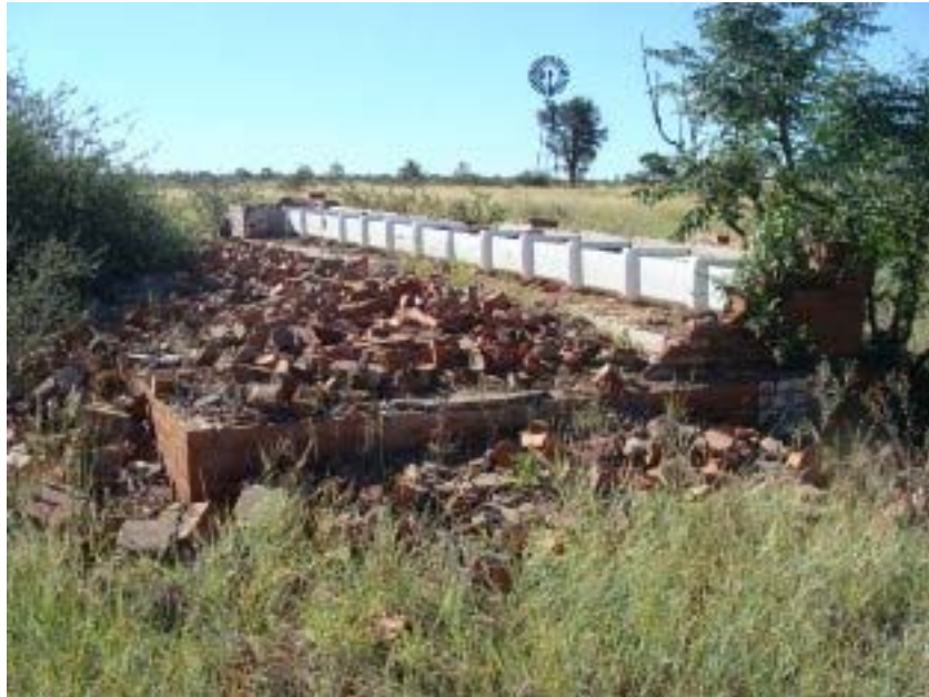
Figure 11: Remains of bathroom facilities on the site.