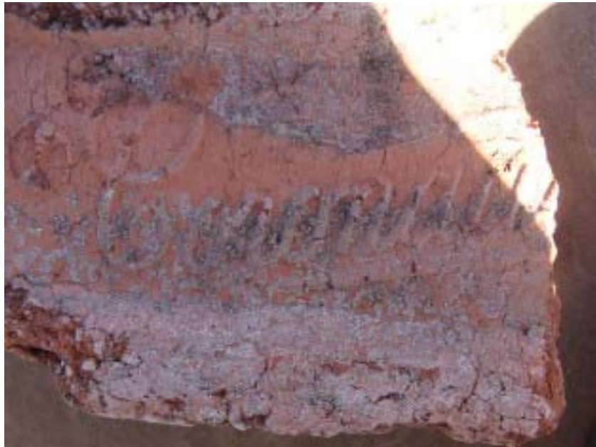
Figure 10: One of the bricks found.