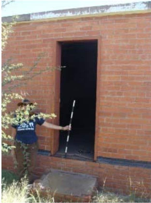
Figure 13: The best preserved structure on the site. Function unknown.