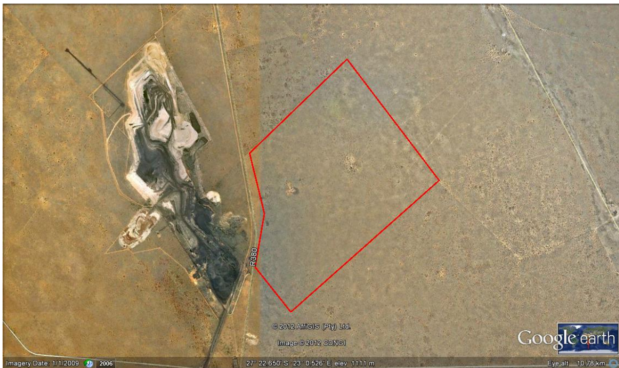
Figure 1: Aerial location of development. Note the location of Mamatwan Mine close to the area.

It does not seem that the area has been disturbed through agricultural activities such as crop growing in the past, although it has been used extensively for cattle grazing. Portions of the farm are still being used for this purpose. Mining activities (possibly related to the Mamatwan mine) is evident in the area and the one site recorded here forms part of this. Other developments that have impacted on the area in the past is the development of the ESKOM substation, powerline and pylons and road that runs between the farm and Mamatwan Mine.