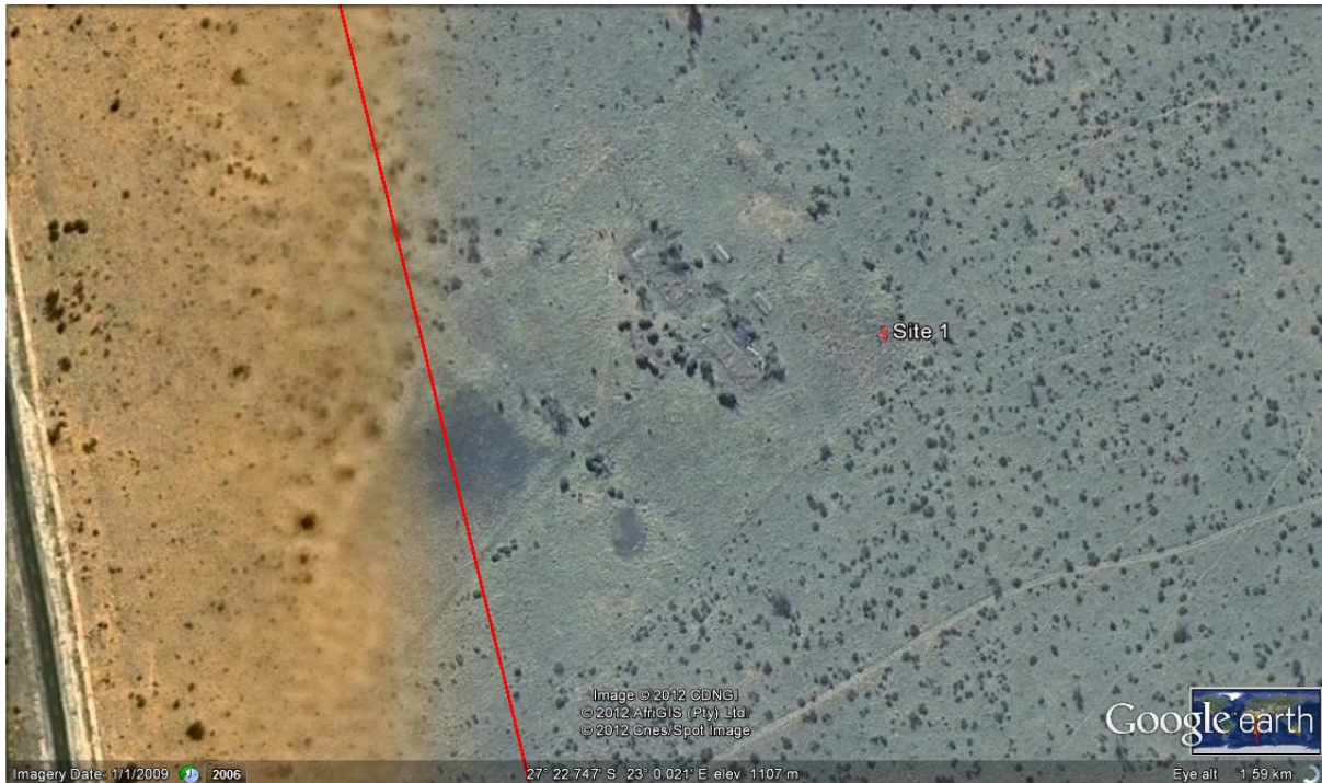
Figure 15: Closer aerial view showing remains of mining hostel/compound.