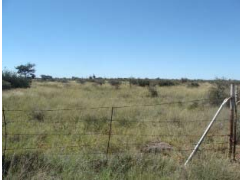
Figure 4: General view of the area.