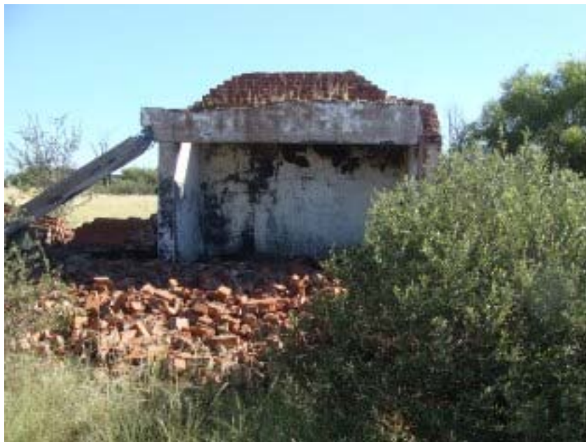
Figure 12: Another structure found here. Function unknown.