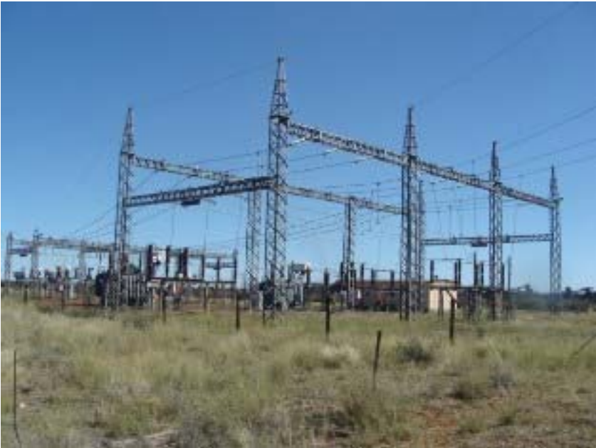
Figure 3: View of the ESKOM Substation in the area.