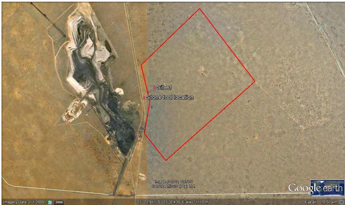
Figure 14: Aerial view of area with finds indicated.