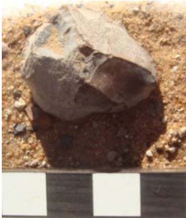
Figure 8: MSA core tool found in the area.