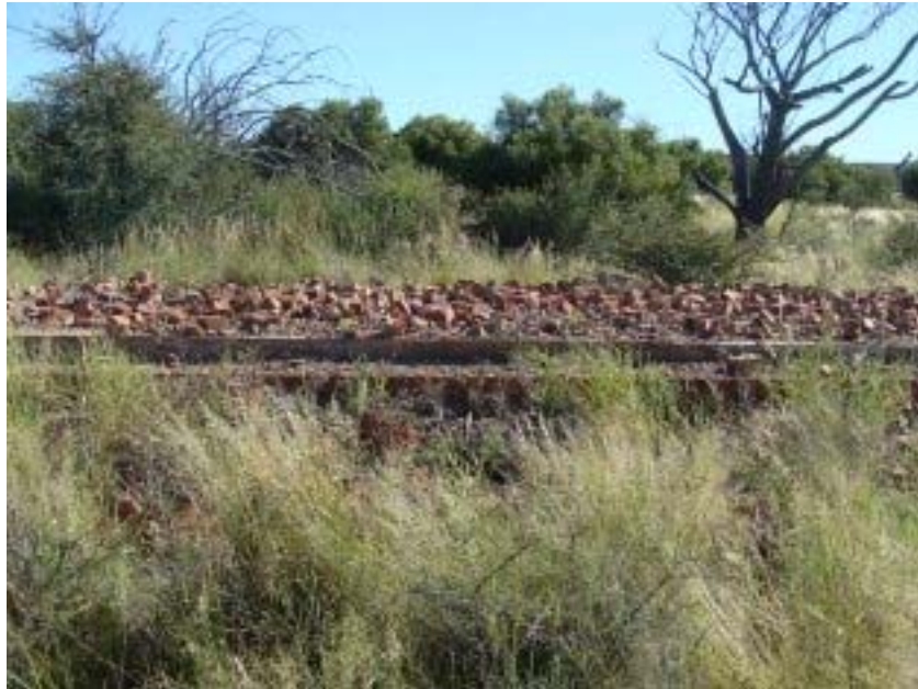
Figure 9: One of the structures on the site.