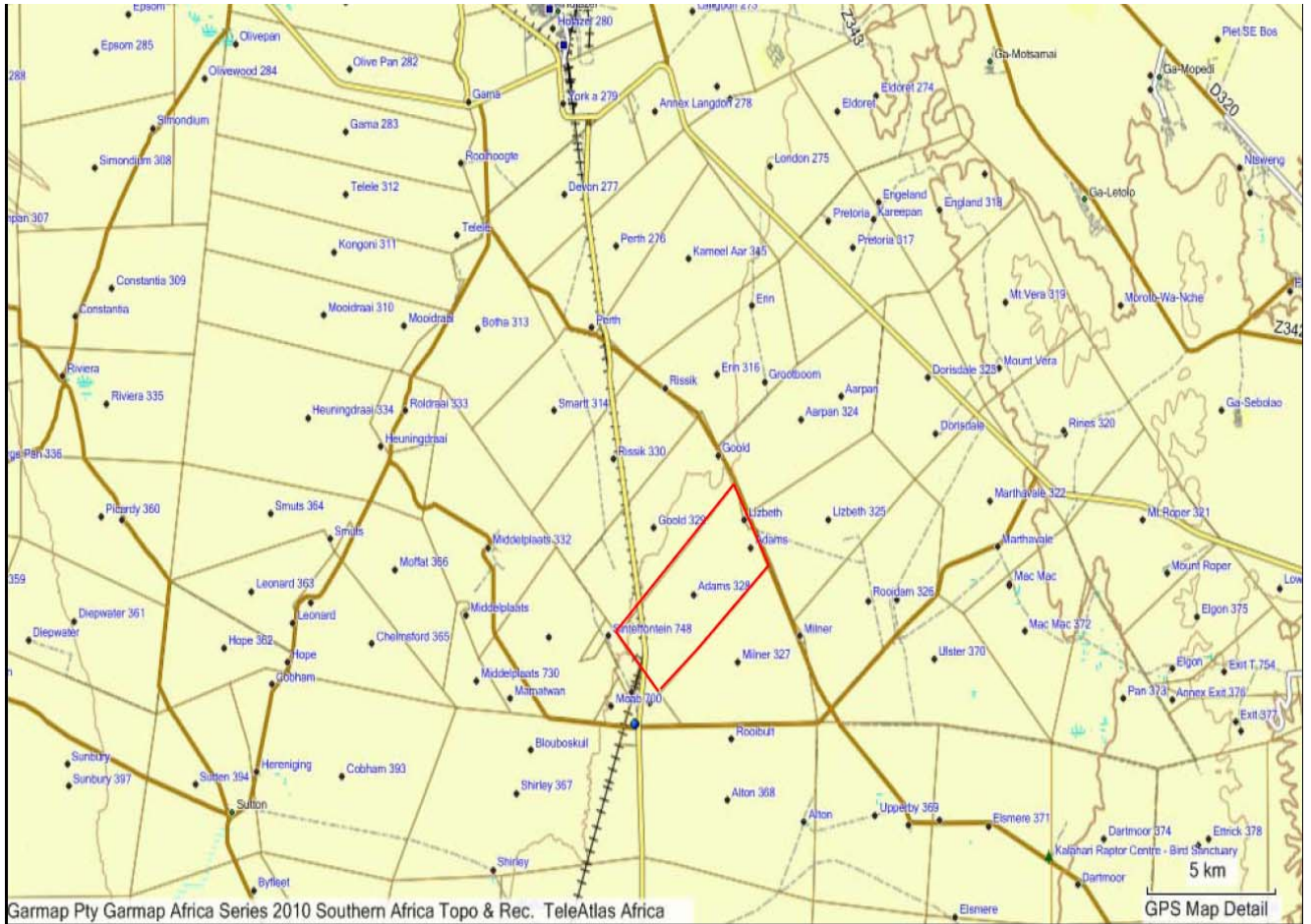
Figure 2: Topographic Location of development