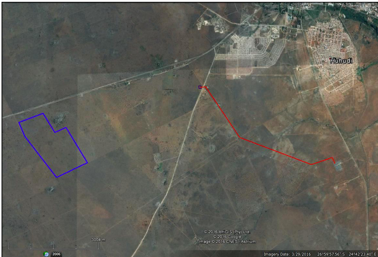
Figure 2: Google earth© satellite image showing the location of the proposed AMDA Foxtrot Solar PV Development in flat terrain on the south-western outskirts of Vryburg, Northwest Province (purple polygon). The red line shows the route for the proposed 132 kV transmission line connecting the solar projects on farm Klondike 670-IN to the existing Mookodi Substation south of Vryburg.