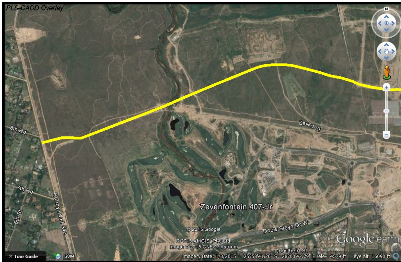
Google Map of area