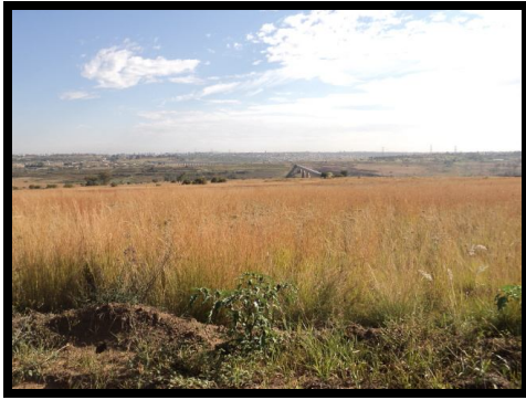
Highveld grassland and weeds on the route

At S25° 57' 38.9" & E27° 59' 31.4" is a patch of exotic trees which is an indication of a possible early farm workers settlement. The site was inspected but no remains were found as the area was bulldozed – see photographs.