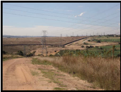
Dirt road to river on the proposed route