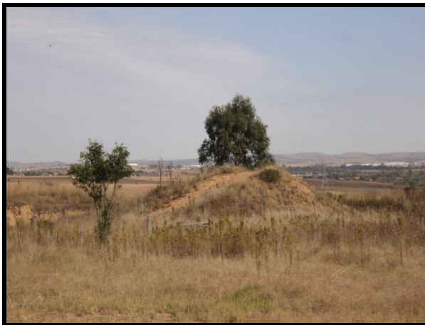
Wall around the Estate and Golf Course