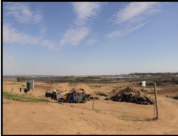
Scrambler Obstacle Course

up to die Jukskei River. This section of the road runs mainly through dense Highveld grassland and weeds and past the scrambler obstacle course (Miller Moore Racing) at S25° 57' 28.83" & E27° 59' 57.18. From this point it runs downhill to the Jukskei River at S25° 57' 52.50" & E27° 59' 23.21". It also passes a number of small dirt roads used for scrambler field racing. A high security wall of the new Golf Course then blocked the route near the river see photograph.