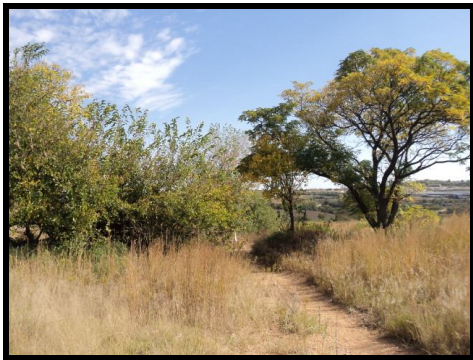
Exotic trees at possible farm workers settlement

At S25° 57' 38.9" & E27° 59' 31.4" is a patch of exotic trees which is an indication of a possible early farm workers settlement. The site was inspected but no remains were found as the area was bulldozed – see photographs.