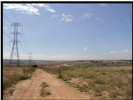
Proposed route of the new road