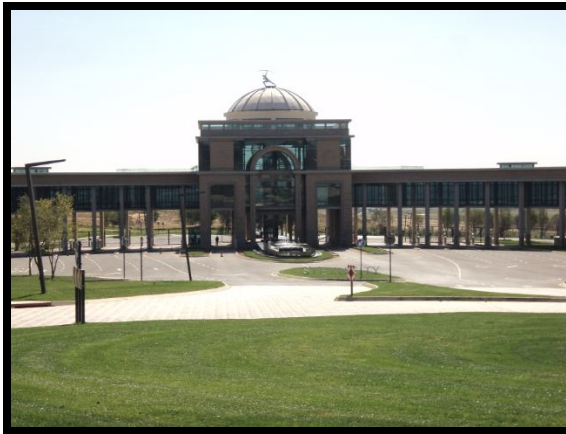
Entrance to Steyn City

No important Cultural Heritage Resources or graves could be found near or on the proposed route of the new road.