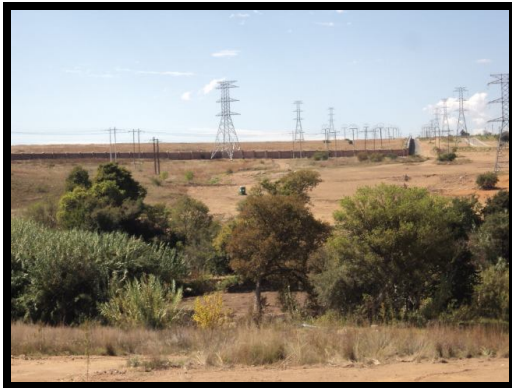
Jukskei River crossing and security wall on horizon

This section of the route runs mainly through old maize fields. Ploughing over a long period of time would have destroyed any possible heritage sites – see photograph.