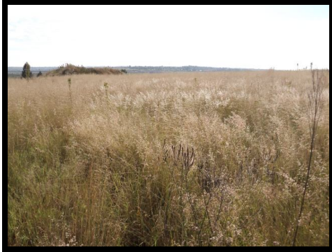
Highveld grassland and wheat

At S25° 57' 38.9" & E27° 59' 31.4" is a patch of exotic trees which is an indication of a possible early farm workers settlement. The site was inspected but no remains were found as the area was bulldozed – see photographs.