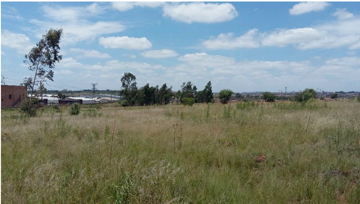
Figure 7: Another view of the site.