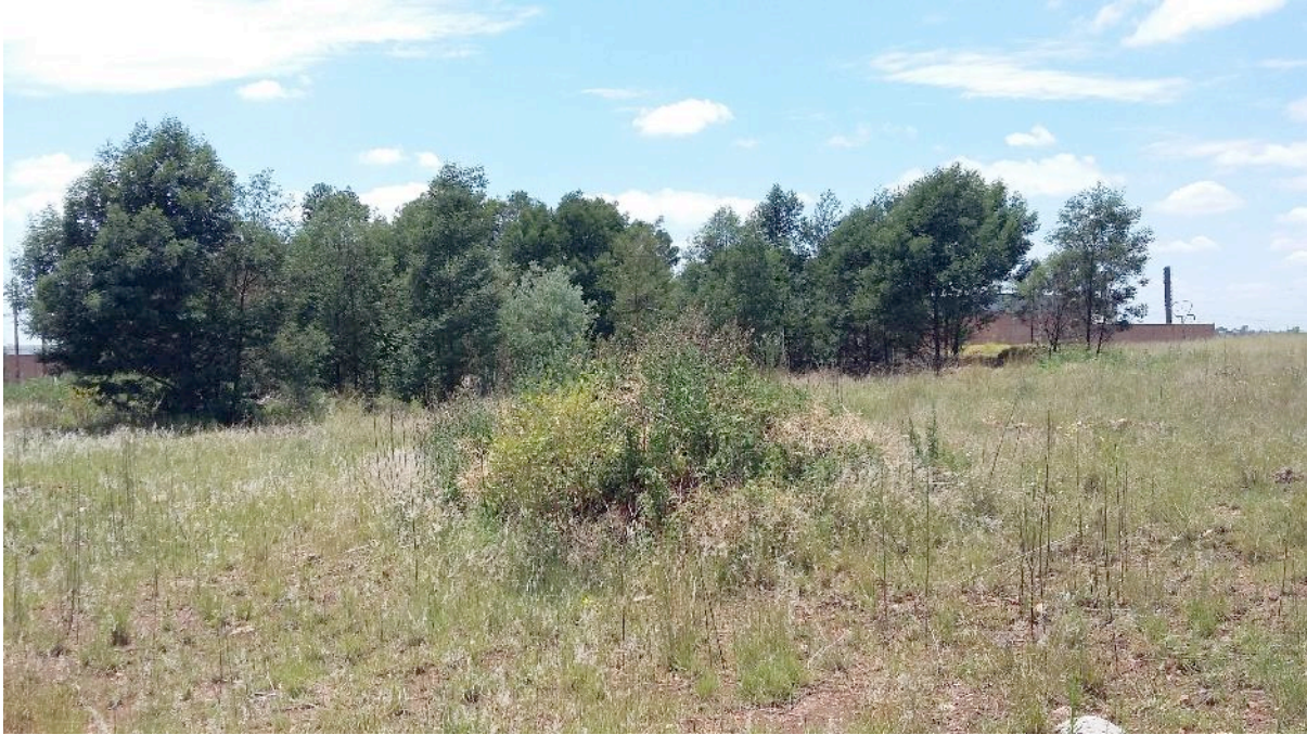
Figure 4: General view of the site.