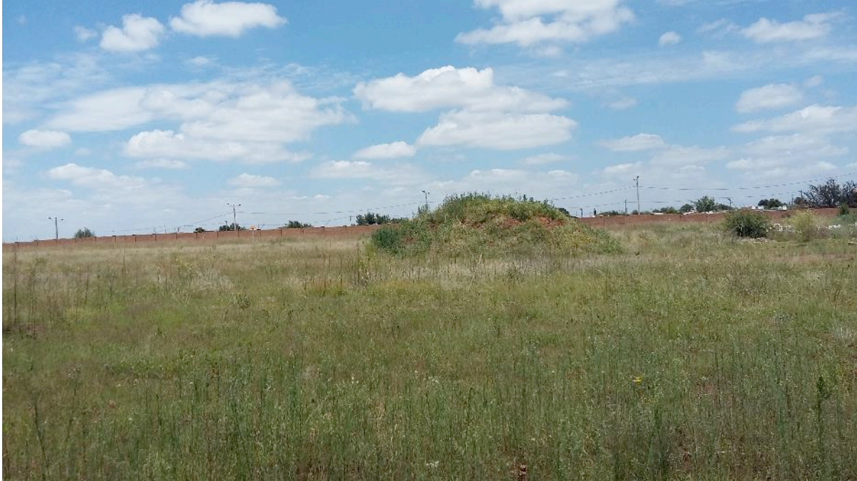
Figure 6: Another view of the site. Note the weeds and wall around the property.