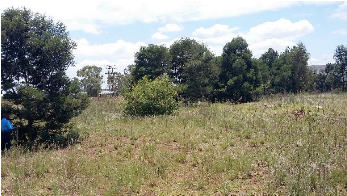
Figure 5: View of wattle plantations.