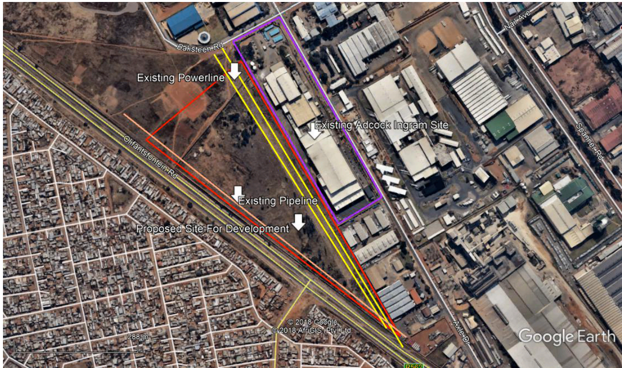
Figure 2: Site detail.