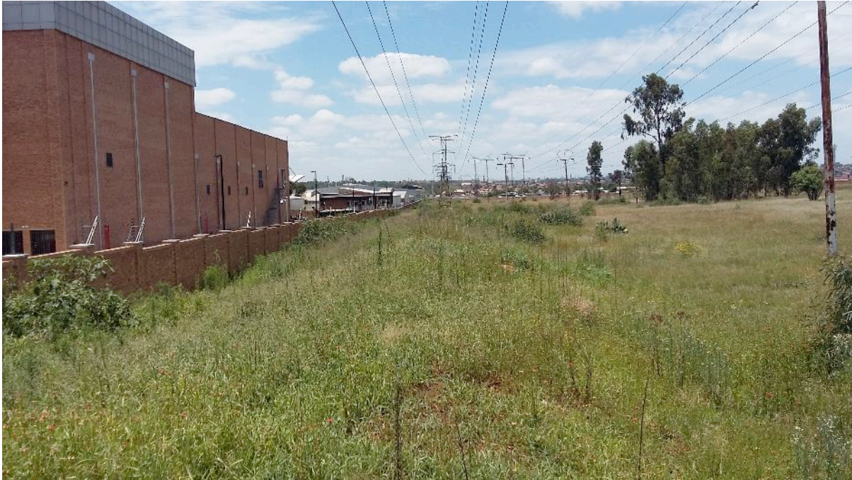
Figure 8: Note the fence wall and power lines.

Due to the mentioned factors, the chances therefore of finding any heritage related features are indeed extremely slim. It is therefore believed that an additional Heritage Impact Assessment (HIA) is not needed for this project. This letter serves as an exemption request to the relevant heritage authority.