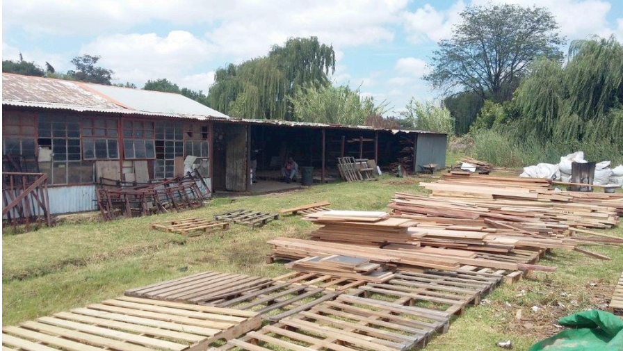
Figure 6: Closer view of building.

Due to the mentioned factors, the chances therefore of finding any heritage related features are indeed extremely slim. It is therefore believed that an additional Heritage Impact Assessment (HIA) is not needed for this project. This letter serves as an exemption request to the relevant heritage authority.