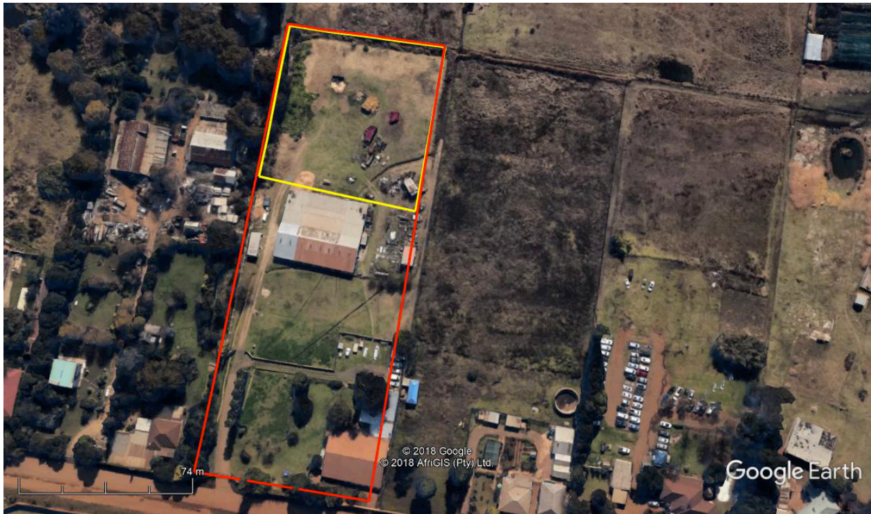
Figure 4: Detailed view of the site.