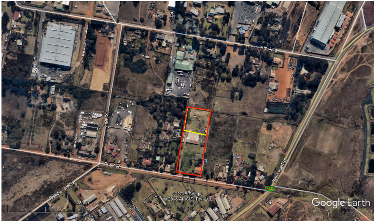
Figure 3: Detail of proposed areas considered for the development.

It is my opinion that the project may be exempted from doing a Heritage Impact Assessment (HIA). The following is applicable: