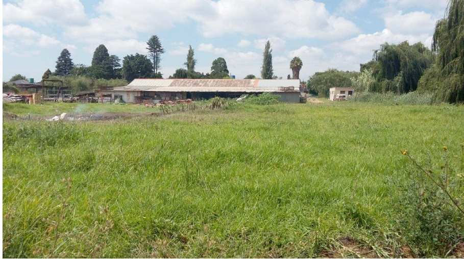
Figure 5: Building on site to be changed.