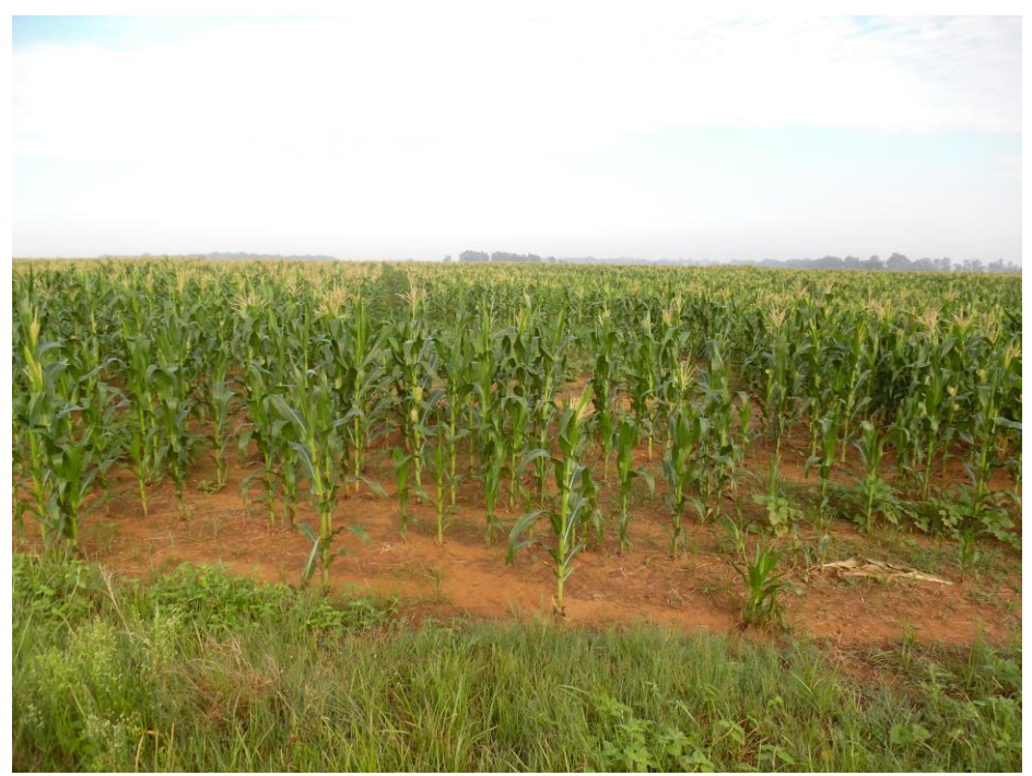
Figure 5: Proposed area for infrastructure