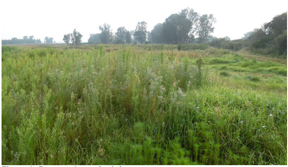
Figure 6: Proposed area for infrastructure