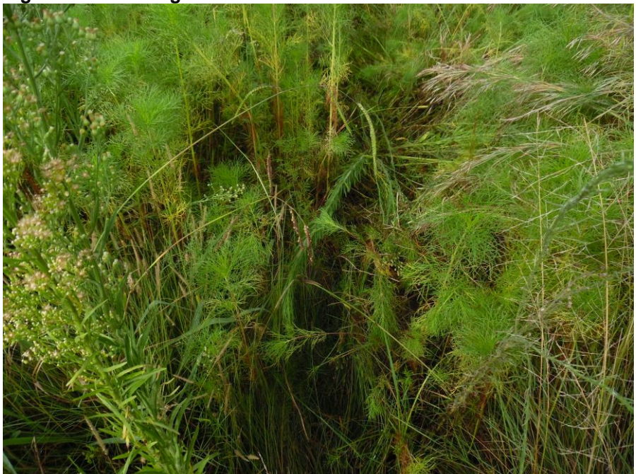
Figure 14: Grave

The possibility of graves not visible to the human eye always exists and this should be taken into consideration in the Environmental Management Plan.