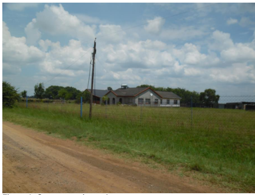
Figure 9: Structures situated area