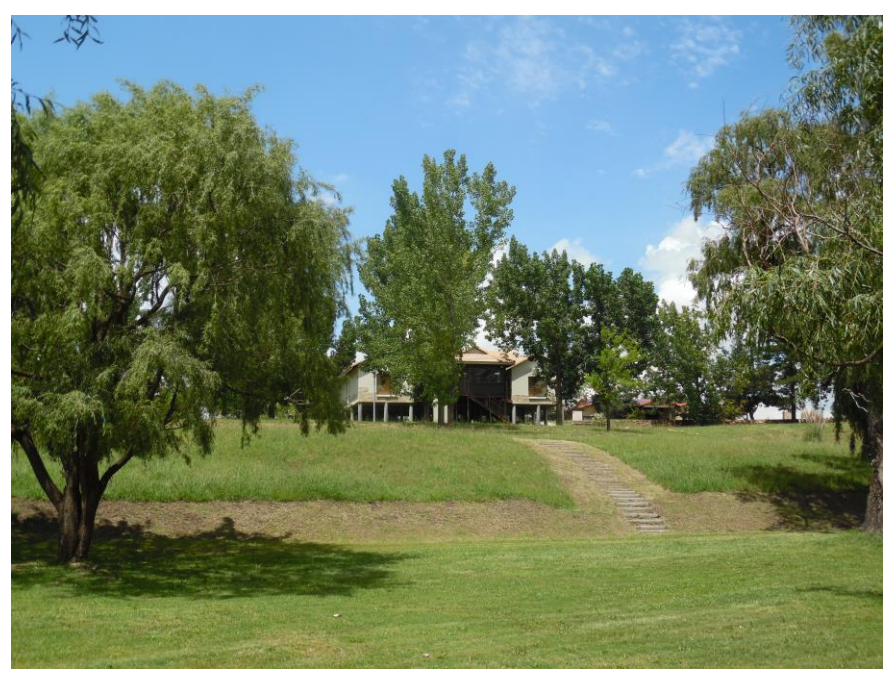
Figure 7: Structure situated in study area