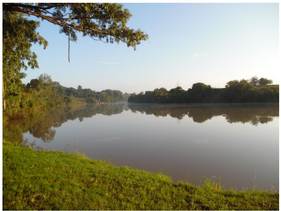
Figure 4: Area near Vaal River