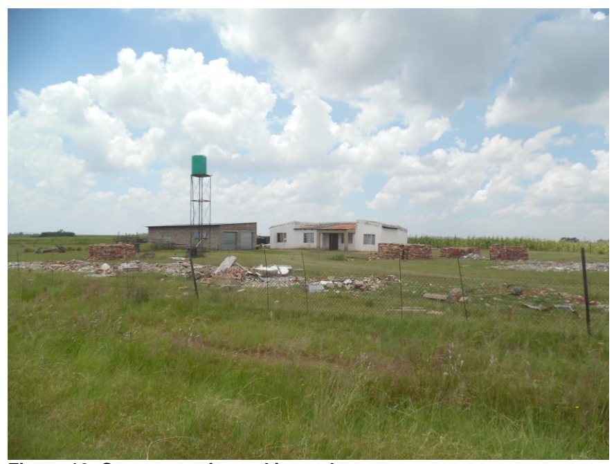
Figure 10: Structures situated in study area