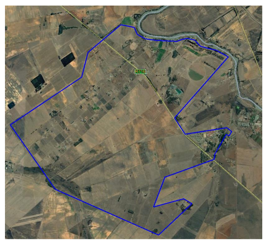
Figure 1: Location map.

The proposed mining right area is set out above in Figure 1. The blue area represents the area to be included into the mining right. The mine planned will be an underground mine.