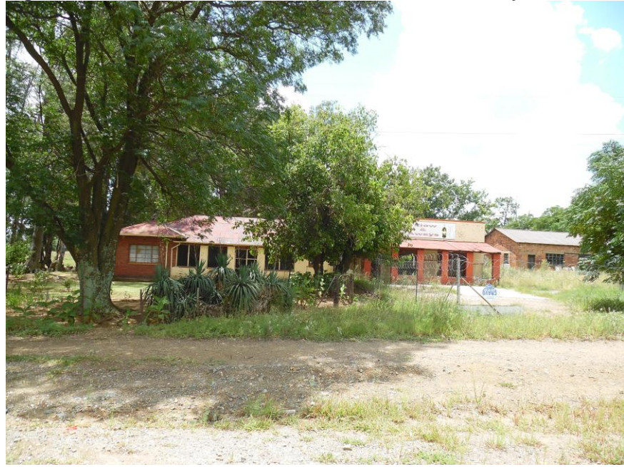
Figure 12: Structures older than 60 years situted in study area