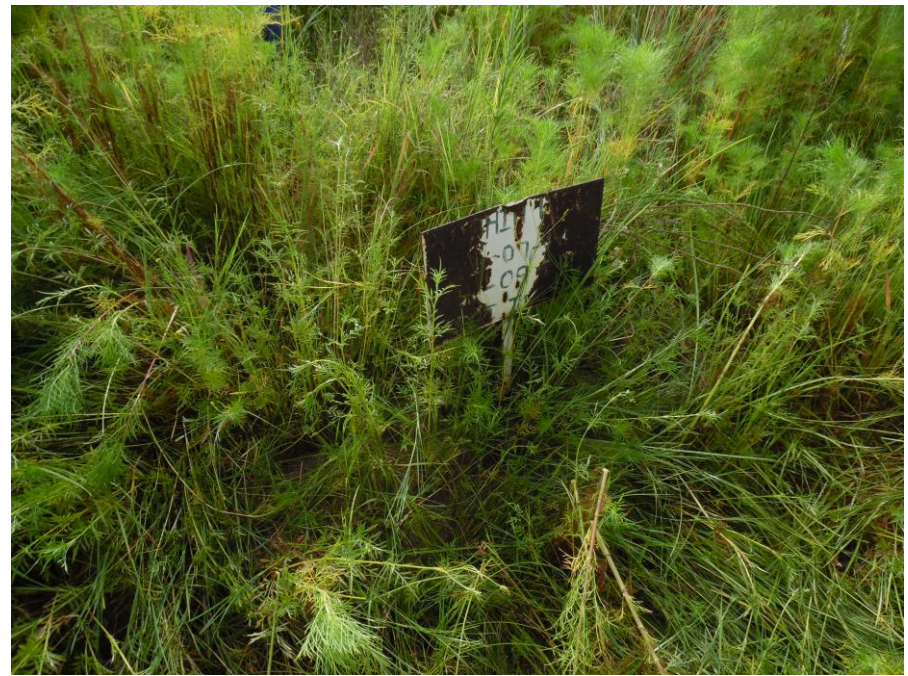
Figure 13: Marked grave