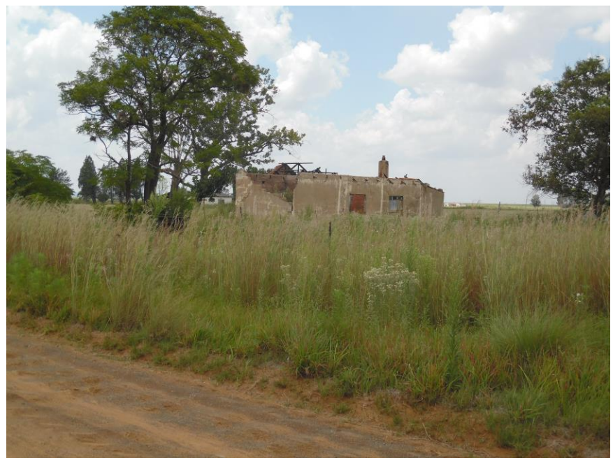
Figure 11: Structure older than 60 years situated in study area