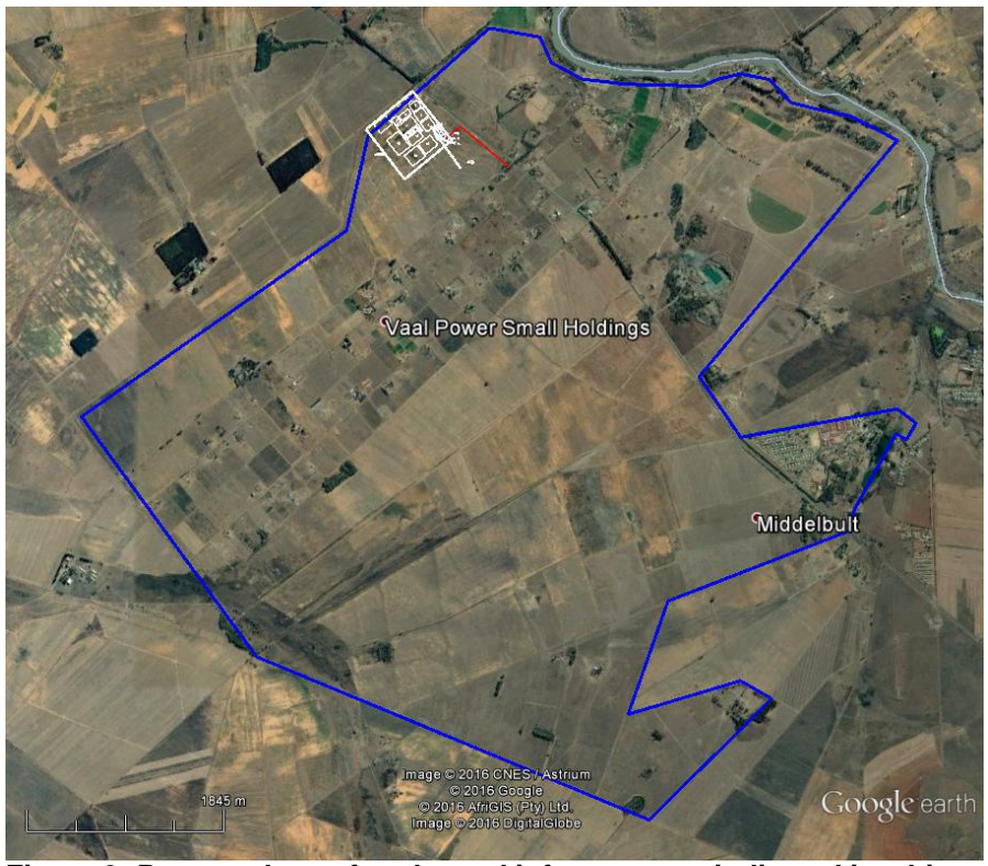
Figure 3: Proposed area for planned infrastructure indicated in white