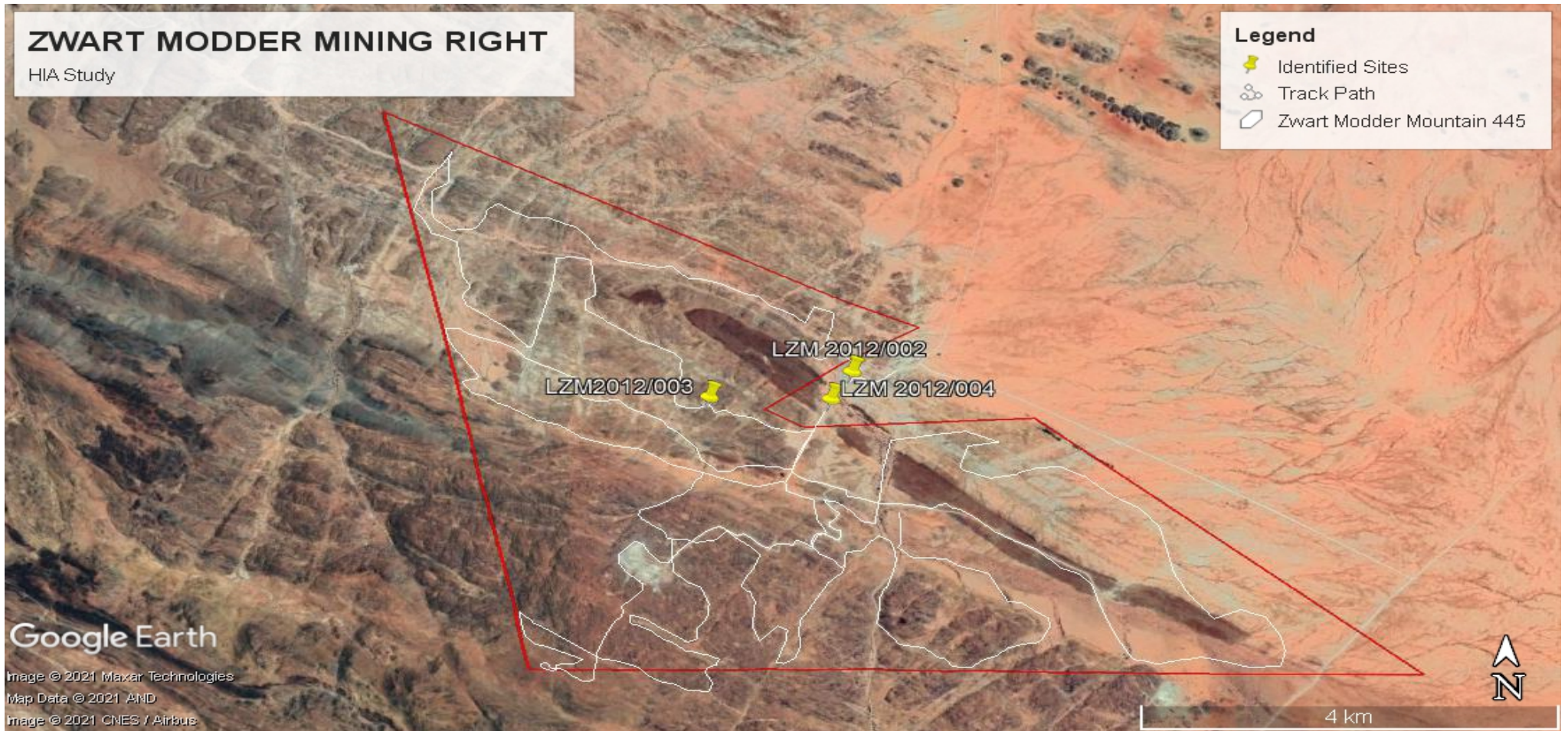
Figure 3: Track logs and Heritage sites identified by the study conducted by Jayson Orton and Lita Webley (2013)