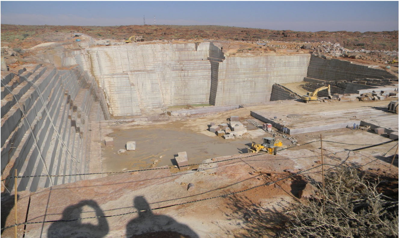
Plate 1: Photo 1: View of existing pit still operational.