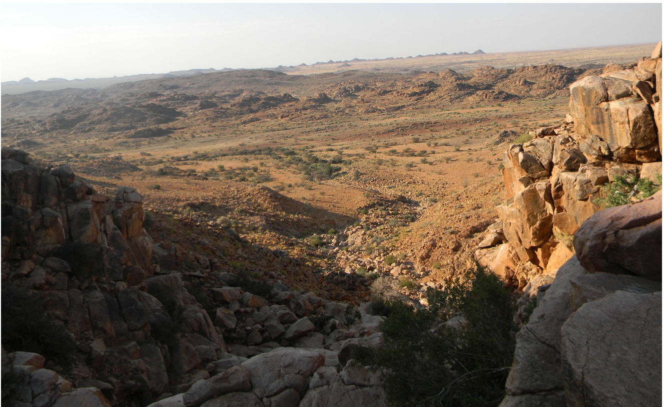
Plate 12: Photo 12: View of mining right site (Photograph © by Author 2021).