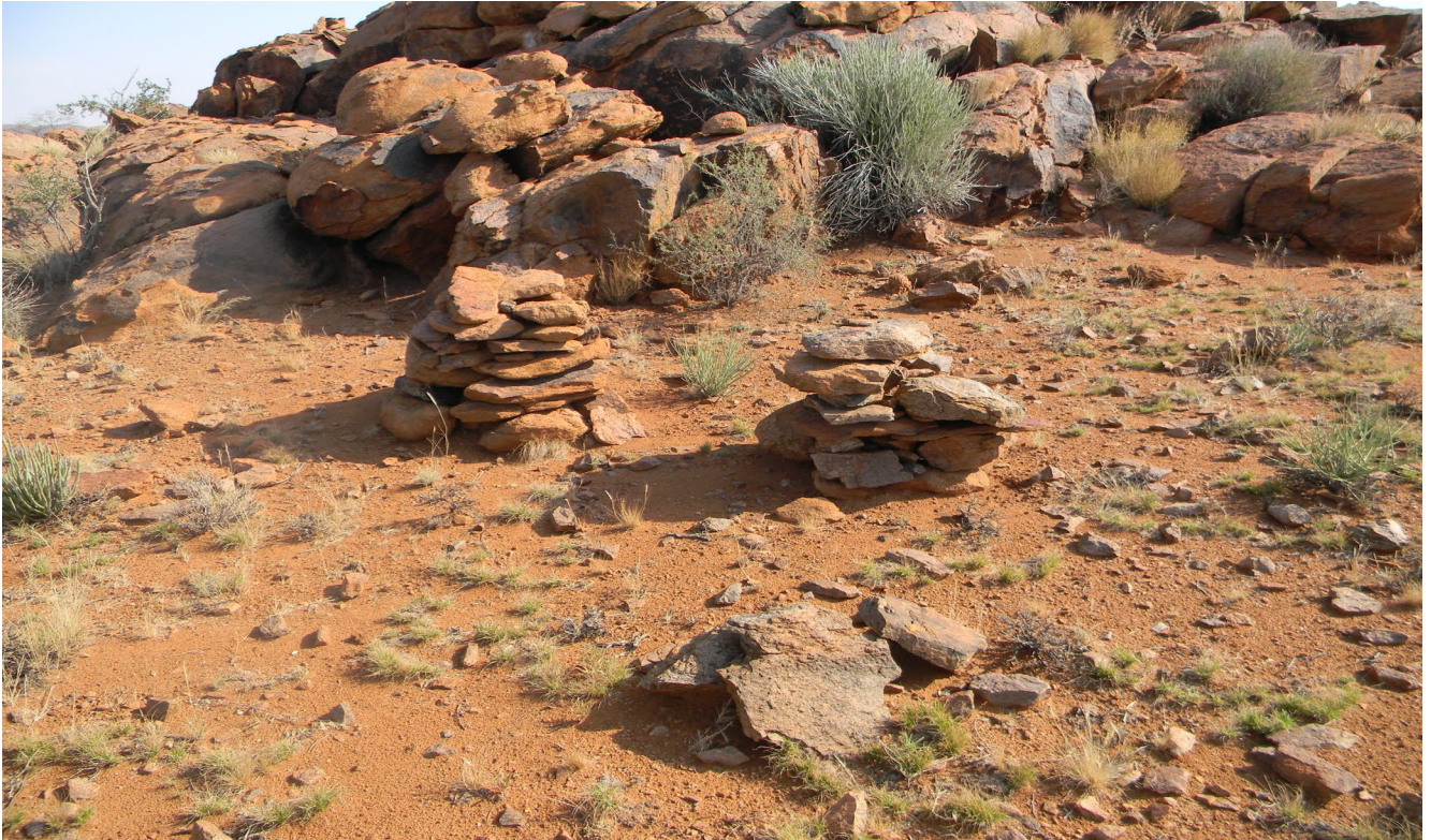
Plate 7: Photo 7: View of stone structure recorded within the Mining Right Site. Note that this could have been a platform for animal traps