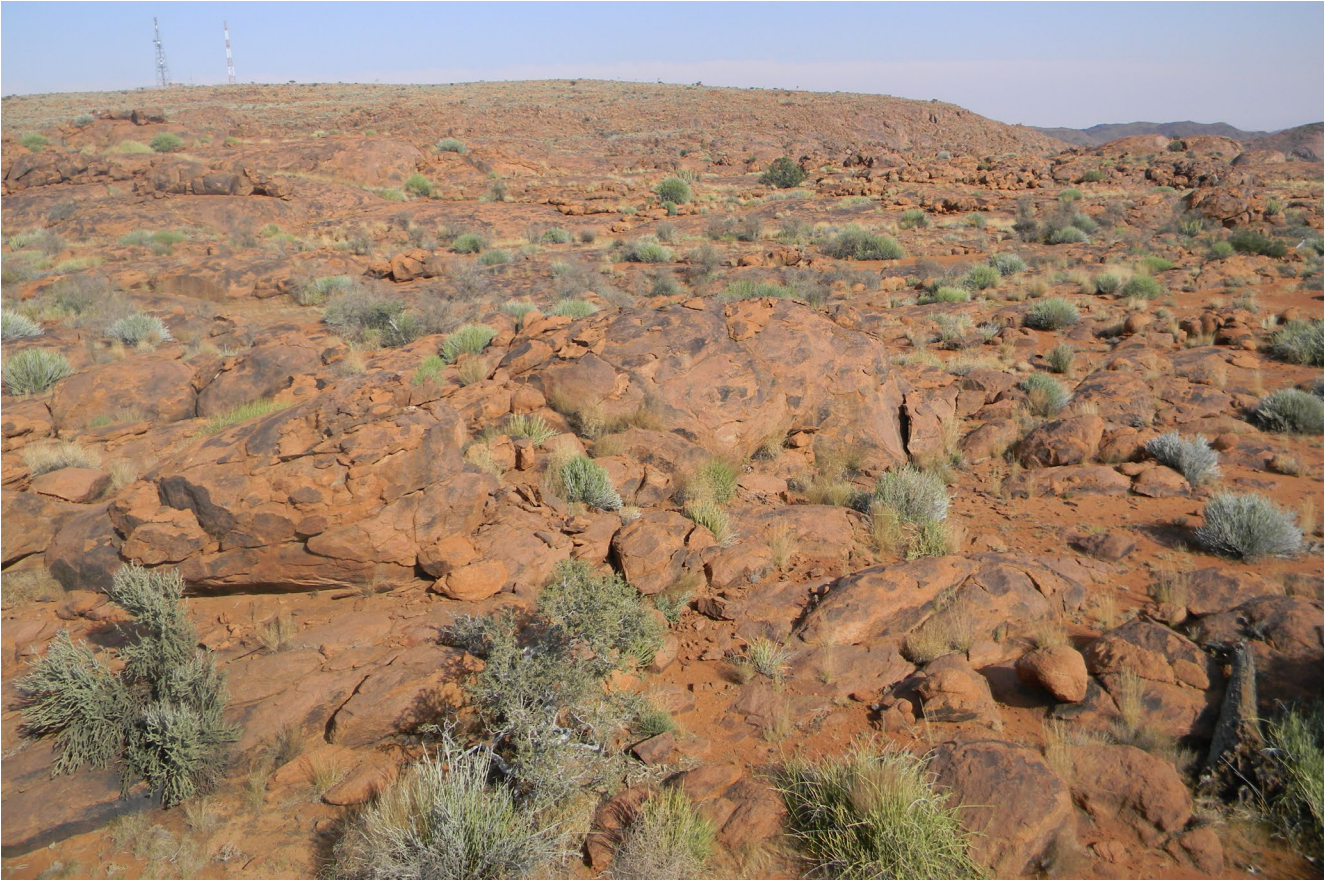
Plate 17: Photo 17: View of proposed prospecting site.