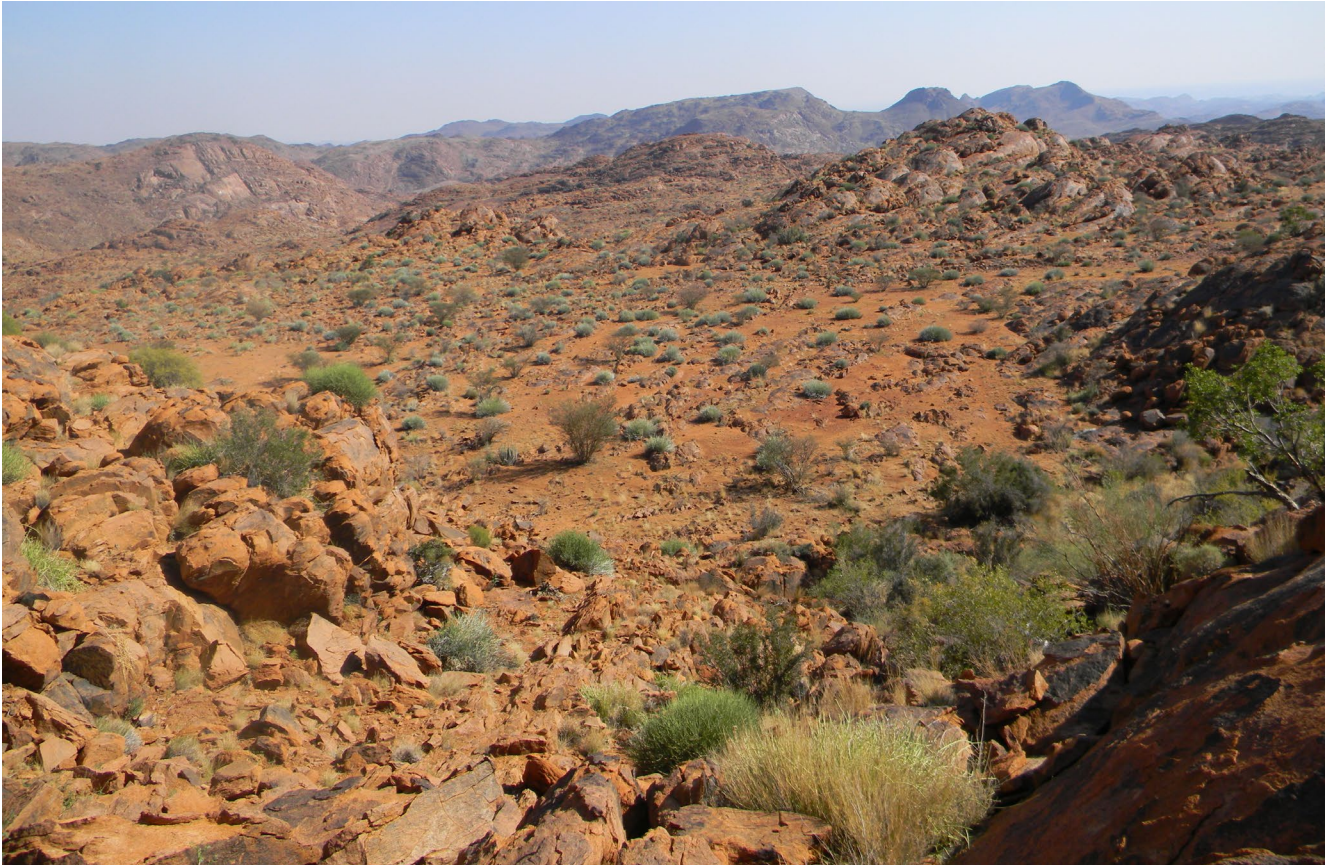
Plate 9: Photo 9: View of mining right site.