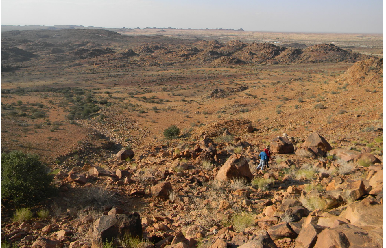
Plate 13: Photo 13: View of Mining Right Application site.