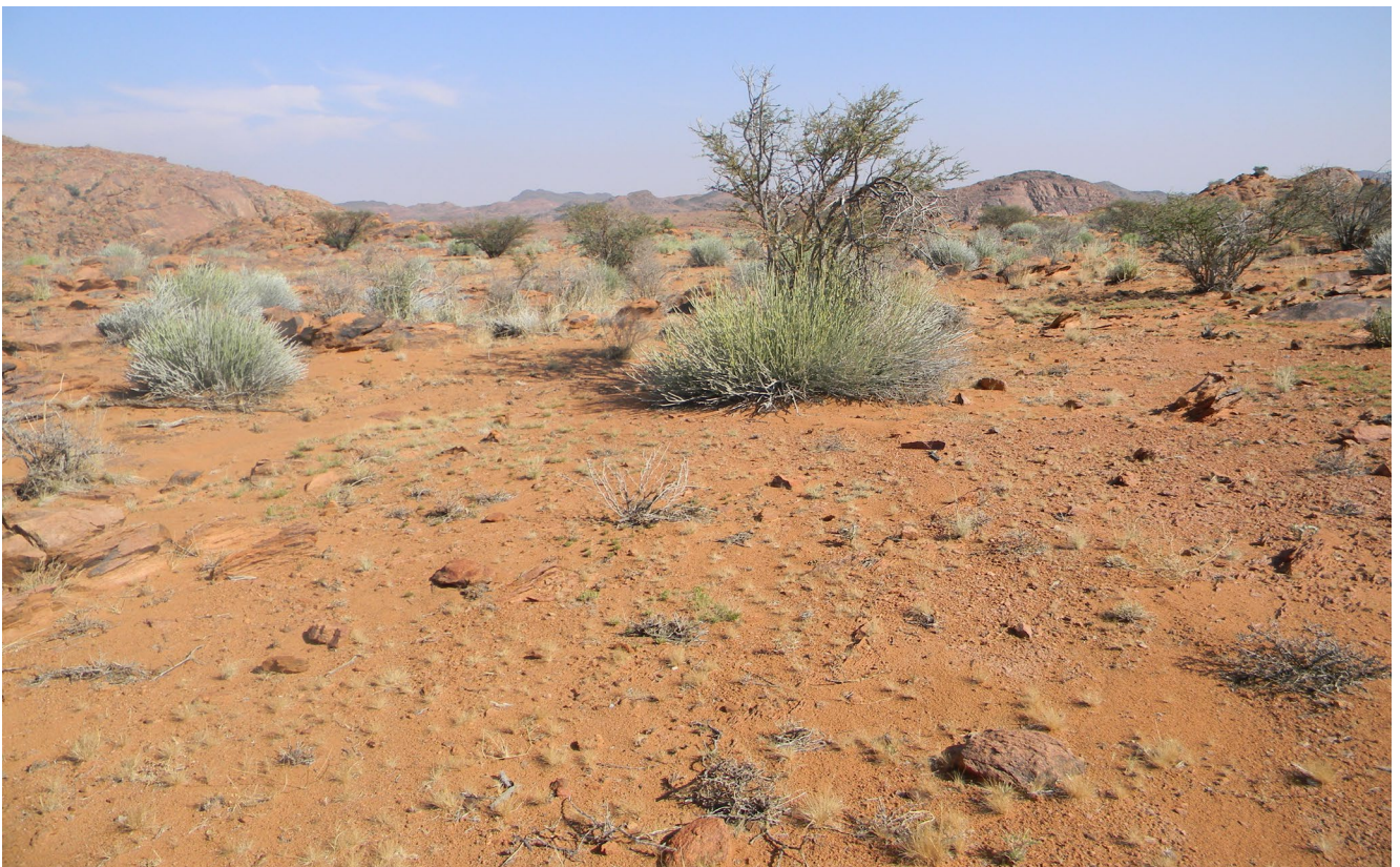
Plate 10: Photo 10: View of proposed mining right area (Photograph © by Author 2021).