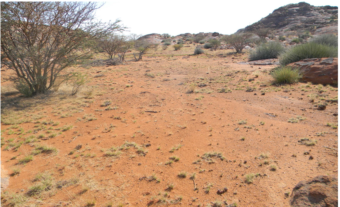
Plate 8: Photo 8: View of proposed mining right site.