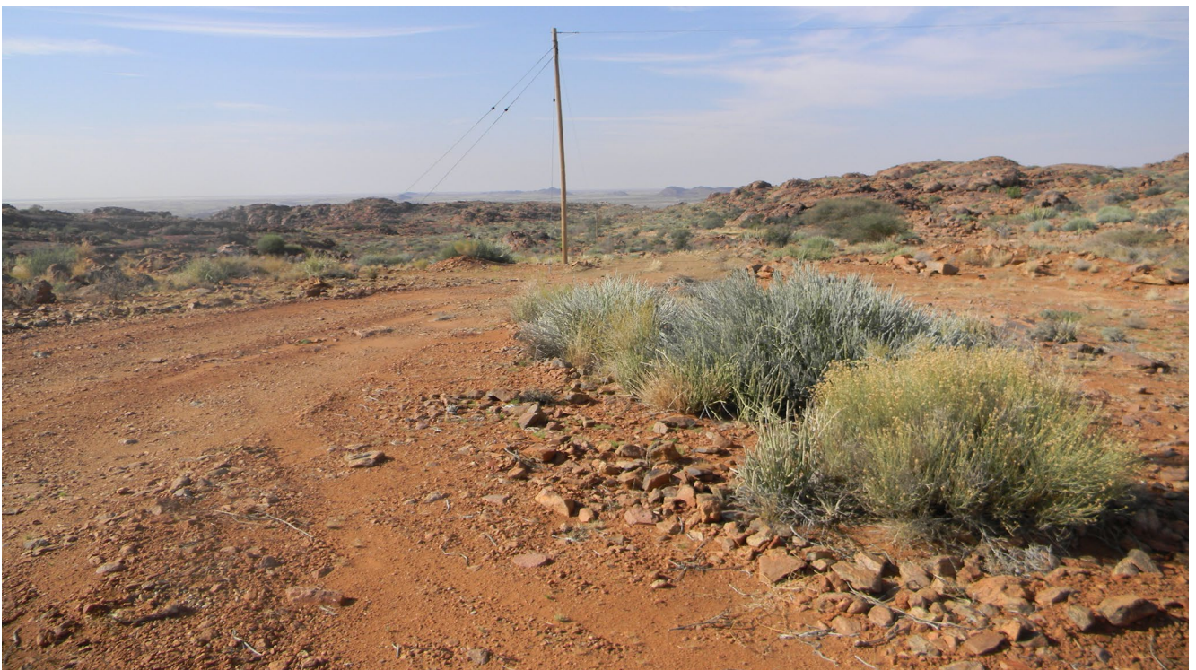
Plate 2: Photo 2: View of access road and powerline within the site.