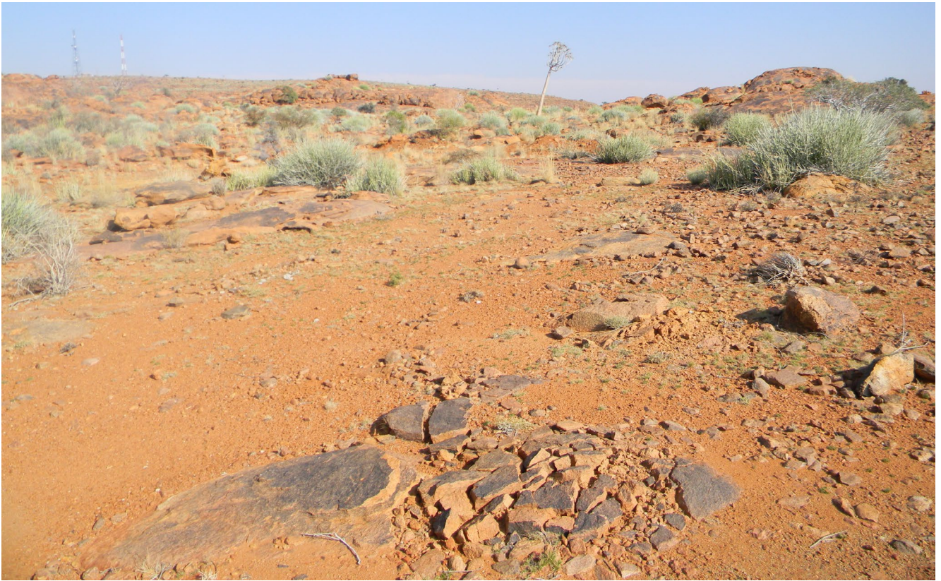
Plate 3: Photo 3: View of Mining Right site.