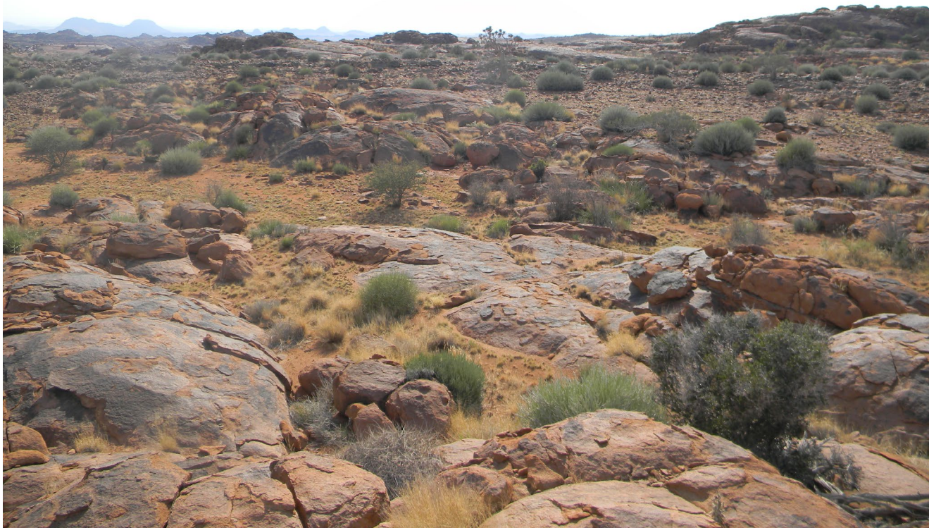
Plate 5: Photo 5: View of Mining Right Application site