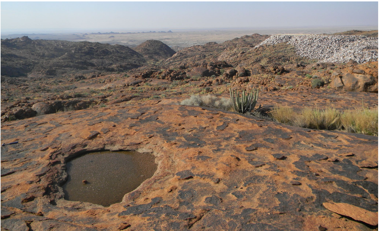
Plate 14: Photo 14: View of a pool that accumulates water after rain or frost.