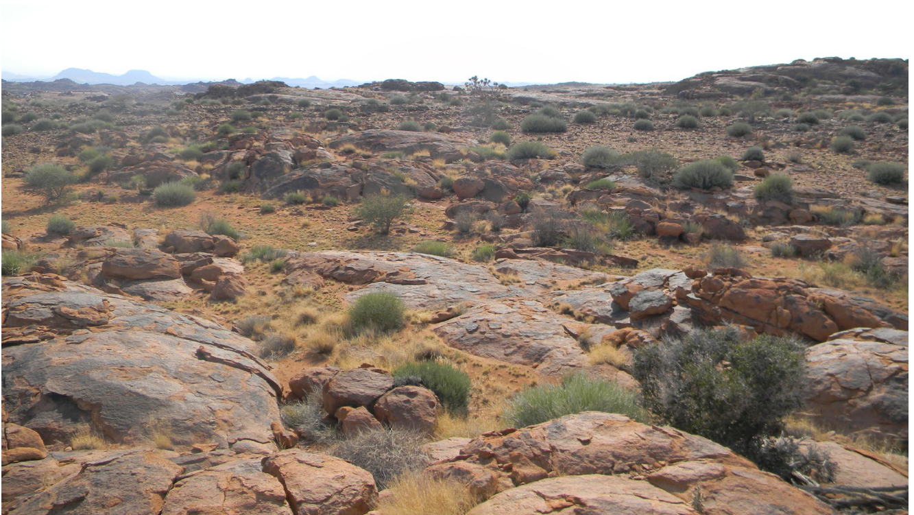
Plate 16: Photo 16: View of mining right site (Photograph © by Author 2021).