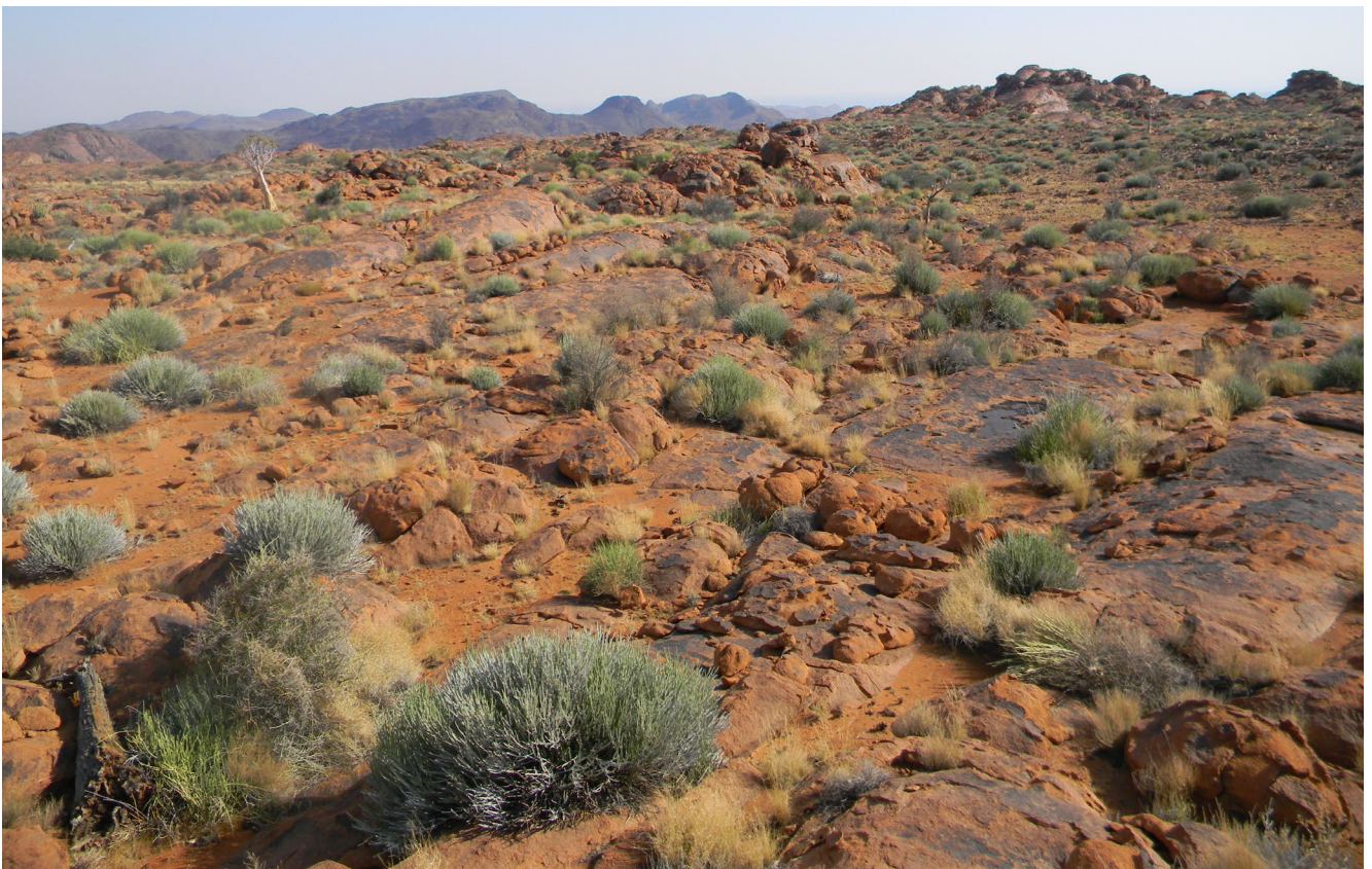
Plate 4: Photo 4: View of the proposed mining Right site.