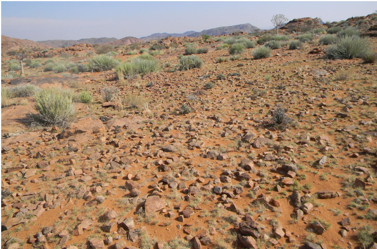
Plate 6: Photo 6: View of Mining Right Site (Photograph © by Author 2021).