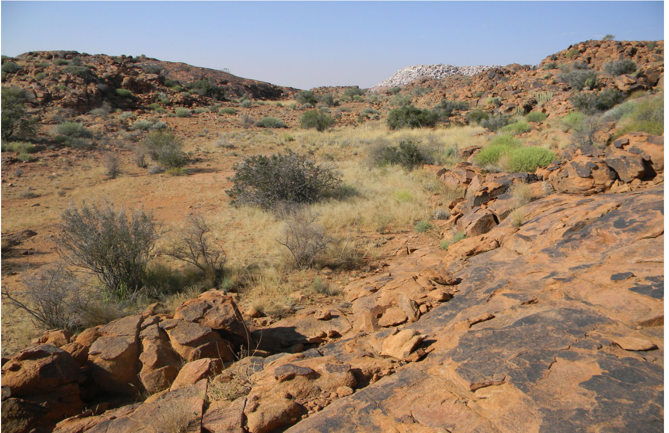
Plate 11: Photo 11: View of mining right site (Photograph © by Author 2021).