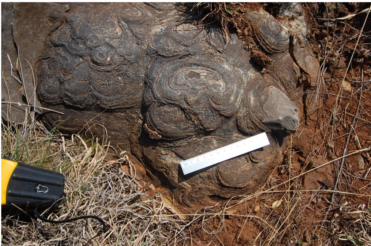
Figure 5: Stromatolites as seen from the surface.