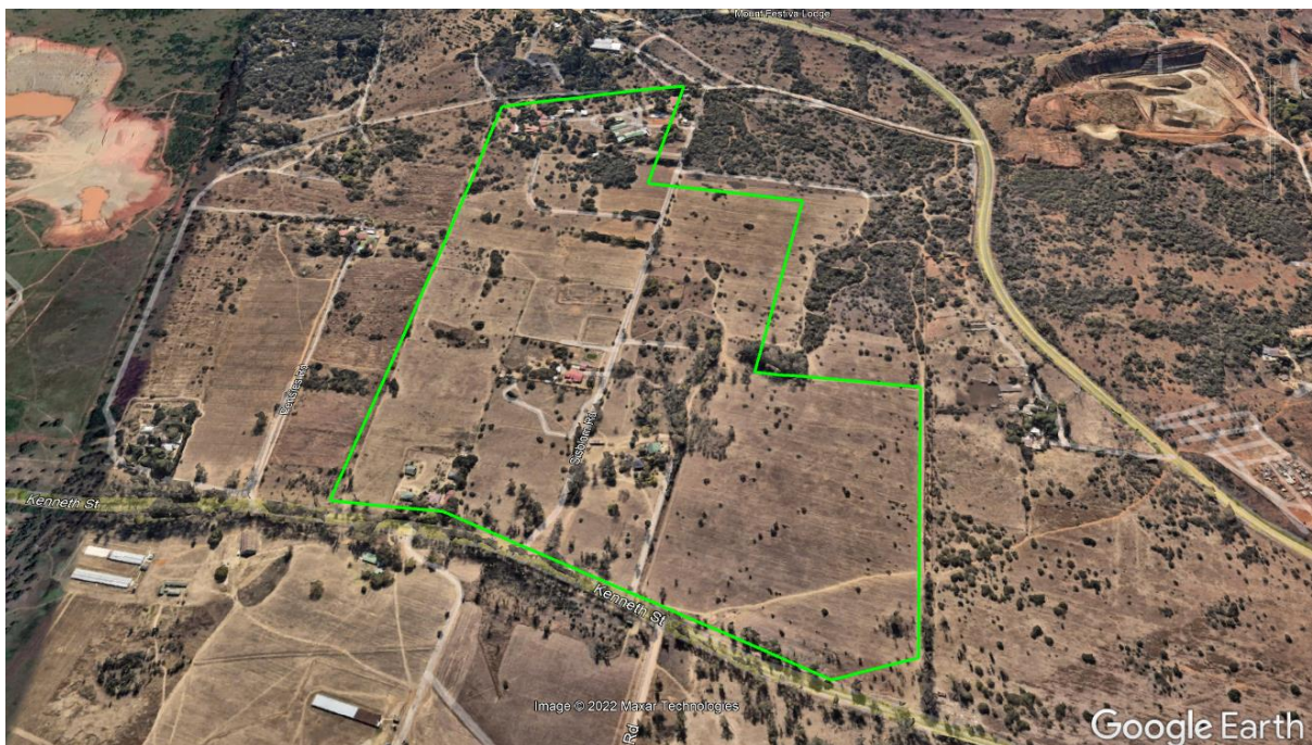
Figure 1: Google Earth map of the Farm Boekenhoutkloof 315 JR with the area for prospecting shown within the red outline. Map supplied by ENVASS.