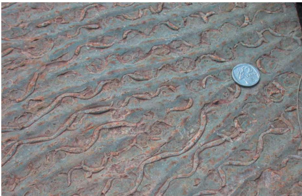
Figure 6: Vermiform trace fossil Manchuriophycus from a bedding plane in the Magaliesberg Formation east of Pretoria. Figure taken from Bosch and Eriksson (2017; Fig 7).