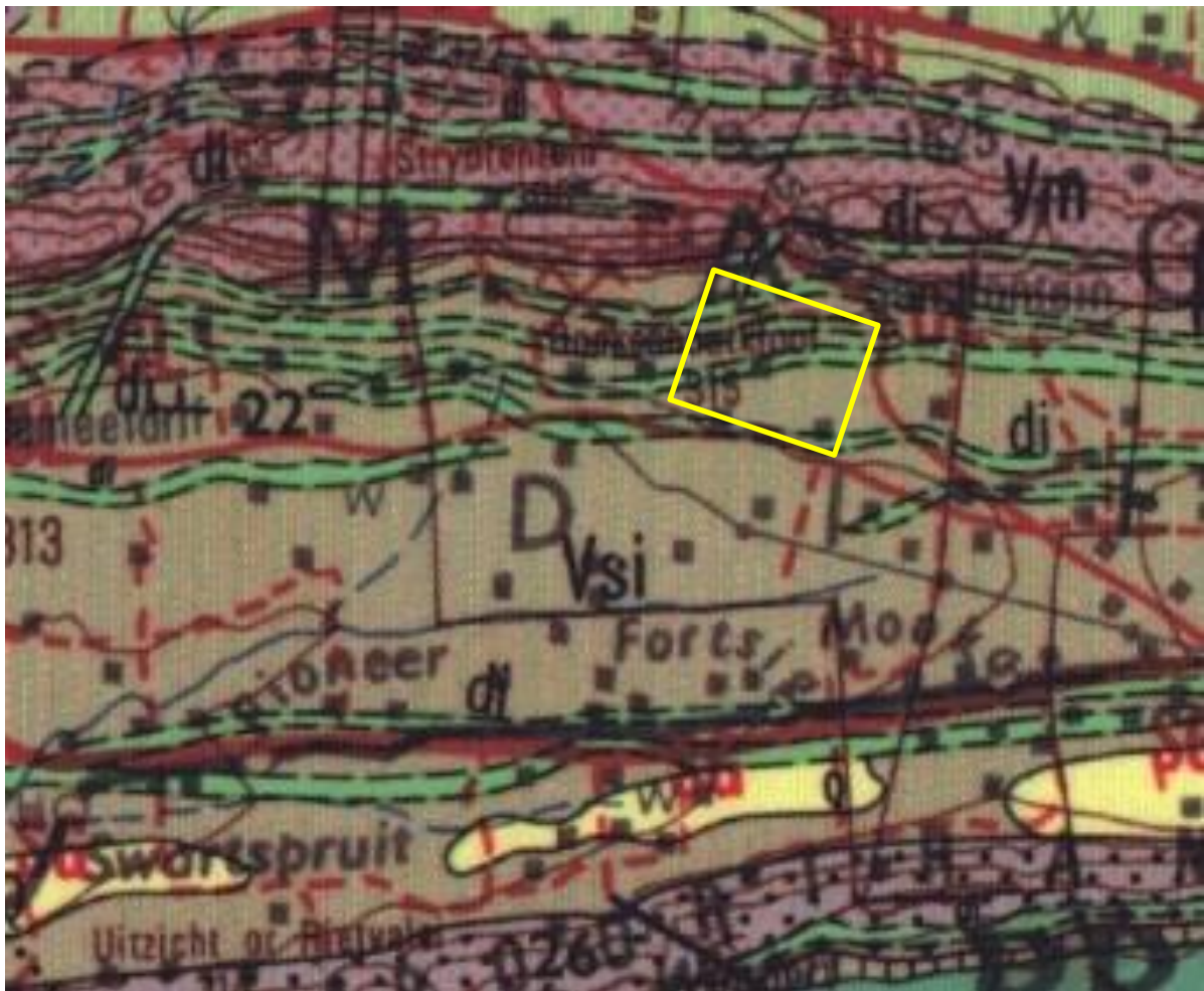
Figure 3: Geological map of the area around Farm Boekenhoutkloof 315 JR with the proposed prospecting rights area shown within the yellow rectangle. Abbreviations are explained in Table 2. Map enlarged from the Geological Survey 1: 250 000 map 2528 Pretoria.

Table 2: Explanation of symbols for the geological map and approximate ages (Eriksson et al., 2006; Johnson et al., 2006; Zeh et al., 2020). SG = Supergroup; Fm = Formation; Ma = million years; grey shading = formations impacted by the project.