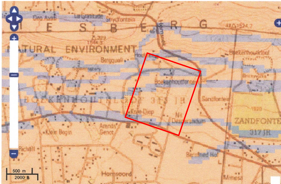
Figure 4: SAHRIS palaeosensitivity map for the site for the proposed Klei Minerale PR area on Boekenhoutkloof shown within the red rectangle. Background colours indicate the following degrees of sensitivity: red = very highly sensitive; orange/yellow = high; green = moderate; blue = low; grey = insignificant/zero.

From the SAHRIS map above the area is indicated as highly sensitive (orange) but this is not supported by the geological records as discussed above. The blue bands correspond to the non-fossiliferous diabase (volcanic intrusions)