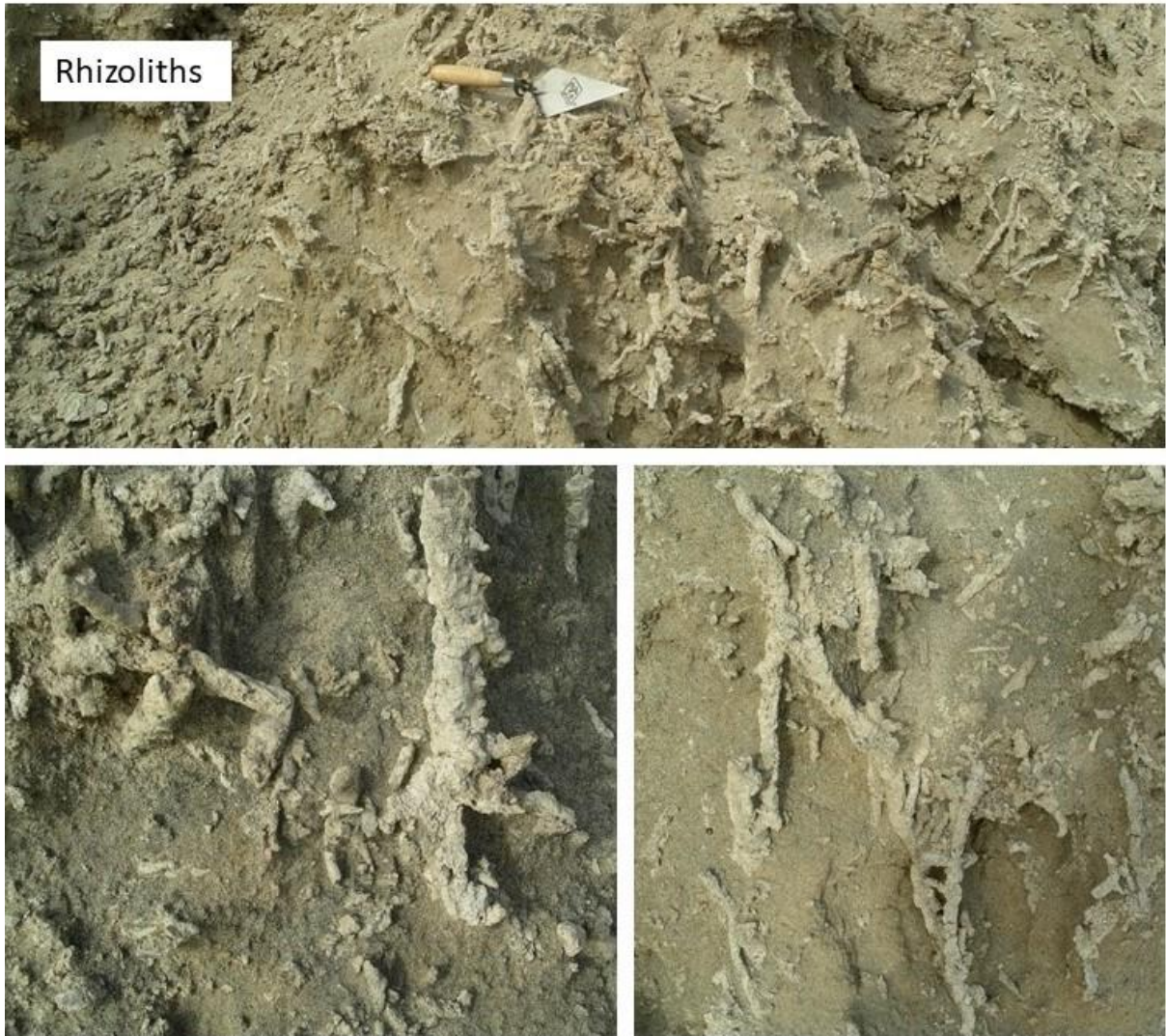
Figure 7: Photographs of various types of rhizoliths in sands and sand dunes from the Kalahari Group.