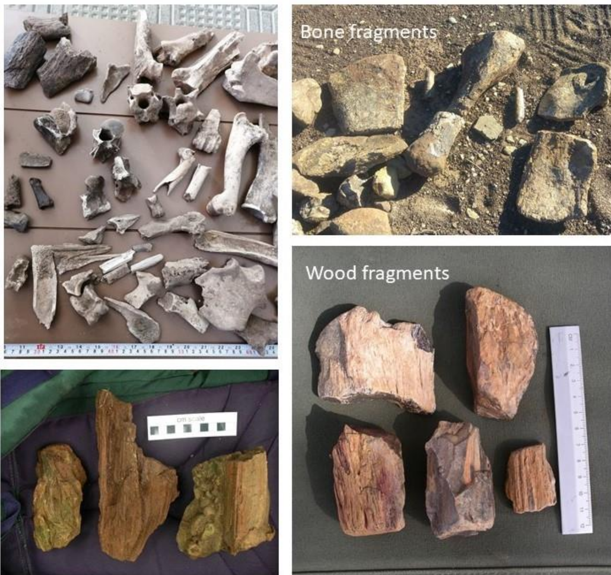
Figure 8: Photographs of fragmented but robust fossils that have been recovered from Quaternary sands.