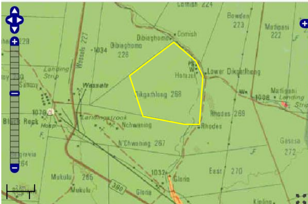
Figure 5: SAHRIS palaeosensitivity map for the site for the Dikgathlong 268 PR area shown within the yellow polygon. Background colours indicate the following degrees of sensitivity: red = very highly sensitive; orange/yellow = high; green = moderate; blue = low; grey = insignificant/zero.