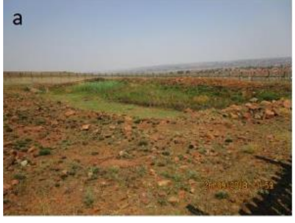
Photo 6: the identified scour pond/retention pond (artificial wetland) found as part of the existing Lenasia HL reservoir infrastructure.