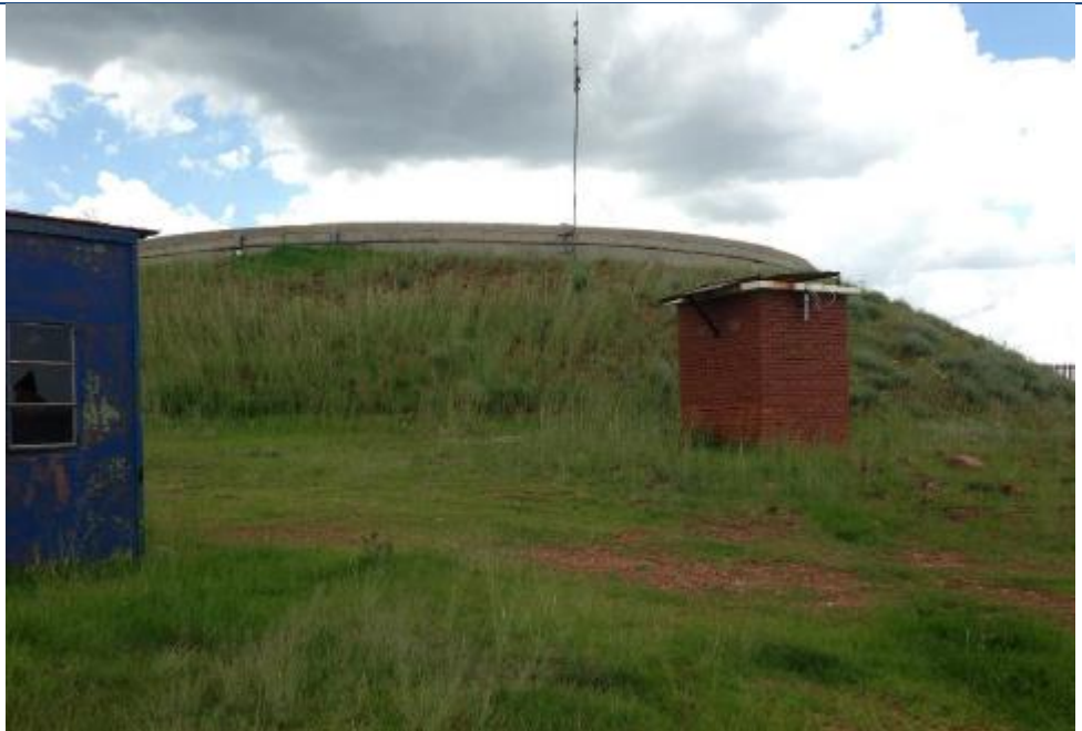
Photo 4: The existing Lenasia HL reservoir adjacent to the proposed new reservoir site.

Photo 3: Prototype view of the reservoir position.