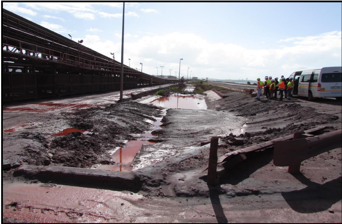
Figure 6: View of the Slurry proposed for upgrade.