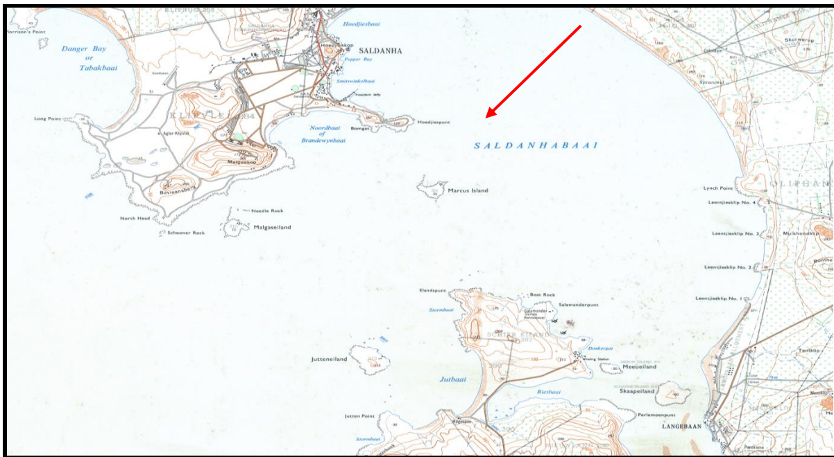
Figure 3: An overview of the historical topographical map of the area of the Port as indicated by the red arrow (Deeds: 3317BB, 1973). Note that the port had not been established during this era.