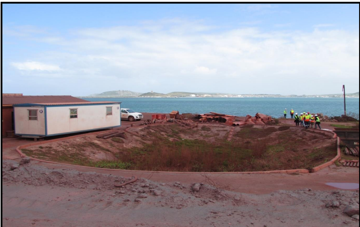
Figure 5: View of another detention pond proposed to be upgraded along the causeway.