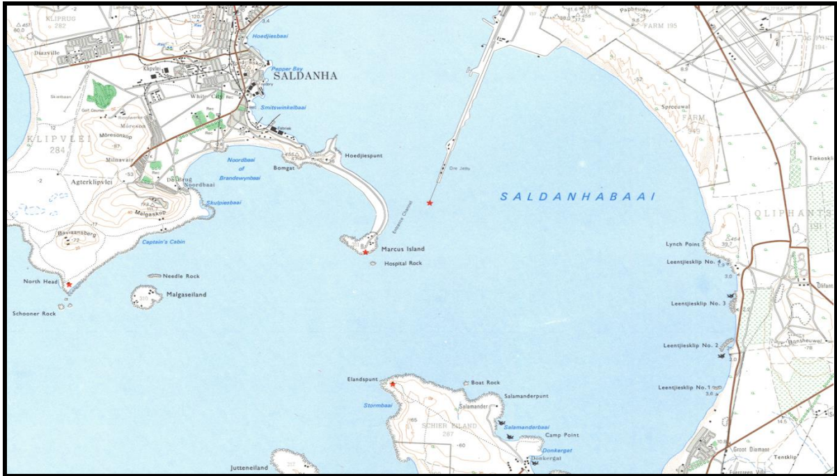
Figure 2: A historical topographical map dating to 1981 indicating the Port at its early stage (Deeds: 3317BC/1981).