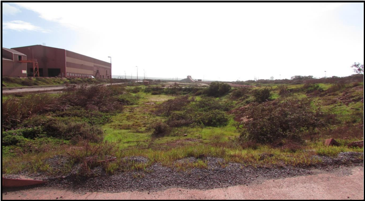
Figure 4: An overview of the retention pond to be upgraded near the tippler area.