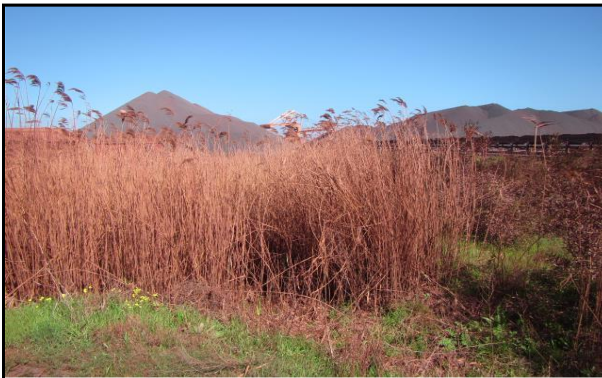
Figure 7: The area proposed for retention pond.