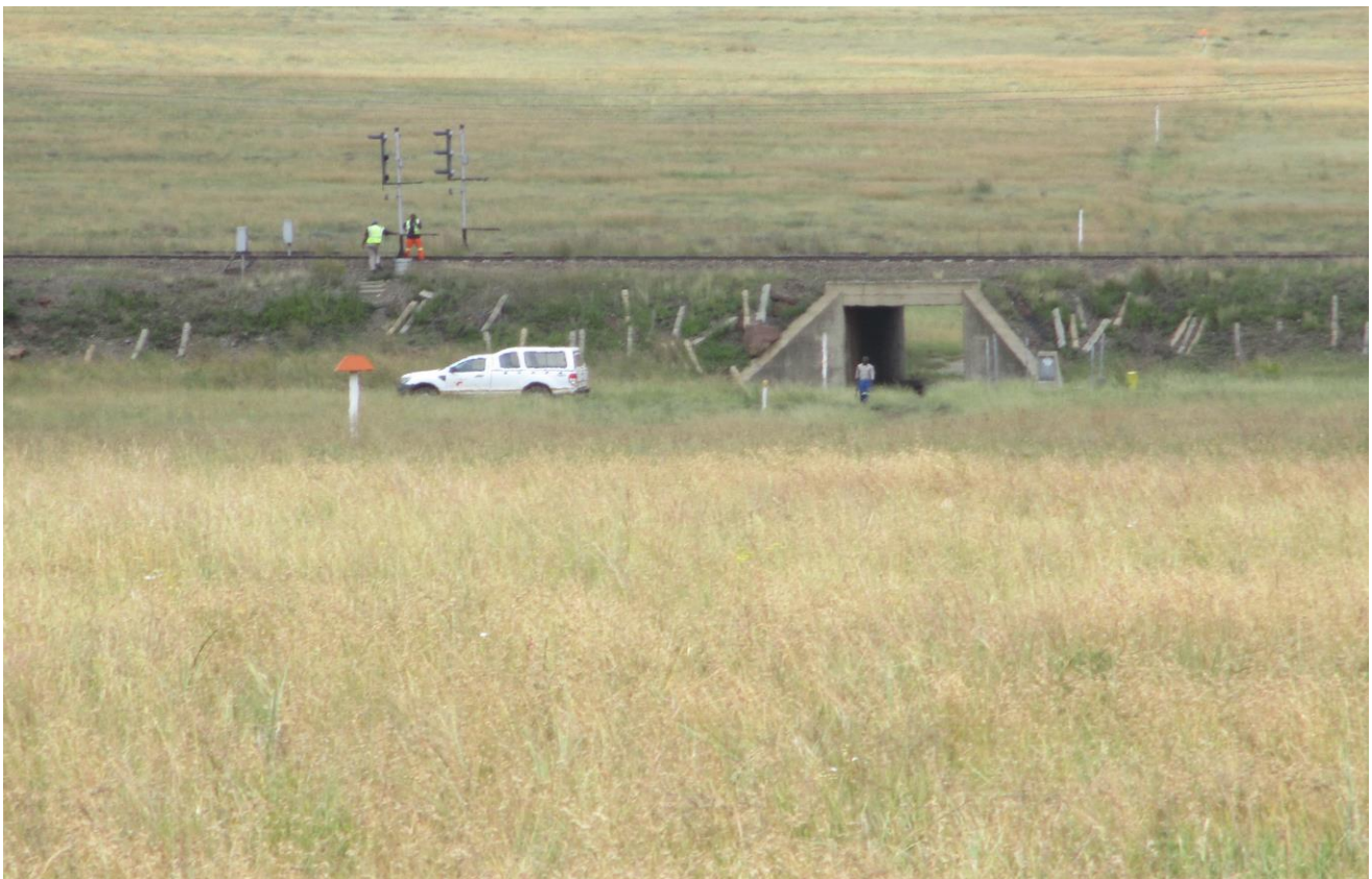
Plate 3: Photo 2 shows an existing railway line traverses through the area (Author 2018).