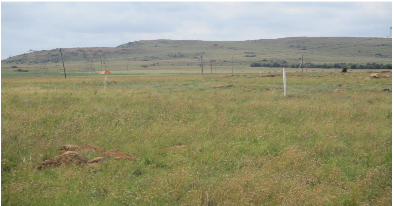
Plate 5: Photos 4 shows concealed site by overgrown vegetation cover with various Eskom powerline and Sasol Gas pipeline traversing the area (Author 2018).