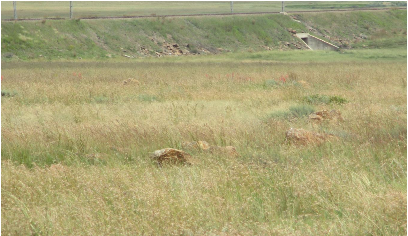
Plate 4: Photo 3 shows the railway line traversing the area (Author 2018).