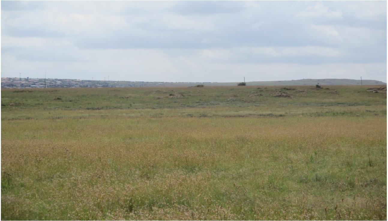
Plate 2: Photo 1 shows the general landscape of the substation site (Author 2018).