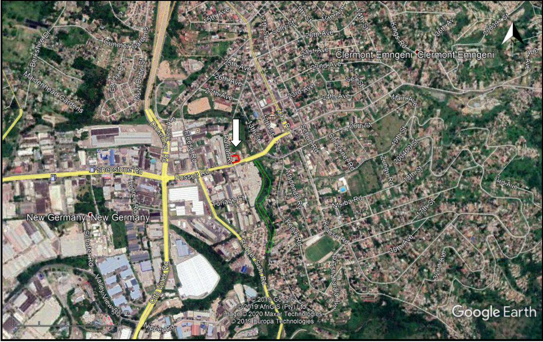
FIG. 1 GENERAL LOCATION OF THE STUDY AREA