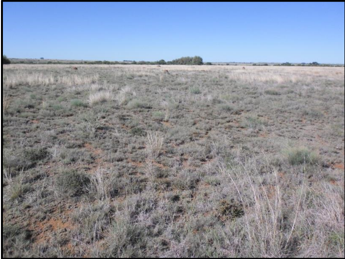
Figure 6. Option 1 viewed from the East.