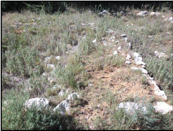
Figure 10: Rectangular foundation at Site 2.