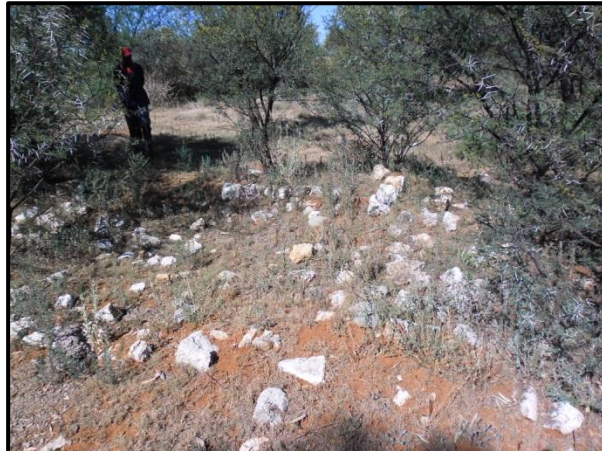
Figure 11: Rectangular foundations at Site 3.

Field Rating (Recommended grading or field significance) of the site: