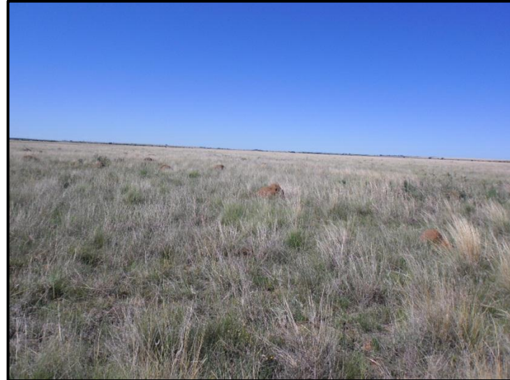
Figure 7. General site conditions in Option 2.