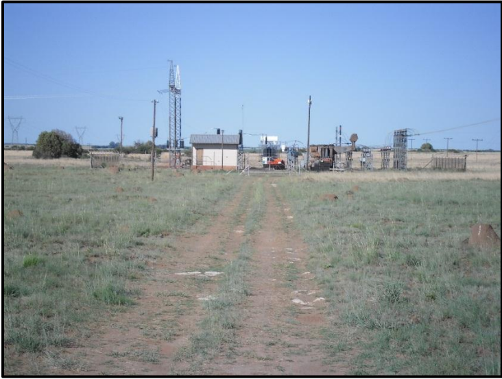
Figure 4. Western view of the Hertzogville substation that the photovoltaic plant will feed into