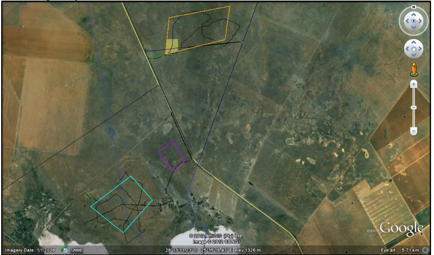
Figure 2: Google Image showing the two alternatives in (yellow and light blue) and track log of the areas that were covered during the survey.