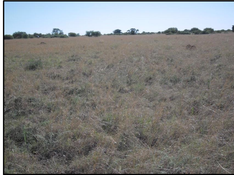
Figure 5. General Site conditions in option 1, viewed from the South.