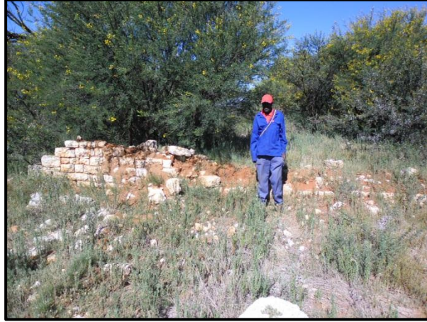
Figure 9: Eastern view of ruin at Site 2.