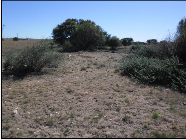
Figure 8: Western view of Site 1.