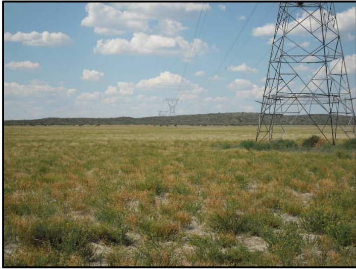
Figure 3. Study area viewed from the south with the power line that photovoltaic plant will feed into