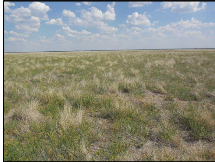
Figure 4. General Site conditions of Option 1, viewed from the West.