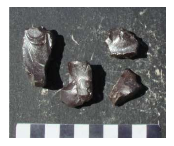
Flaked stone in the vicinity of 30.37771° S 19.58042° E

Findings during the walk-through along the proposed 132kV Khobab-Helios power line options and in adjacent areas were consistent with the observations made by van Schalkwyk (2011) and van der Walt (2012): there is a decided paucity of surface traces of Stone Age material. As noted above, this is in striking contrast to earlier observations made on the dunes around the fringes of Klawervlei and Waterkuil some 70 km north east of the Sous area.