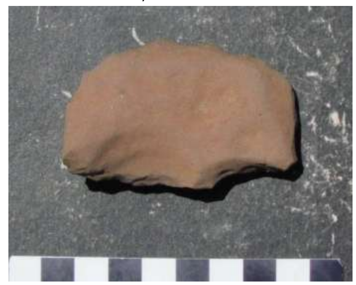
cf. Oakhurst scraper at 30.39238° S 19.57622° E

No 'sites' as such were found. A small number of isolated artefacts were noted (e.g. a single hornfels cf. Oakhurst scraper at 30.39238° S 19.57622° E). In a few places isolated pieces of ostrich eggshell were found (30.39481° S 19.57228° E; 30.39390° S 19.57158° E). The evidence of significant sheet erosion and displacement of uprooted plants consequent on heavy thunder storms in the previous week moreover served to suggest that any surface archaeological traces would tend to be in somewhat secondary context.