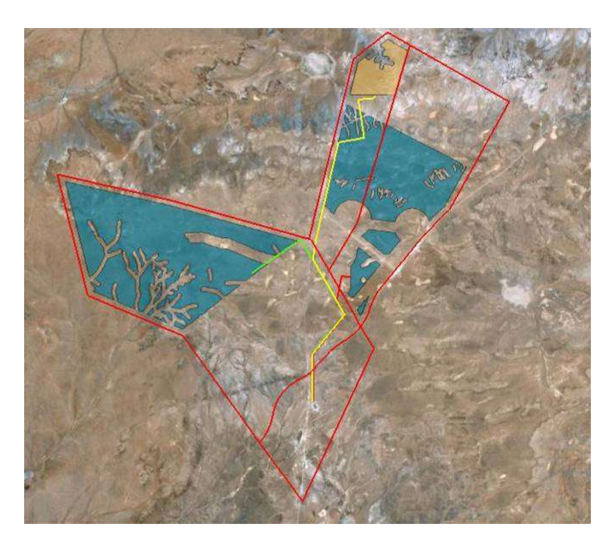
Google Earth image showing the power line options relative to solar energy development footprints.