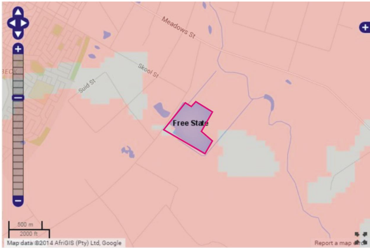
Figure 3. The site is located within an area considered to be of low palaeontological sensitivity (blue area, SAHRIS 2014).