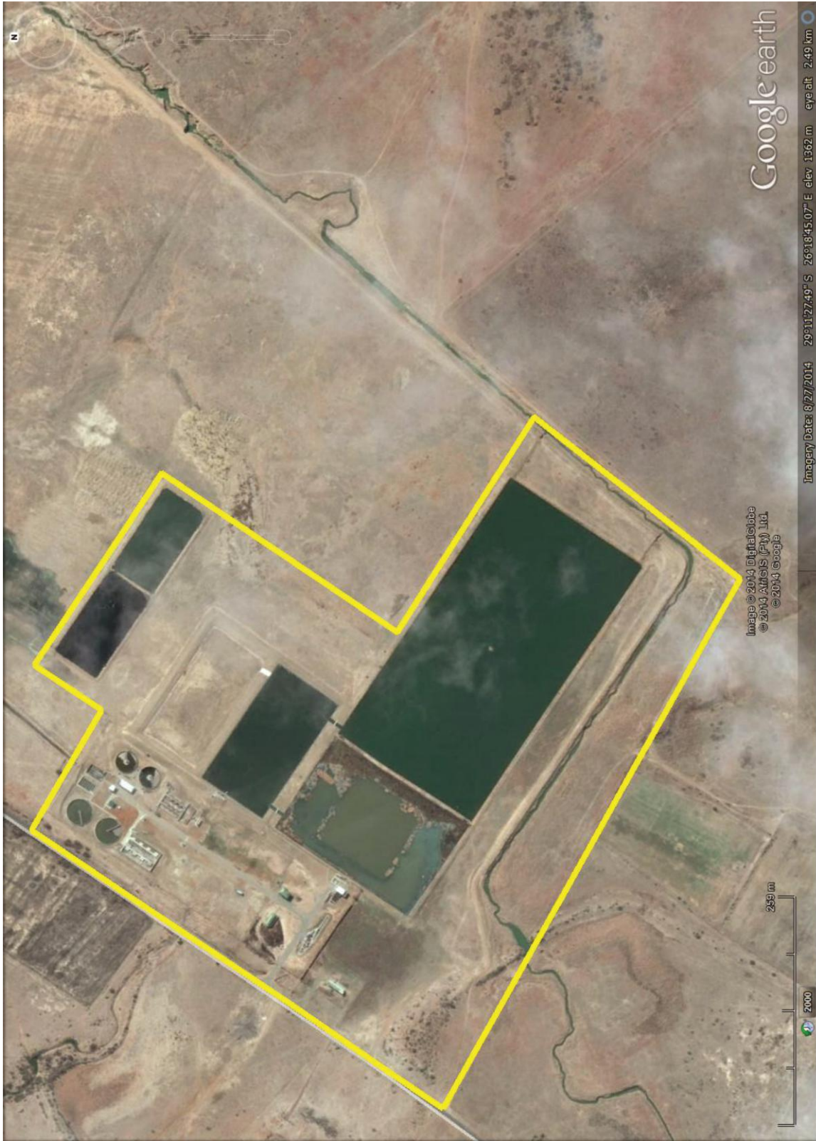
Figure 2. Aerial view of the site.