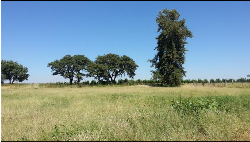
Figure 3-3: General surroundings along the proposed power line alignment.