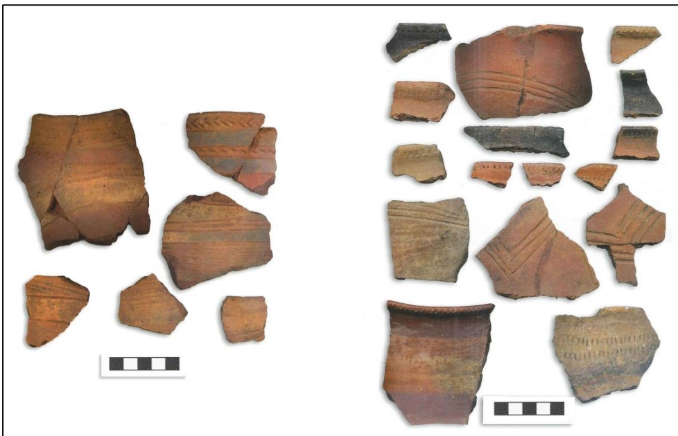
Figure 4-2: Ceramic decoration motives typical of 17 th century Madikwe (left) and later Buispoort (right) facies (After Huffman 2007).