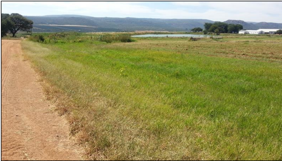
Figure 3-1: View of the northern periphery of the study area, looking east towards the Olifants River.

The vegetation in the Groblersdal surroundings is mostly comprised out of bushveld thicket and mixed grasslands. However, vegetation within the project area has been largely altered where crops have been cultivated. As such, the study area was not densely overgrown by surface vegetation and the visibility at the time of the AIA site inspection (March 2015) was high (see Figures 3-1 to 3-6). In single cases during the survey sub-surface inspection was possible. Where applied, this revealed no archaeological deposits.