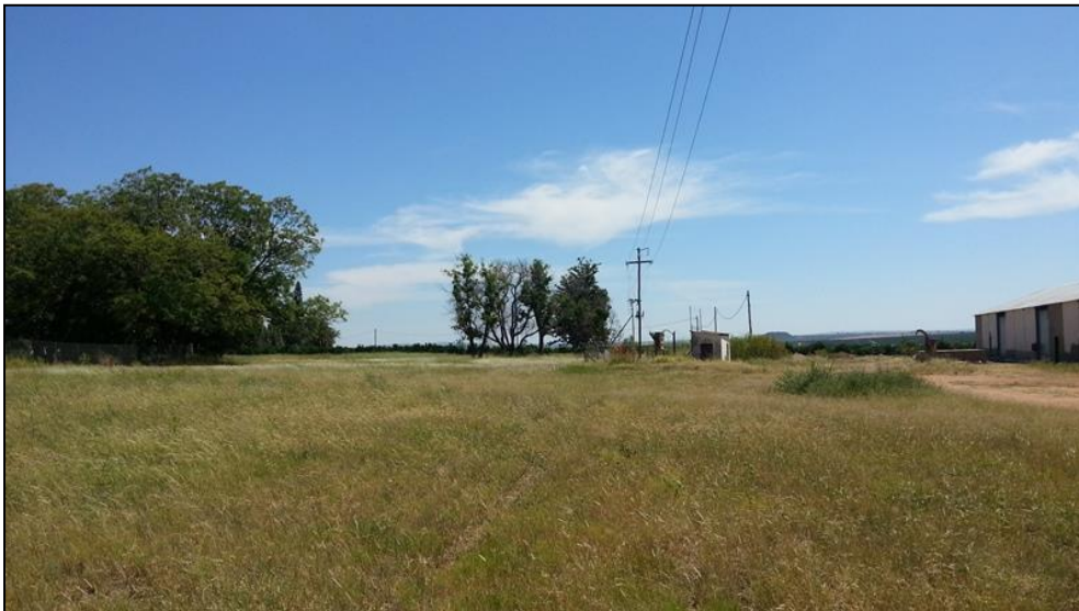
Figure 3-4: View of the existing Eskom power line and substation, proposed to link to the solar farm.