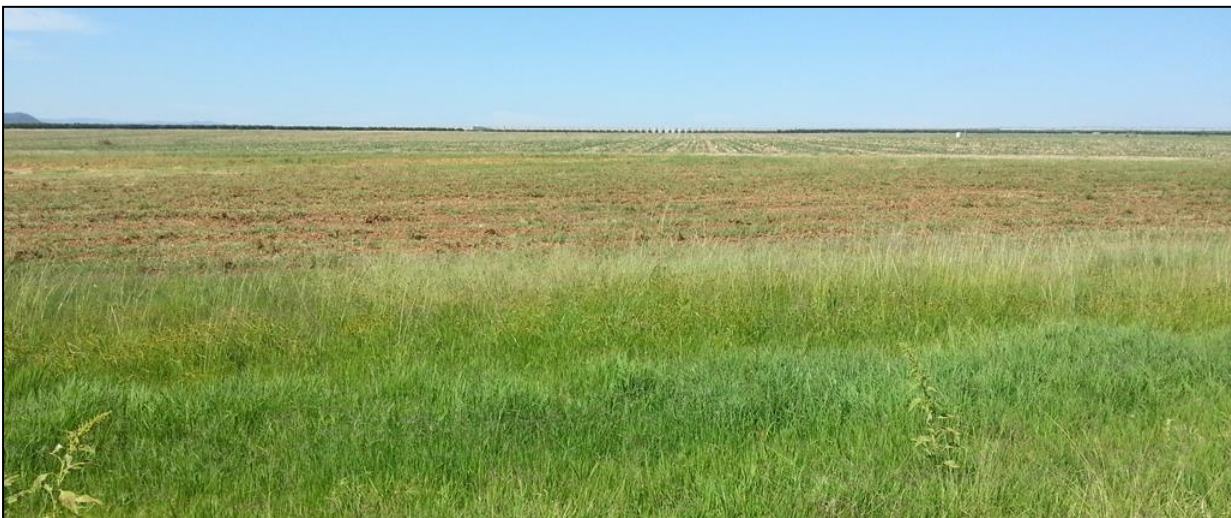
Figure 2-1: Panorama view of the project area at the time of the field survey (March 2015).

The site for the proposed 3.5 Megawatt PV Solar Power Plant occurs on agricultural land and the area has been largely disturbed and altered. The site is bordered to the north by a dirt roads and an artificial storm water canal forms the eastern periphery of the site. A large man-made dam occurs east of the project area. The proposed power line routes across agricultural land and open, disturbed areas towards the existing Eskom line and substation east of the proposed solar farm.