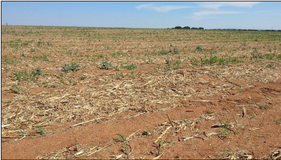
Figure 3-6: View of crop fields and surface disturbance in the solar farm footprint area.