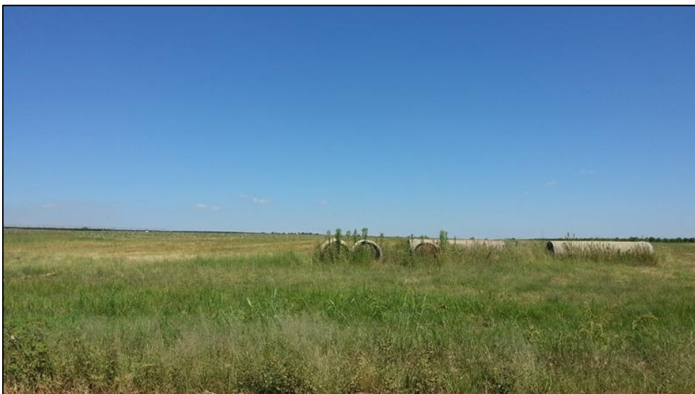
Figure 3-5: View of the project area from the east, looking west.