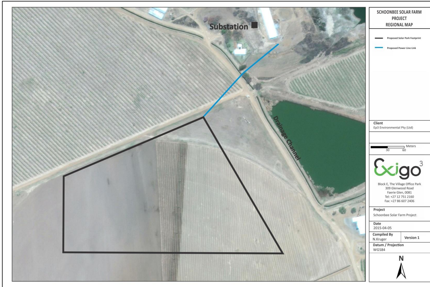
Figure 2-3: Aerial representation of the regional setting for the Schoonbee Solar Farm Project area. Note the location of the proposed solar farm footprint within existing crop fields.