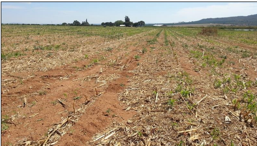
Figure 3-2: View of crop fields in the solar farm footprint area.