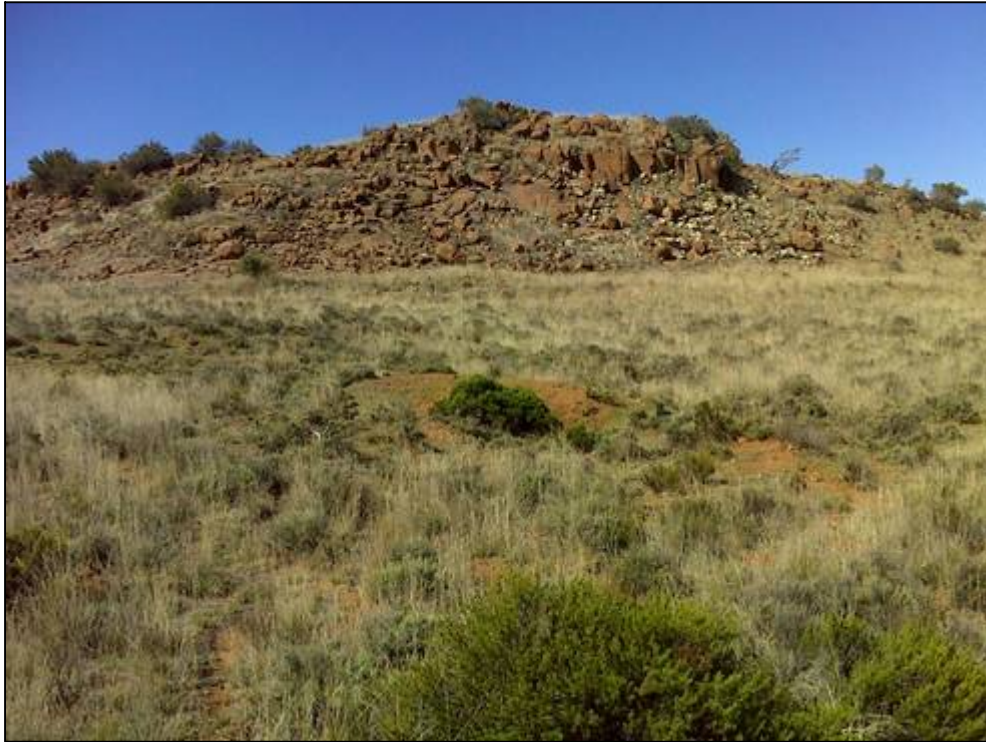
Figure 6. A section of the rocky outcrop situated north of the proposed area for development.

Surface scatters of Middle Stone Age stone artefacts occurred within the immediate and surrounding area as well as the access road for the proposed development with denser occurrences nearer to the rocky outcrop and the adjacent farm road (Figures 7-9). The stone artefacts were all manufactured on a fine-grained black (hornfels or lydianite) raw material and all similarly heavily weathered and patinated. The stone artefacts comprised mostly of varying small and large flakes and miscellaneous retouched pieces. Several of the flakes showed evidence of secondary retouch and some showed evidence of edge-damage that may indicate utilisation. Some prepared core or faceted platform flakes were also identified within the proposed area. Several stone artefacts also showed fresh flaking that may have been caused recently by trampling by domestic stock and/or human and farming activity.