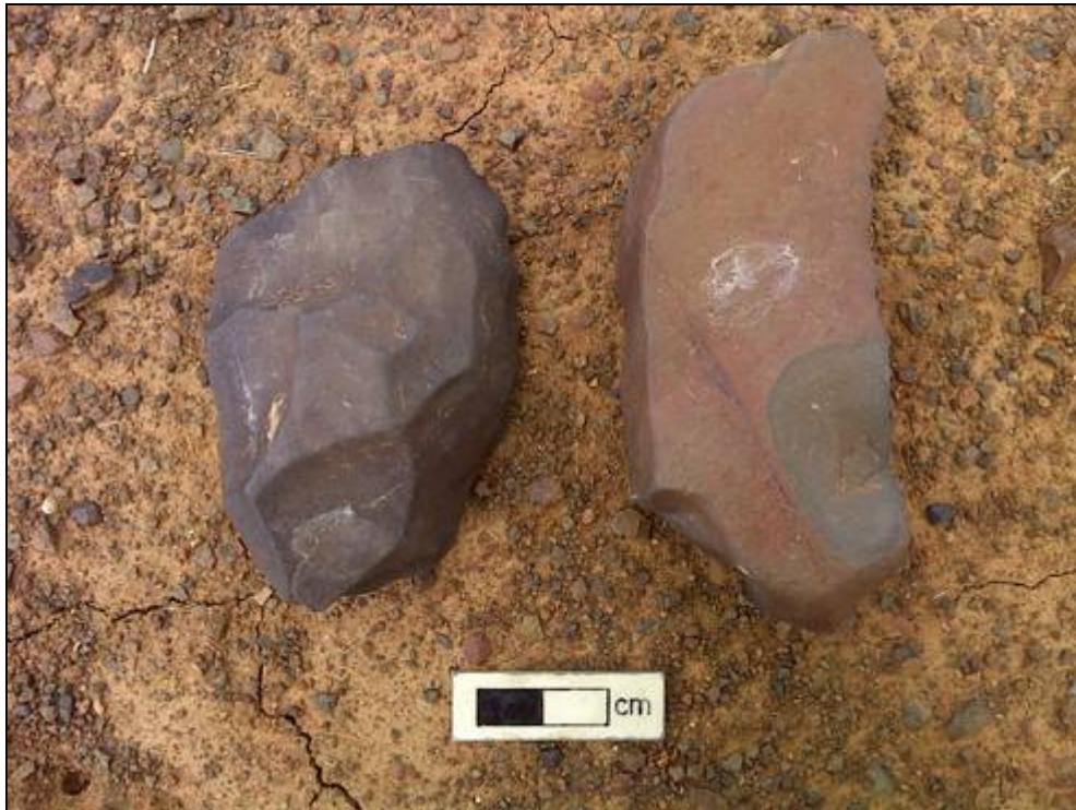
Figure 8. Examples of the stone artefacts identified within the proposed area for development.