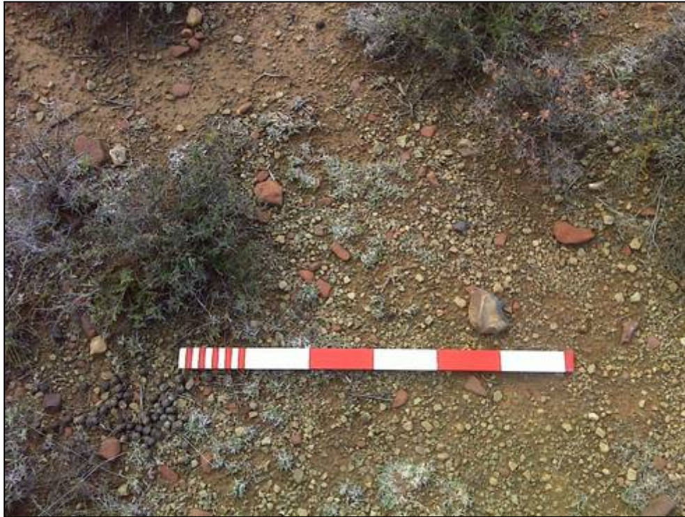
Figure 10. Small knapping / manufacture site documented within the surrounding area of the proposed position for the solar energy facility.