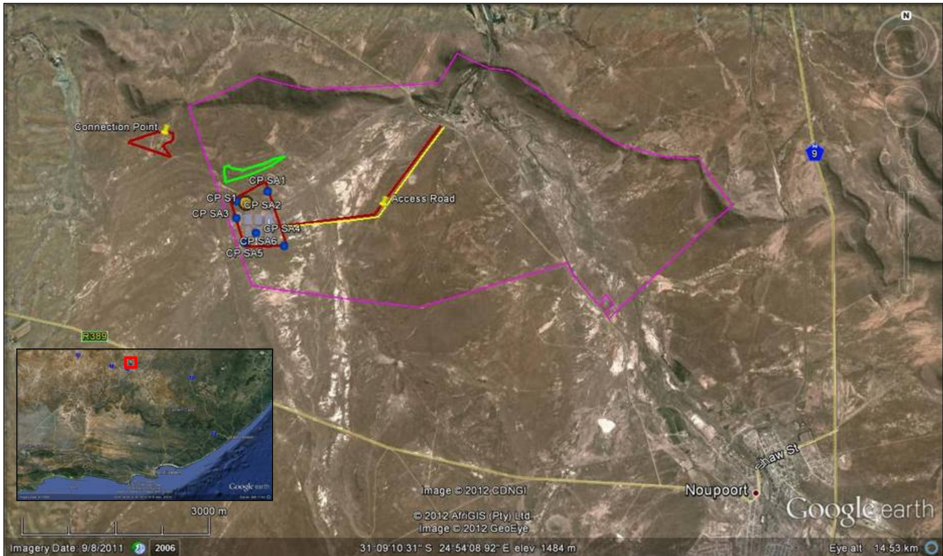
Figure 2. Aerial view of the location for the proposed Carolus Poort Solar Energy Facility (red: area surveyed; green: rocky outcrop; connection point shows the location of the proposed TSE Distribution Substation).