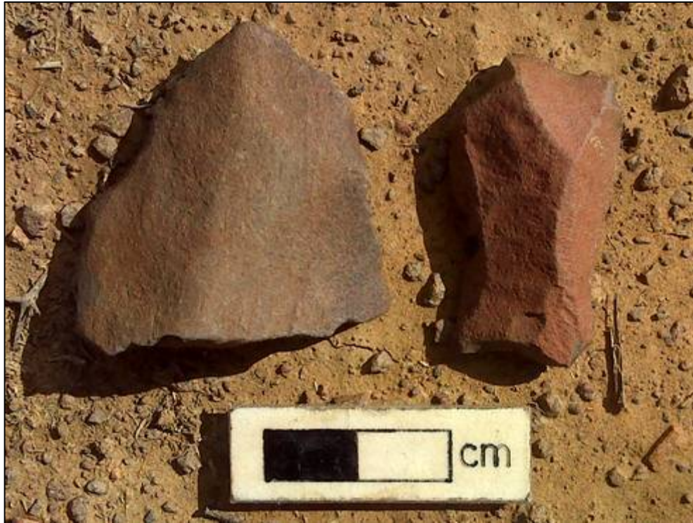
Figure 7. Examples of the stone artefacts identified within the proposed area for development.

One stone artefact surface scatter that resembled a small stone knapping / manufacturing area, considered an archaeological site, was documented about 50m north of the boundary of proposed development area (CP S1; Figure 3) (Figure 10). This is indicated by the occurrence of cores and associated debris such as flakes and chips within the 10m x 10m area. This type of site may not be limited to only this incidence.