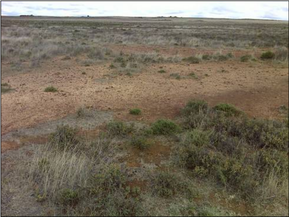
Figure 5. View of the general landscape and sparse vegetation.