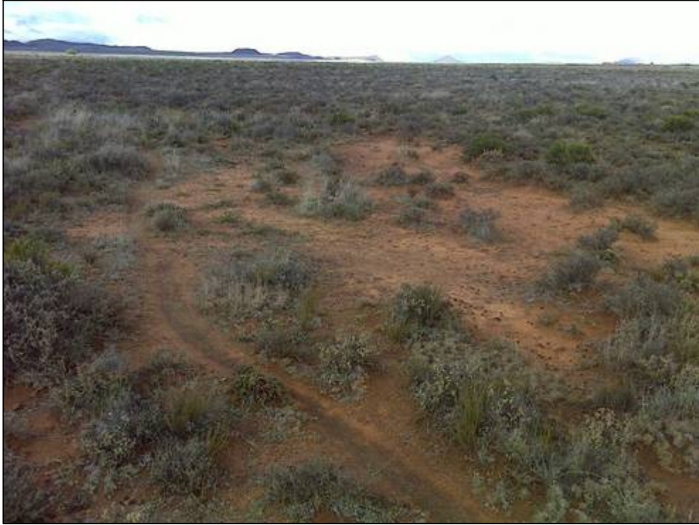
Figure 4. View of the general landscape and sparse vegetation.