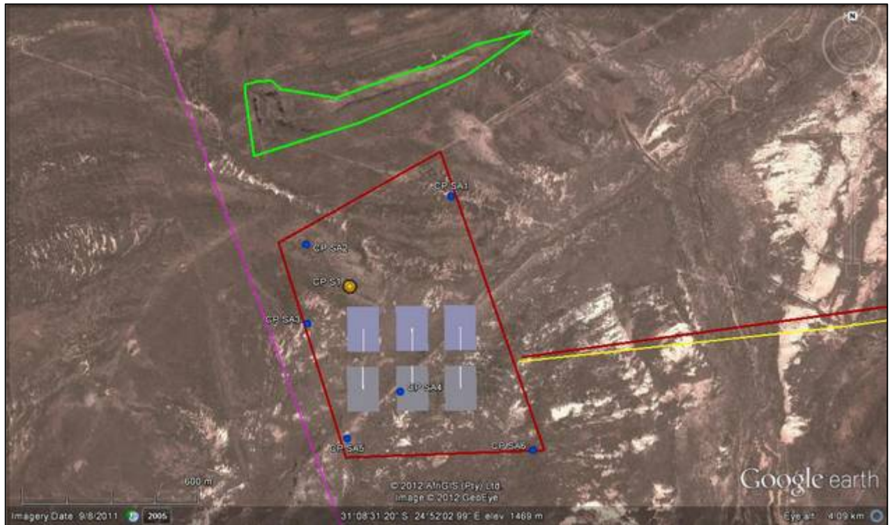
Figure 3. Close-up aerial view of the area for the proposed Carolus Poort Solar Energy Facility showing the extent of the area surveyed and stone artefact scatter.

The archaeological investigation was conducted on foot focusing on the proposed area for the Carolus Poort Solar Energy Facility and the immediate surrounding environment. The GPS co-ordinate readings and photographs were taken using a Garmin Oregon 550 unit.