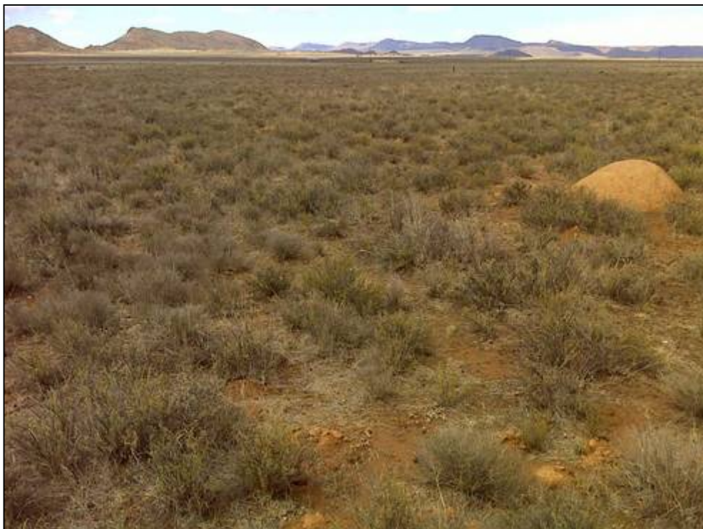
Figure 5. View of the general landscape.