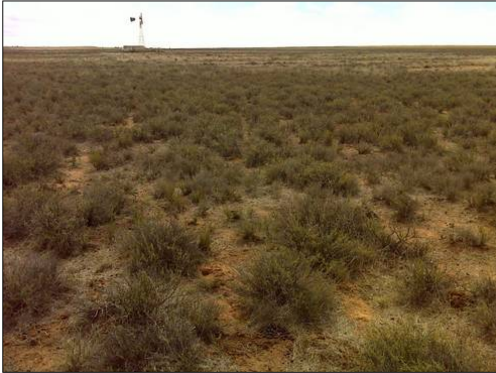
Figure 4. View of the general landscape.