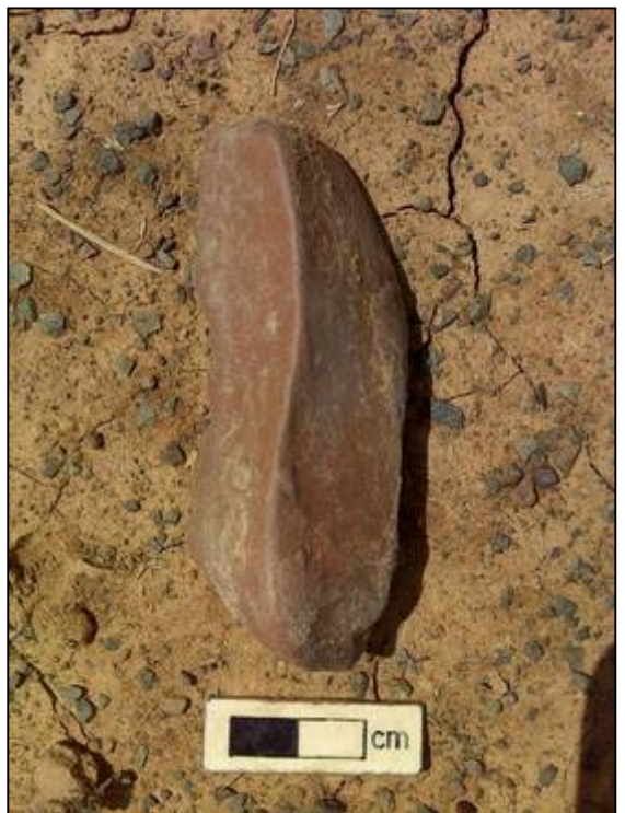
Figures 9-12. Examples of the stone artefacts identified within the proposed area for development.