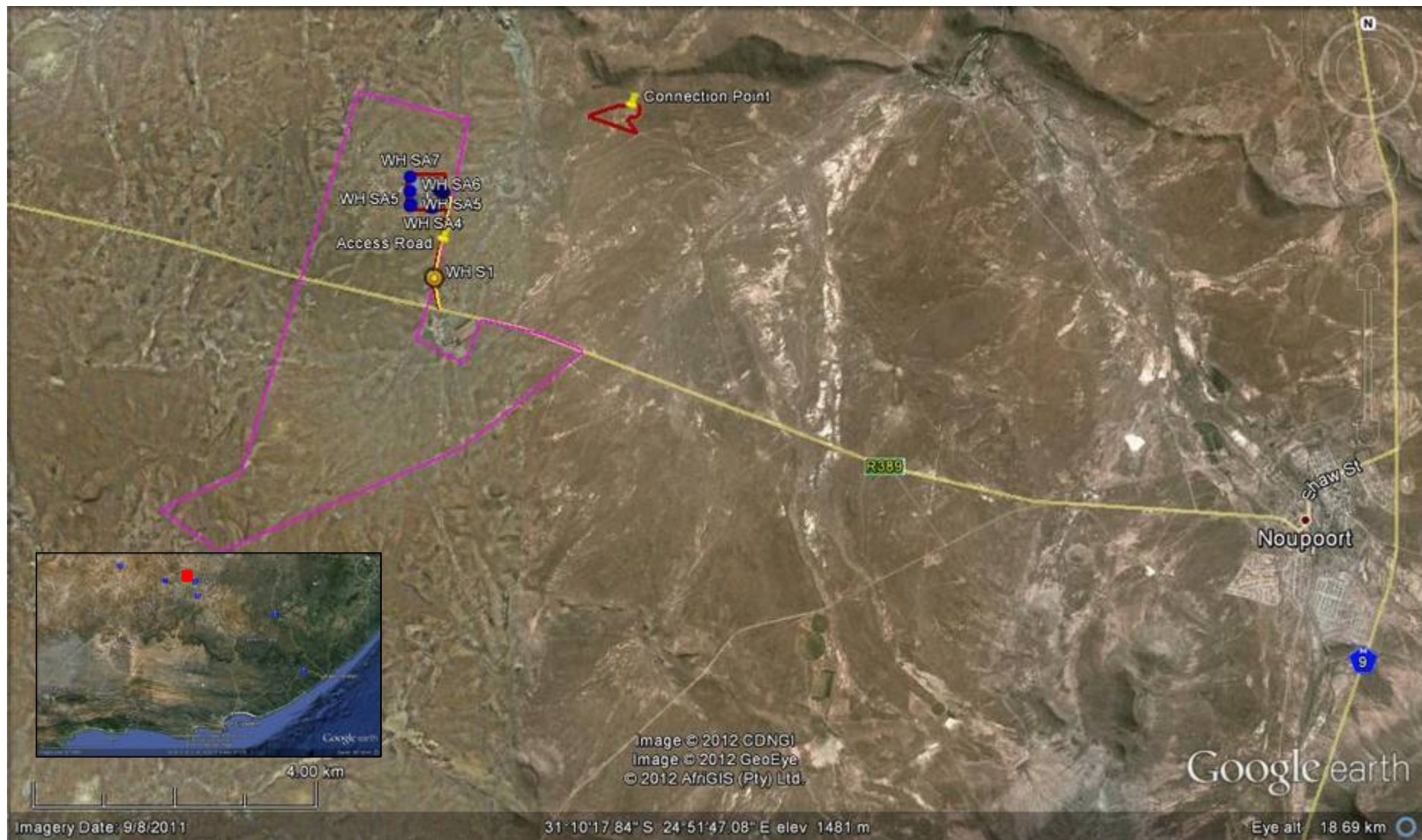
Figure 2. Figure 2. Aerial view of the location for the proposed Wonderheuwel Solar Energy Facility and associated access road (red border and line shows areas surveyed). The proposed TSE Distribution Substation (connection point) is situated 3 km north-east of the Wonderheuwel SEF site.