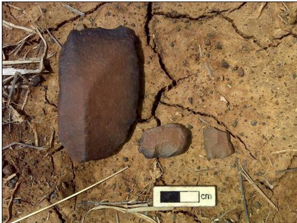
Figure 8. Examples of the stone artefacts identified within the proposed area for development.

The area surrounding the rocky outcrop and koppie is considered an archaeological site owing to the density of stone artefacts. Evidence of knapping / manufacture of stone artefacts was observed by the remains of cores and associated debris such as flakes, chunks, and chips.