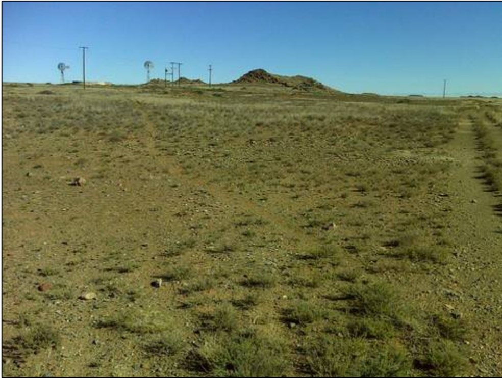
Figure 6. View of the koppie adjacent to the proposed access road.