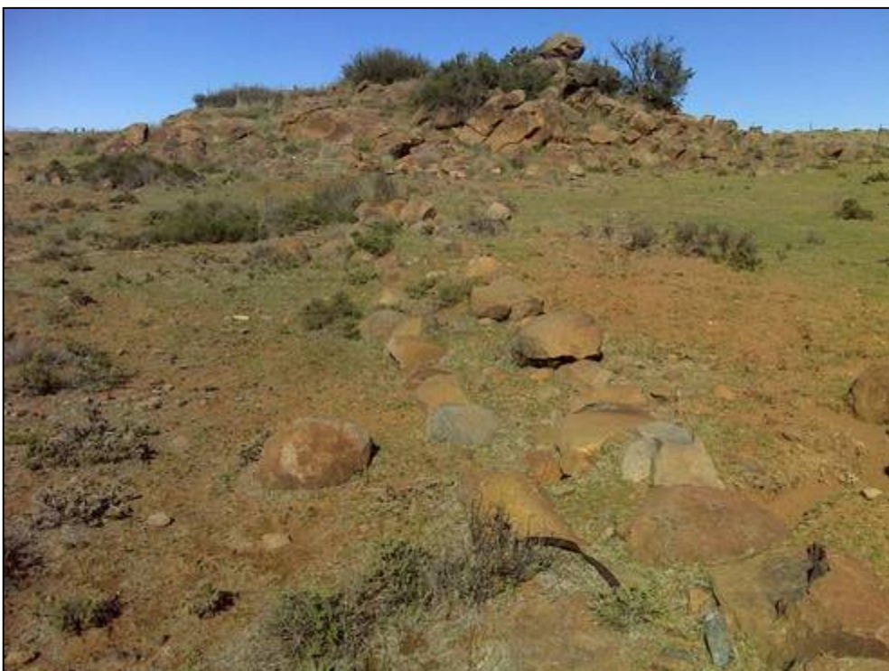
Figure 7. Close-up of the small rocky outcrop adjacent to the proposed access road..