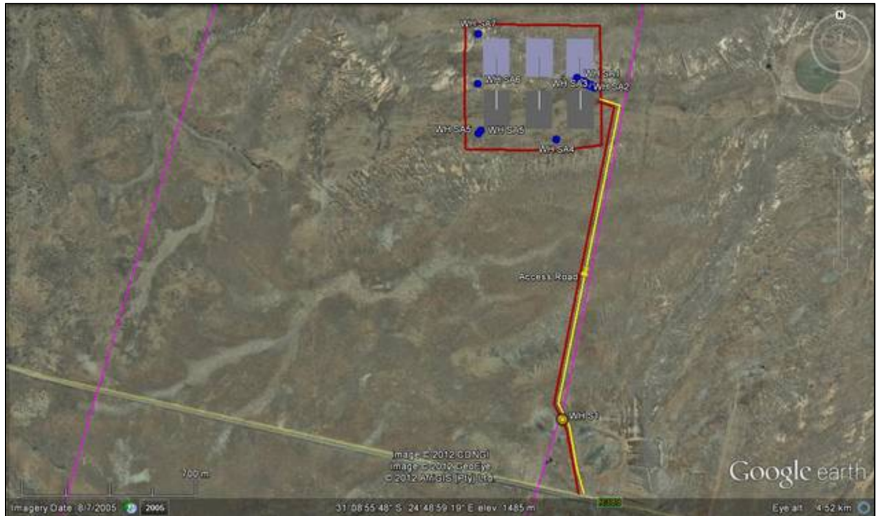
Figure 3. Close-up aerial view of the proposed area for the Wonderheuwel Solar Energy Facility and associated road showing the area surveyed (red) and distribution of stone artefacts (blue) as well as the site that occurs adjacent to the access road (WHS1).

The archaeological investigation was conducted on foot focusing on the proposed area for the Wonderheuwel Solar Energy Facility and the immediate surrounding environment. The GPS co-ordinate readings and photographs were taken using a Garmin Oregon 550 unit.