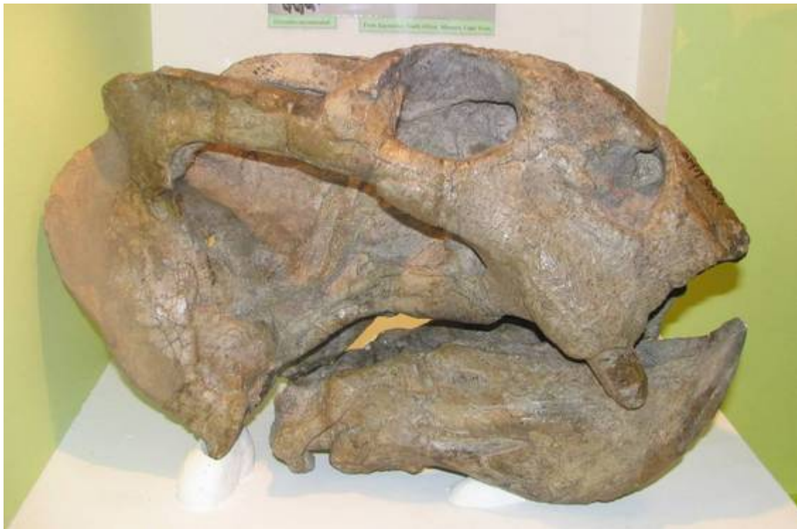
Figure 3: Fossil skull of Dicynodon

The Dicynodon Assemblage Zone is characterised by the presence of herbivorous synapsid fossils such as Dicynodon from which the name of this assemblage zone was derived (see Fig. 3) and Oudenodon (see Fig. 4). Carnivorous synapsid fossils include gorgonopsians (see Fig. 5), therocephalians (see Fig. 6) and cynodonts.