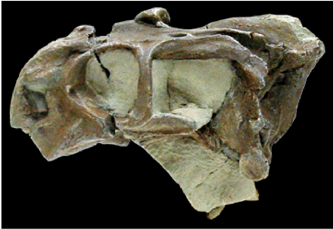
Figure 4: Fossil skull of Oudenodon