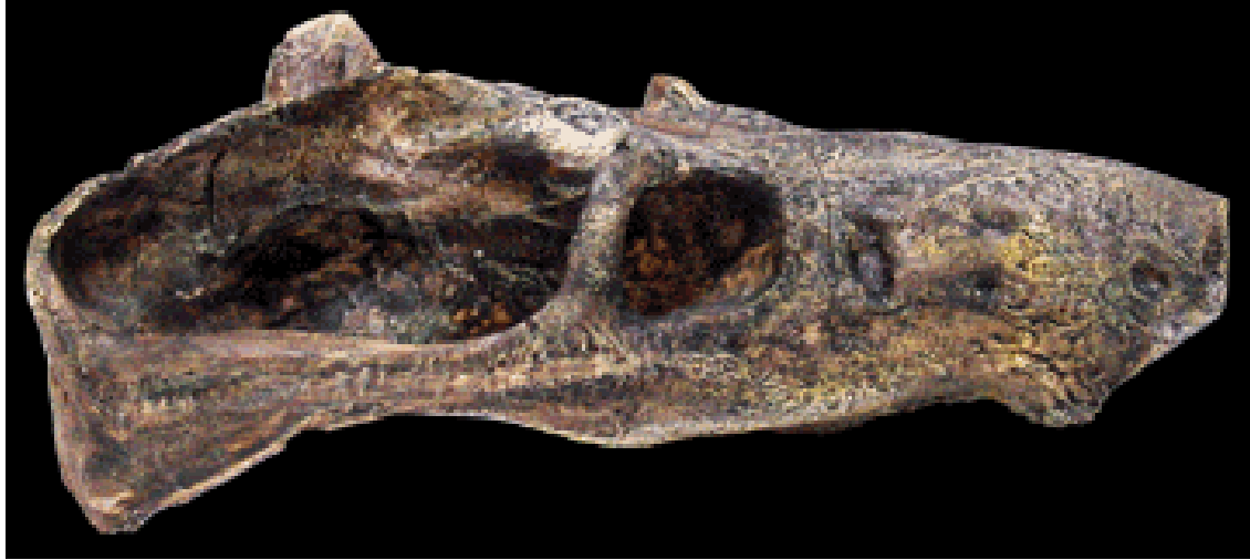
Figure 6: Fossil skull of the therocephalian Theriognathus

Fossil reptiles (other than synapsids) such as Pareiasaurus , Milleretta and Owenetta (see Fig. 7), amphibian fossils such as Rhinesuchus and fish fossils such as Atherstonia (see Fig. 8) and Namaichthys are known from this zone. Plant fossils include Glossopteris leaf imprints (see Fig. 9) and fossilised wood (Rubidge, 1995).