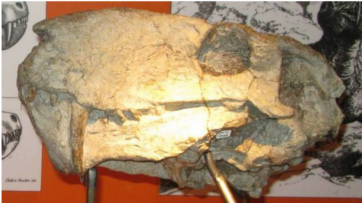
Figure 5: Fossil skull of a gorgonopsian