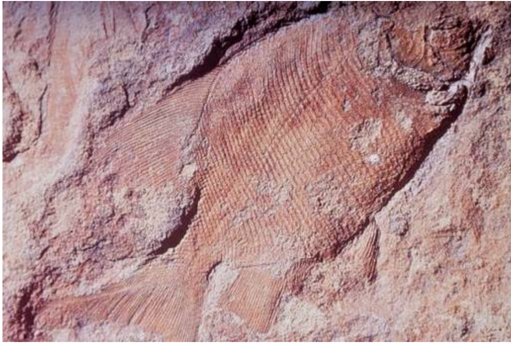
Figure 8: Atherstonia