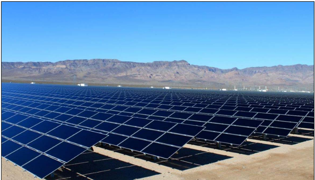
Figure 4. Solar plants

Similar studies have determined that power lines 132 kV and above are visible but not intrusive in daylight from 5km away. Power lines are however not seen as intrusive until they are 450m or closer to the observer. This aspect will vary especially in cases of cultural landscapes rather than cultural sites. In the case of cultural landscapes the sense of thoroughfare created by the power lines can be seen as detrimental to the landscape character and can significantly influence the "sense of place".