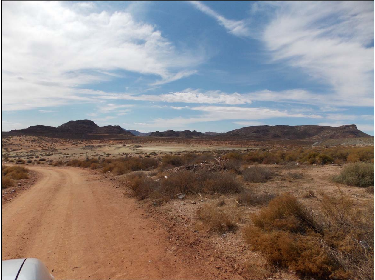
Figure 3. General Landscape (notice tailings dam in center of picture)