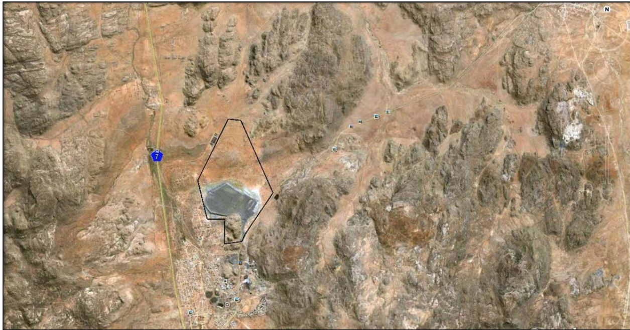
Figure 2. Aerial view of study area