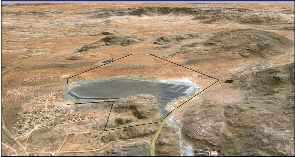
Figure 5. Study area topographical landscape