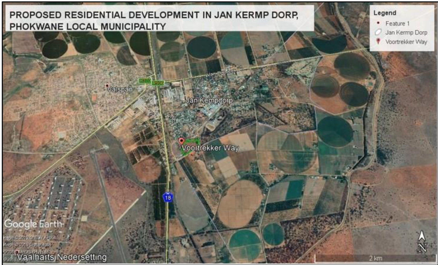
Figure 1: The proposed housing development on portion 42 of the farm Geldunskat 36, Jan Kempdorp, Northern Cape Provinc. Map provided by NSVT Consultants.