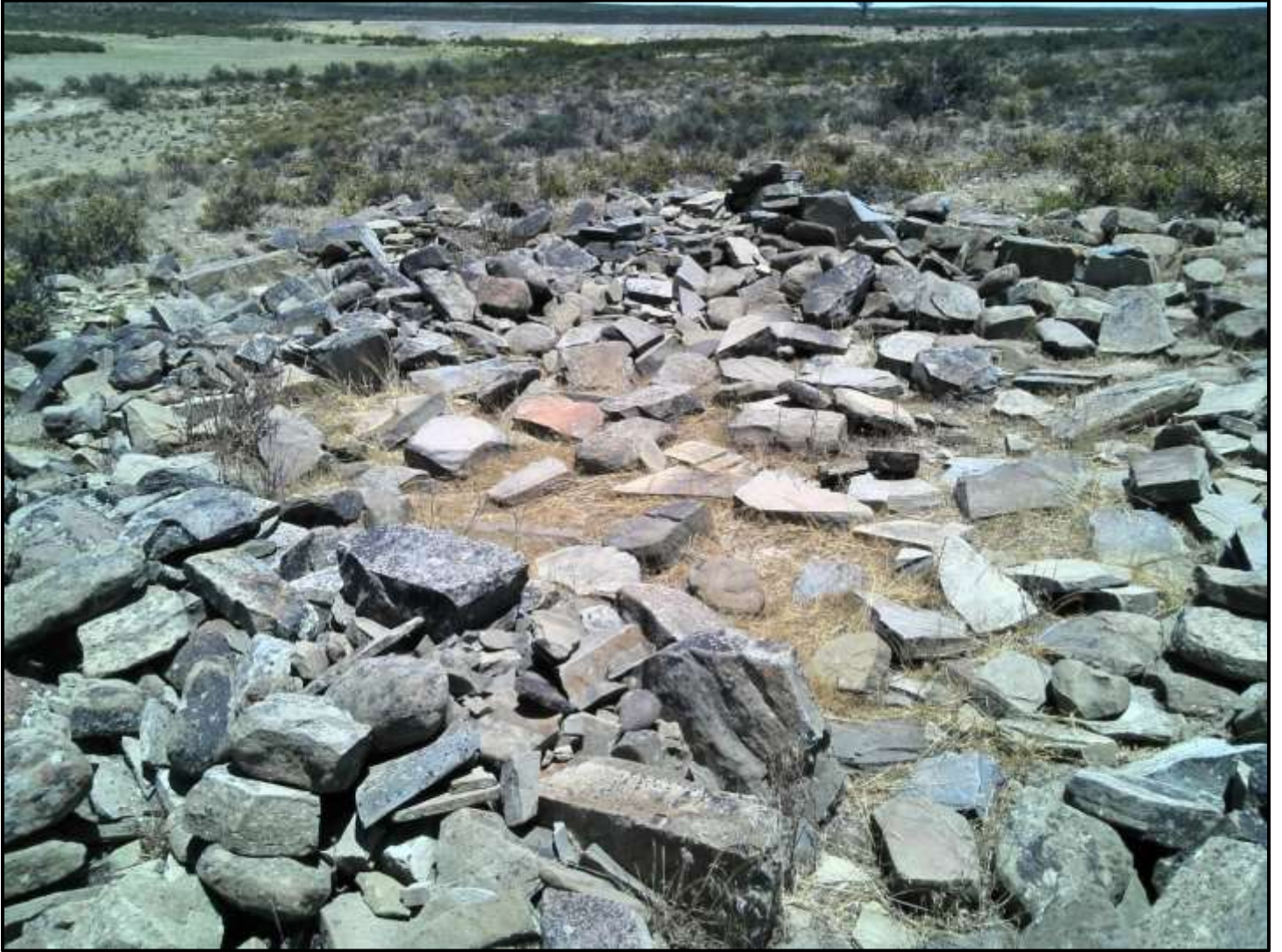
Figure 6: Foundations of rectangular structure.