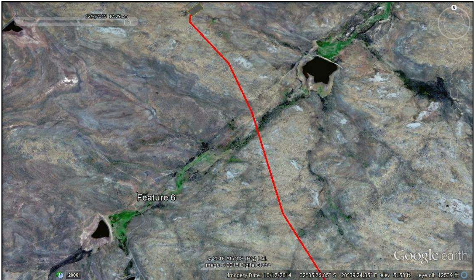
Figure 8. Feature 6 in relation to the proposed power line.