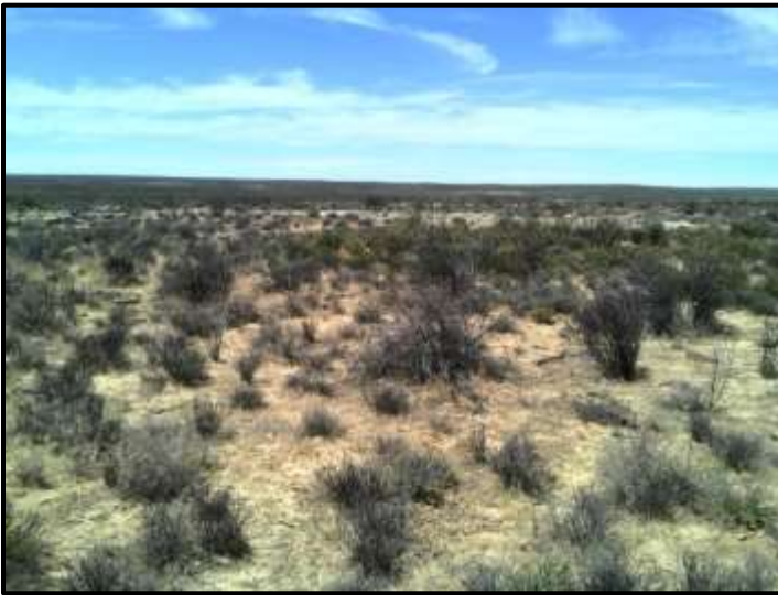
Figure 4. General site conditions in the northern portion of the study area.