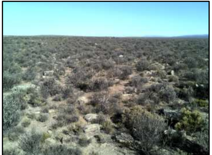
Figure 5. General site conditions in the northern portion of the study area.