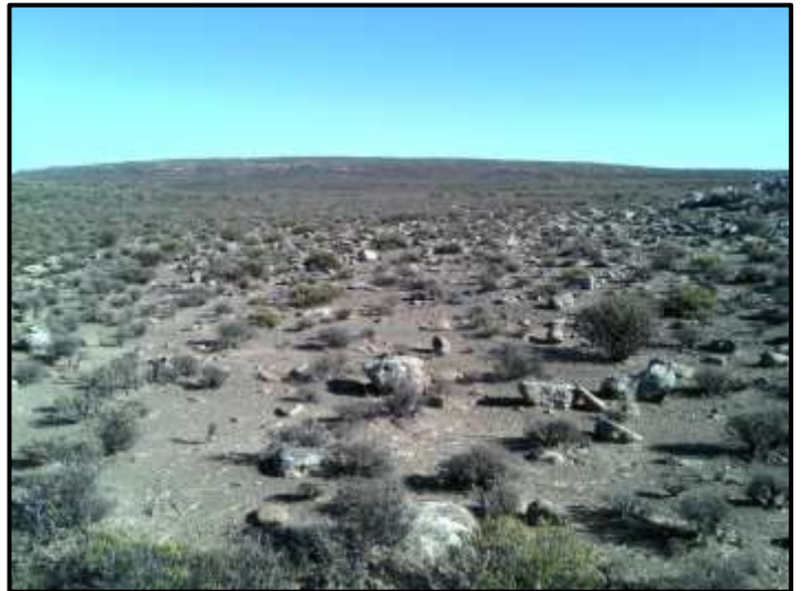
Figure 3. Site conditions in the northern portion of the study area.