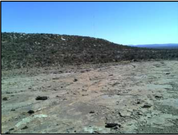
Figure 2. Rocky ridges in the study area.