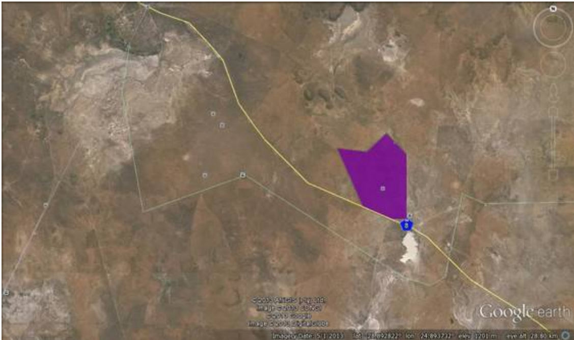
Map 1. Google Earth image indicating the project area north of the N8 south east of Kimberley and relative to the major Alexandersfontein pan (lighter-coloured East North East of the project).