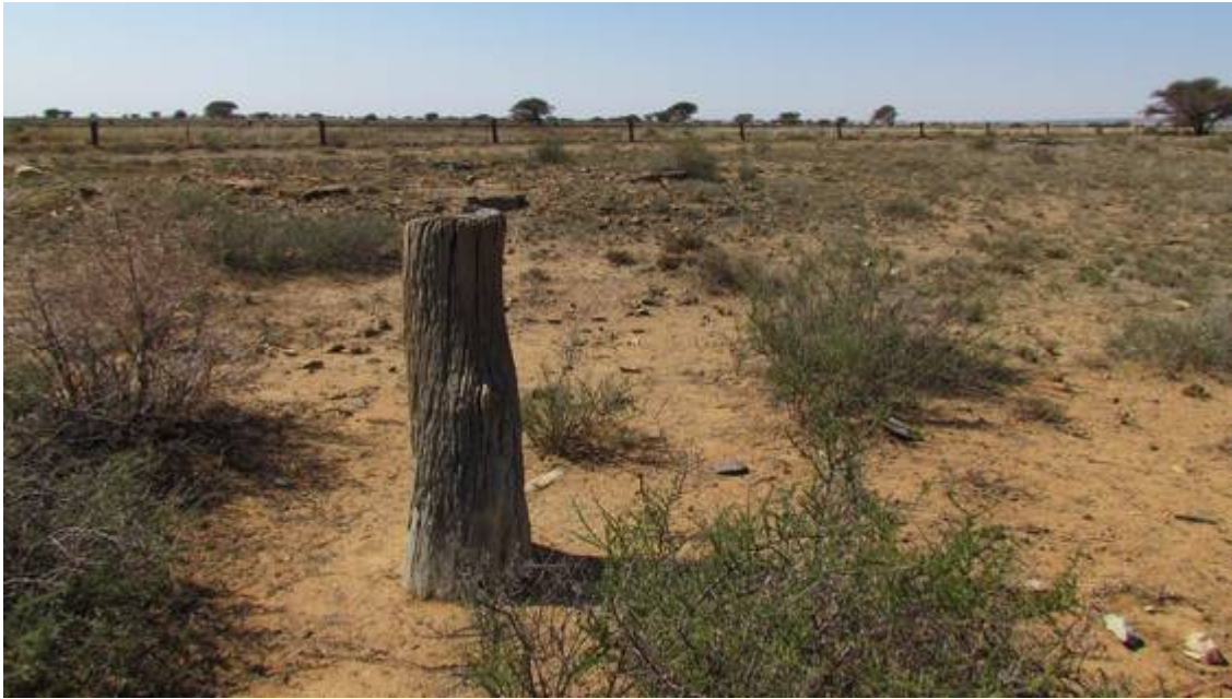
Foundations beyond tree stump – railway in the background.