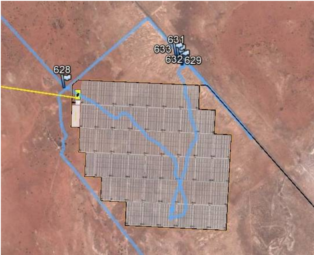
Map 2. Footprint of the proposed Blackwood Solar Energy Facility, with GPS track mapped.