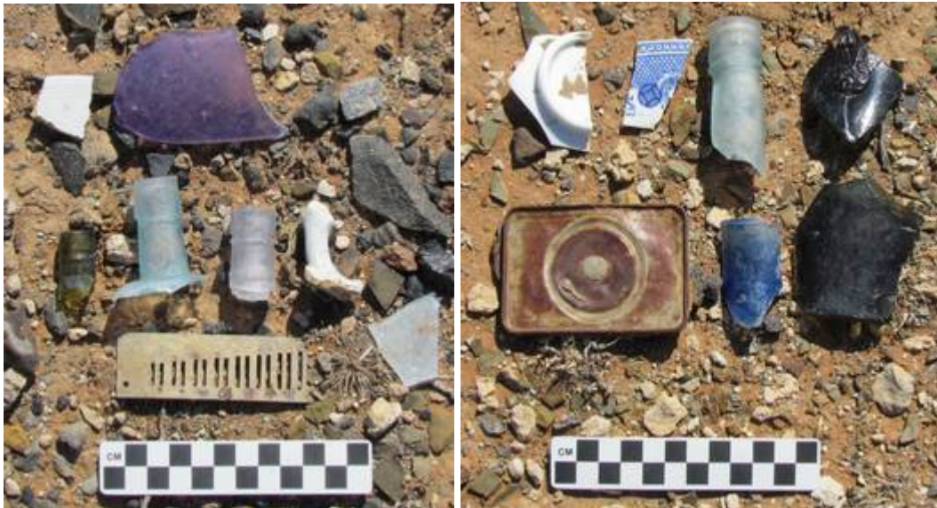
Artefacts from the ash middens

Packed stone fortifications undoubtedly relating to the Anglo-Boer War and protecting roads and approaches in this strategic zone east of Kimberley were found on the dolerite hills west and north of the proposed solar energy site and, in one instance, within 50 metres from the overhead powerline route alternative 4.