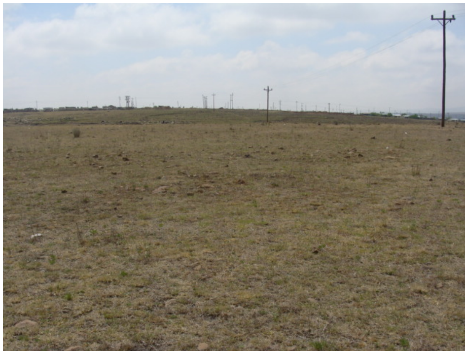
Figure 6 General view of the surveyed area showing low grass cover.