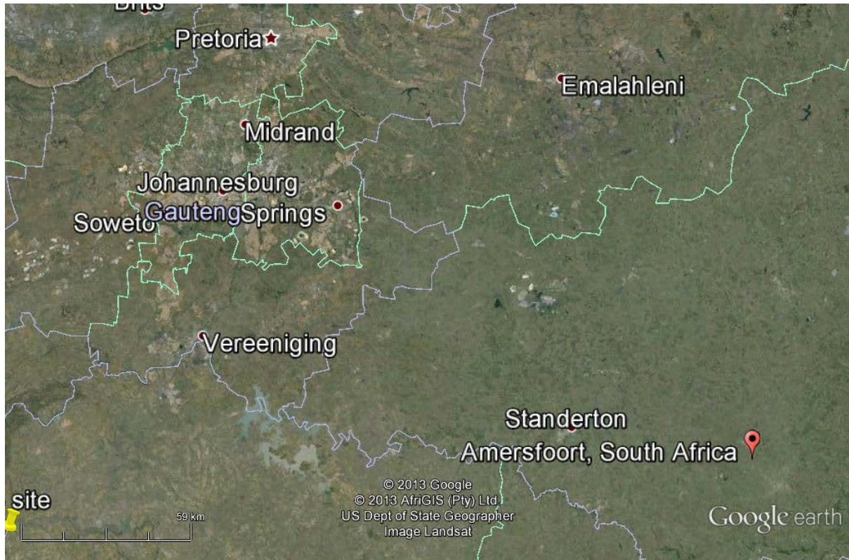
Figure 1 Location of the town of Amersfoort in the Mpumalanga Province. North reference is to the top of the map.

The client indicated the area where the proposed development is to take place. The field survey was confined to this area.