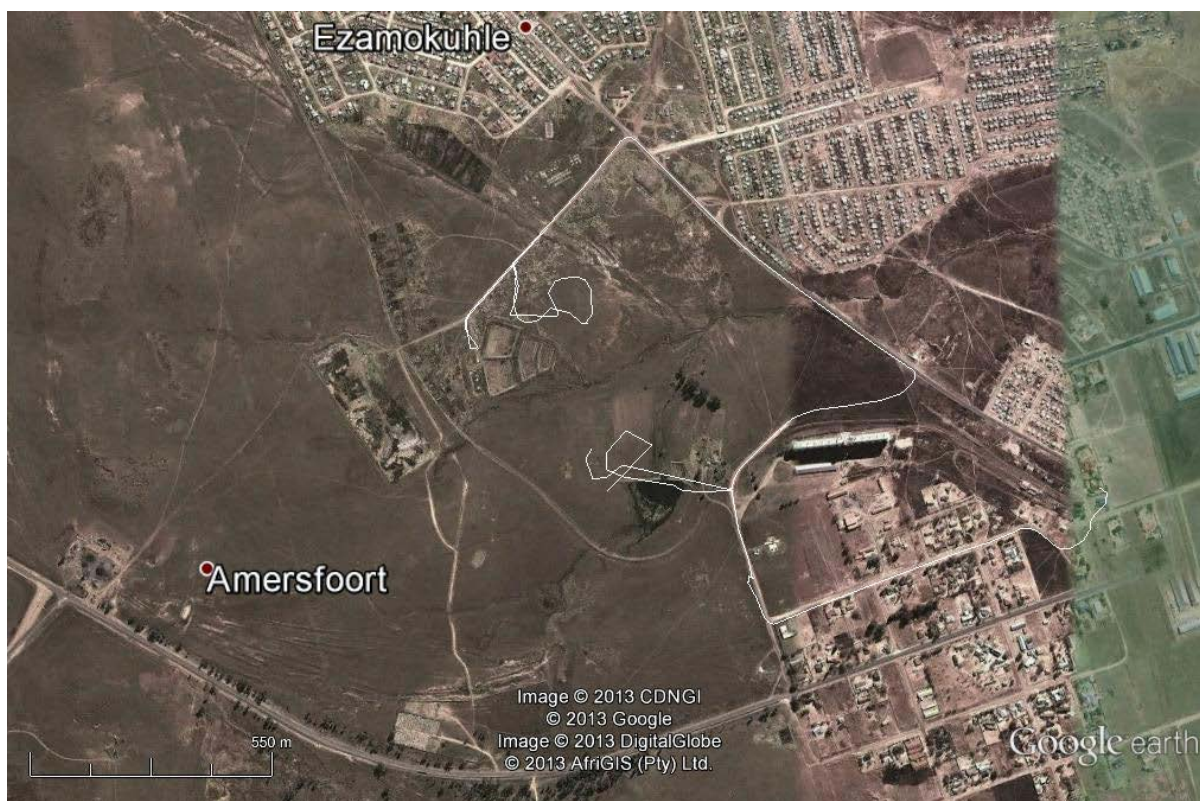
Figure 5 GPS track of the surveyed area. North reference is to the top.

If required, the location/position of any site was determined by means of a Global Positioning System (GPS) 1 , while photographs were also taken where needed. The survey was undertaken by a physical survey via off-road vehicle and on foot (Figure 4). The area that was investigated is 5 Ha in size and one hour was spent in the field.