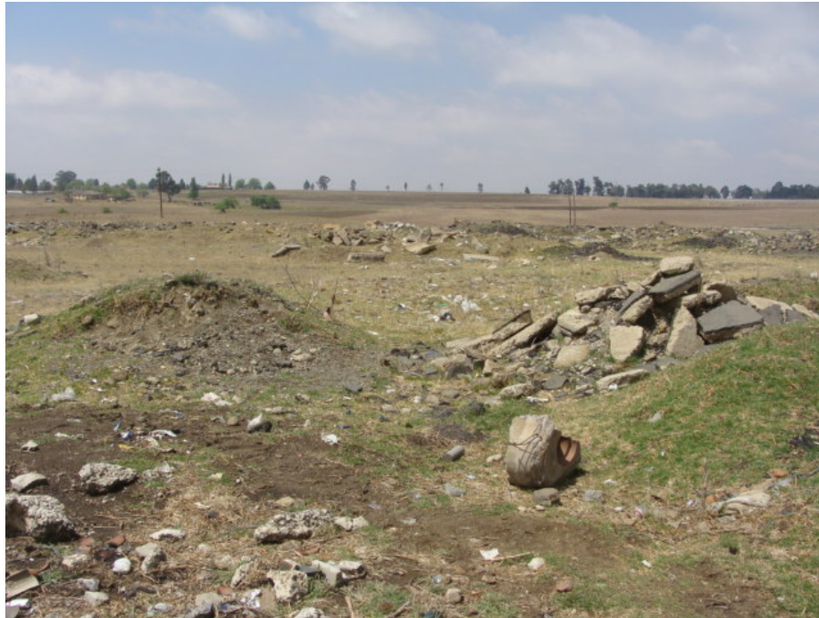
Figure 5 General view of the surveyed area showing illegal dumping.