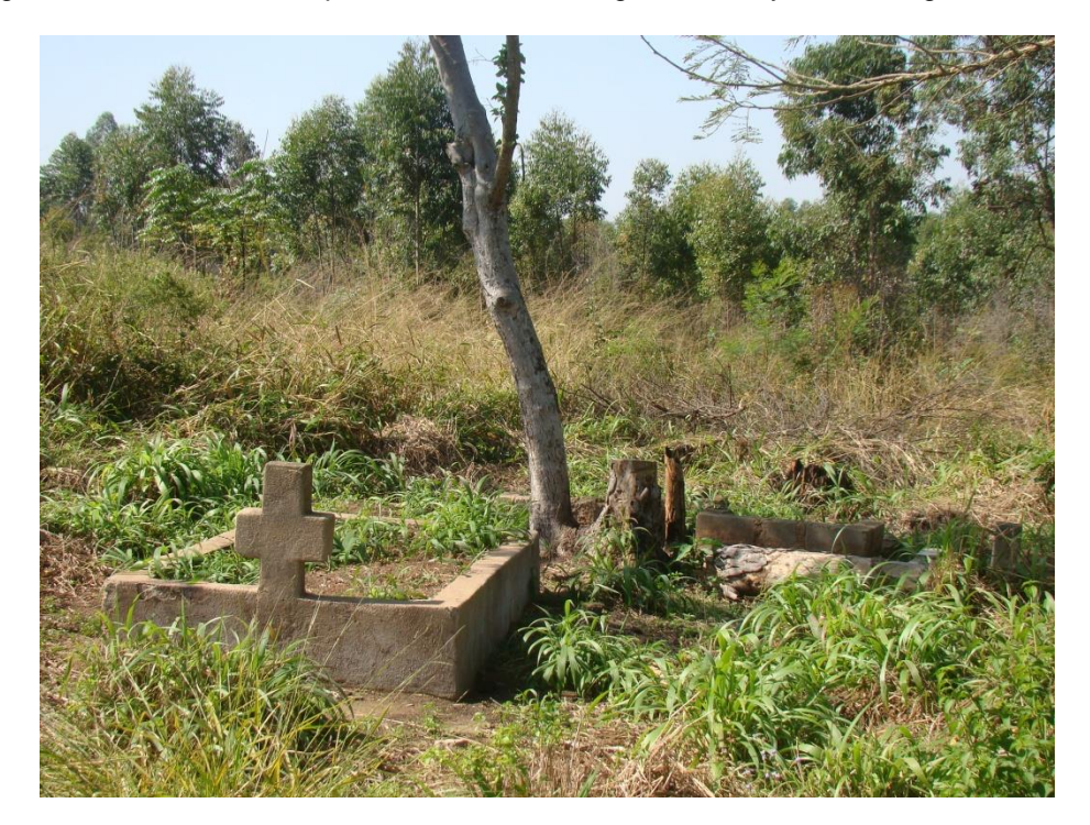
Fig. 6: A small graveyard was identified in the north eastern corner of the study area.