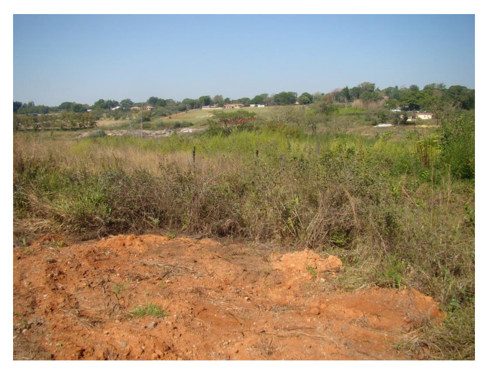
Fig. 5: One of the soil samples which was investigated for any archaeological evidence.