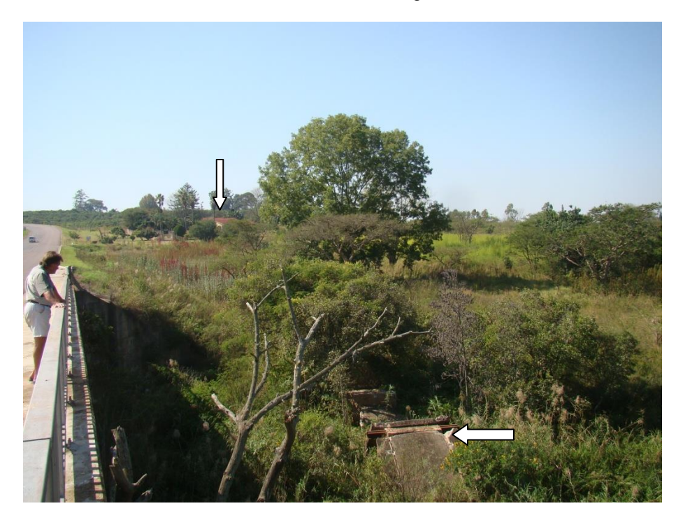
Fig. 2: A general view of the study area from the new bridge on the R40. The bridge is located on the south western corner of the study area. One of the residences is seen in the background (see arrow). The old bridge across the White River is below the new bridge (see arrow).

Fig. 1: General view of the study area from the north east towards the south west. The town of White River is seen in the background.