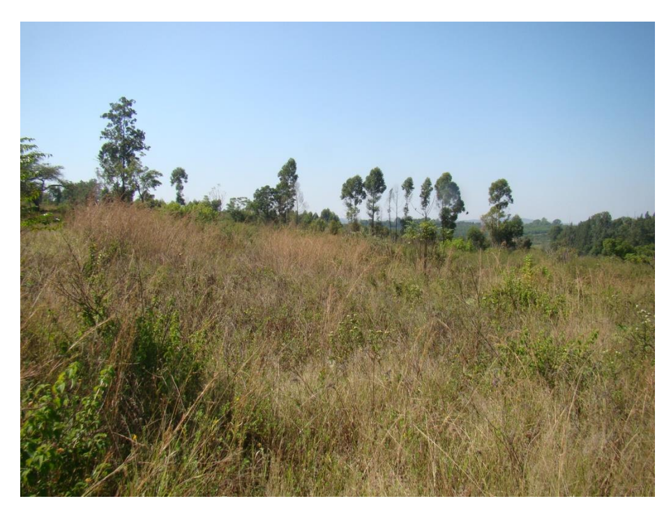
Fig. 4: A general view of the study area towards the east. The bluegum trees form the eastern border of the property.

Fig. 3: A general view of the study area towards the south. The White River is indicated by the black line and forms the southern border of the property.