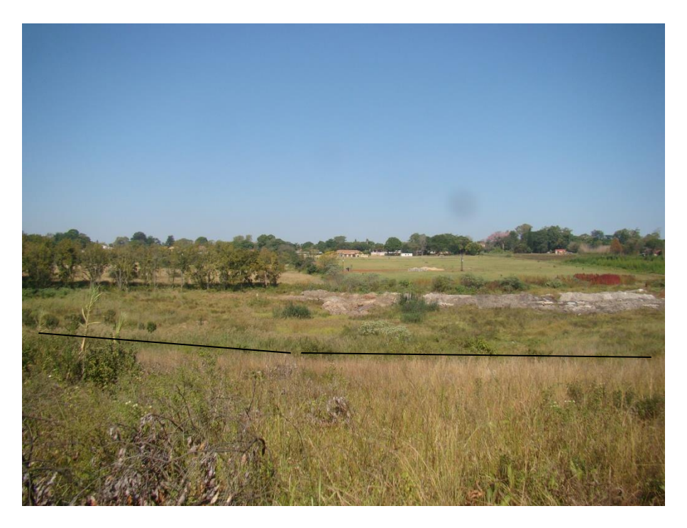
Fig. 3: A general view of the study area towards the south. The White River is indicated by the black line and forms the southern border of the property.