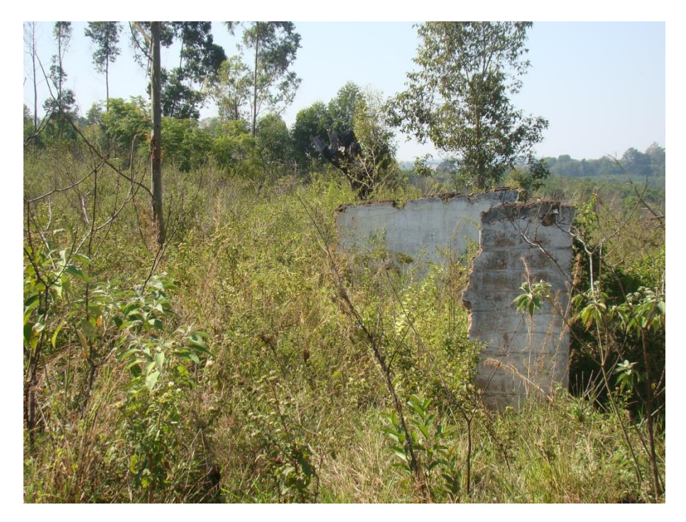
Fig. 8: The recent ruin on the property.