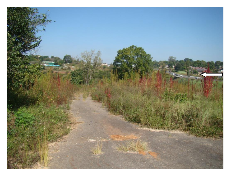
Fig. 9: The old tarred road was replaced by a new road (the R40) in the background (see arrow).