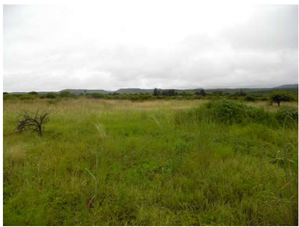
Photograph 5: Site characteristics