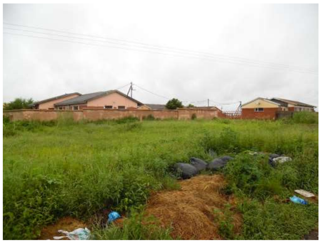
Photograph 4: Site characteristics