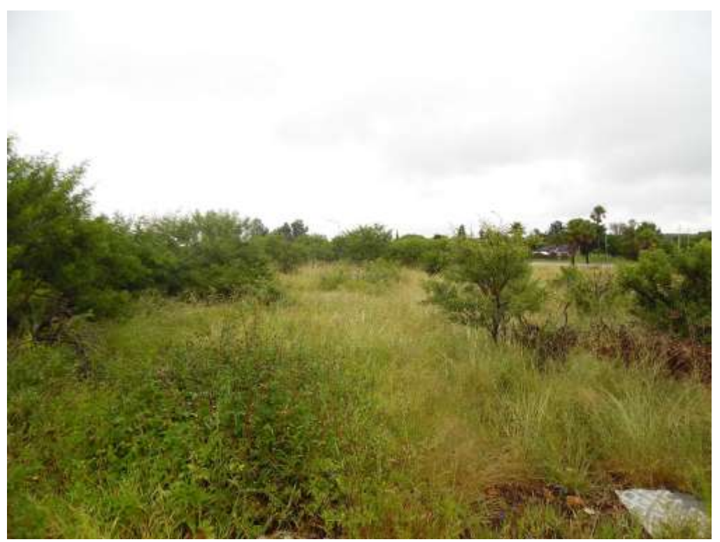
Photograph 2: Site characteristics