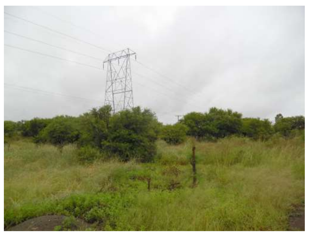
Photograph 6: Site characteristics