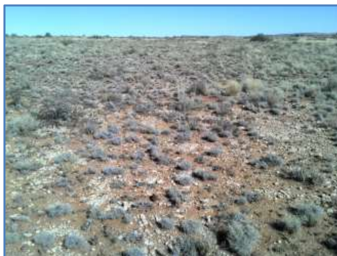
Figure 5. Site conditions in the Karoshoek CSP study area.