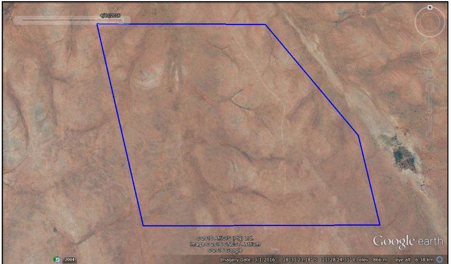
Figure 3. Google image of the study area.