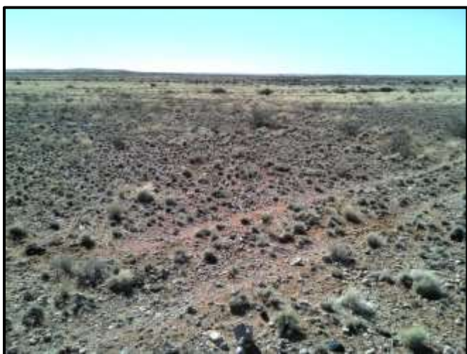
Figure 4. General Site conditions