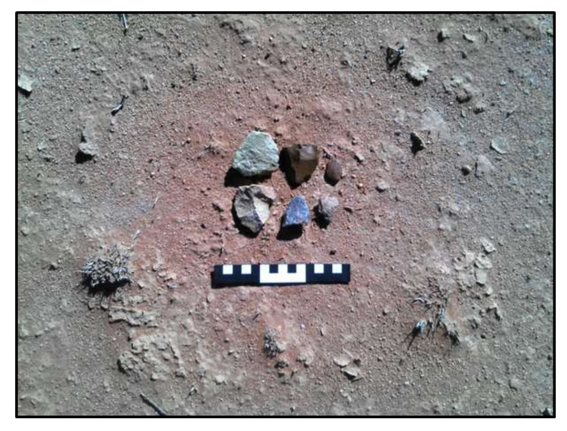
Figure 6. Range of raw materials used and isolated MSA and LSA flakes.