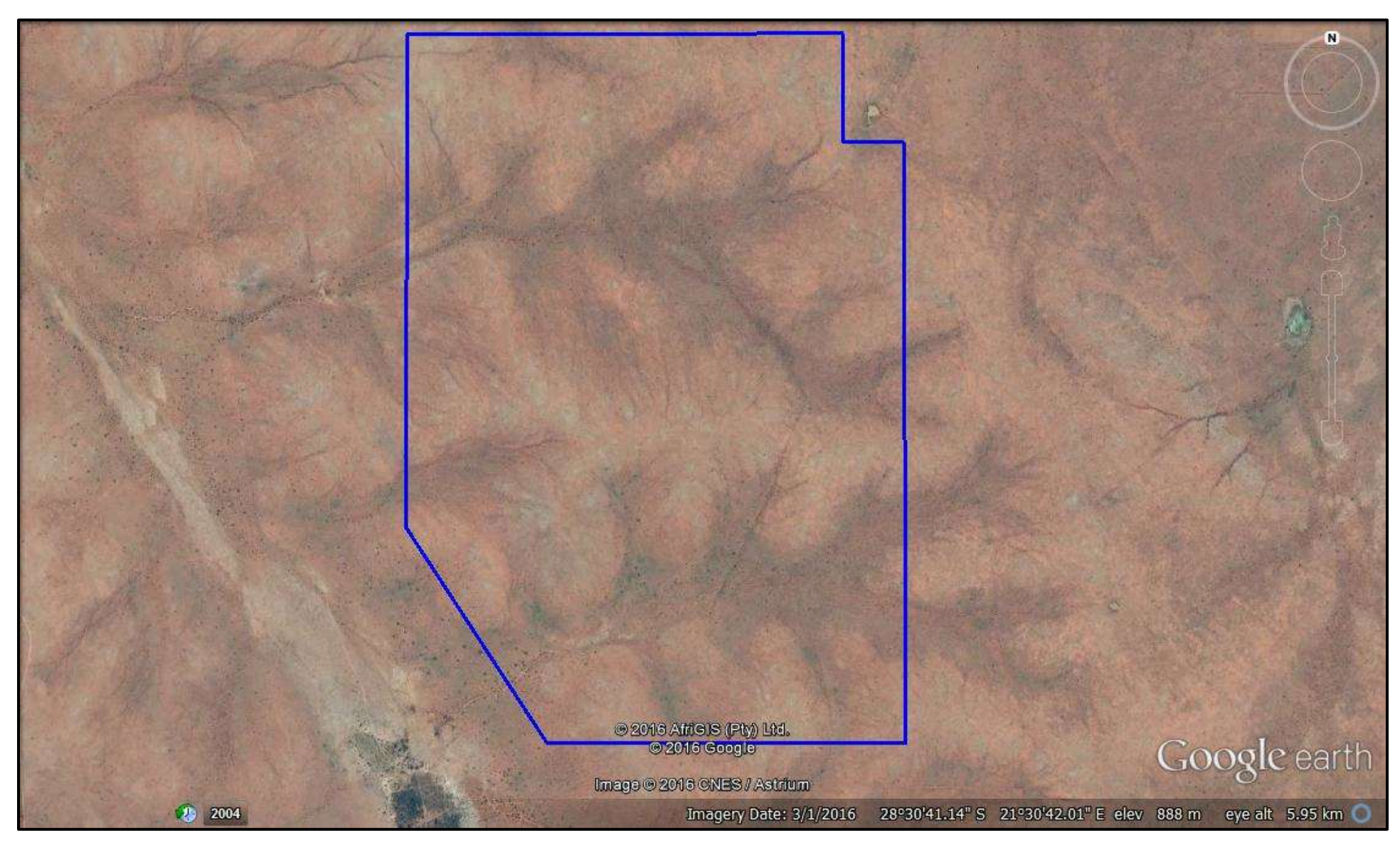
Figure 3. Google image of the study area.