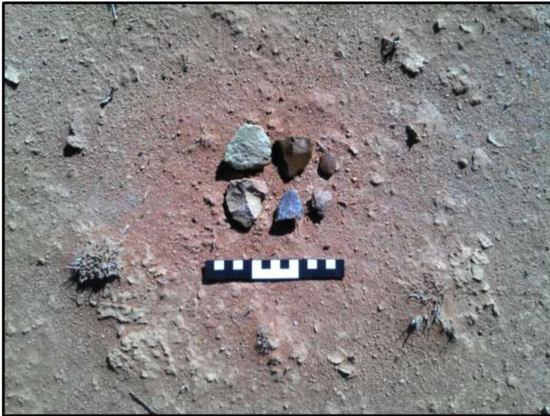
Figure 6. Range of raw materials used and isolated MSA and LSA flakes.