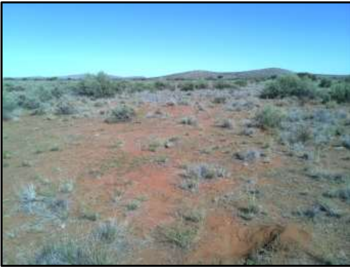
Figure 4. General Site conditions