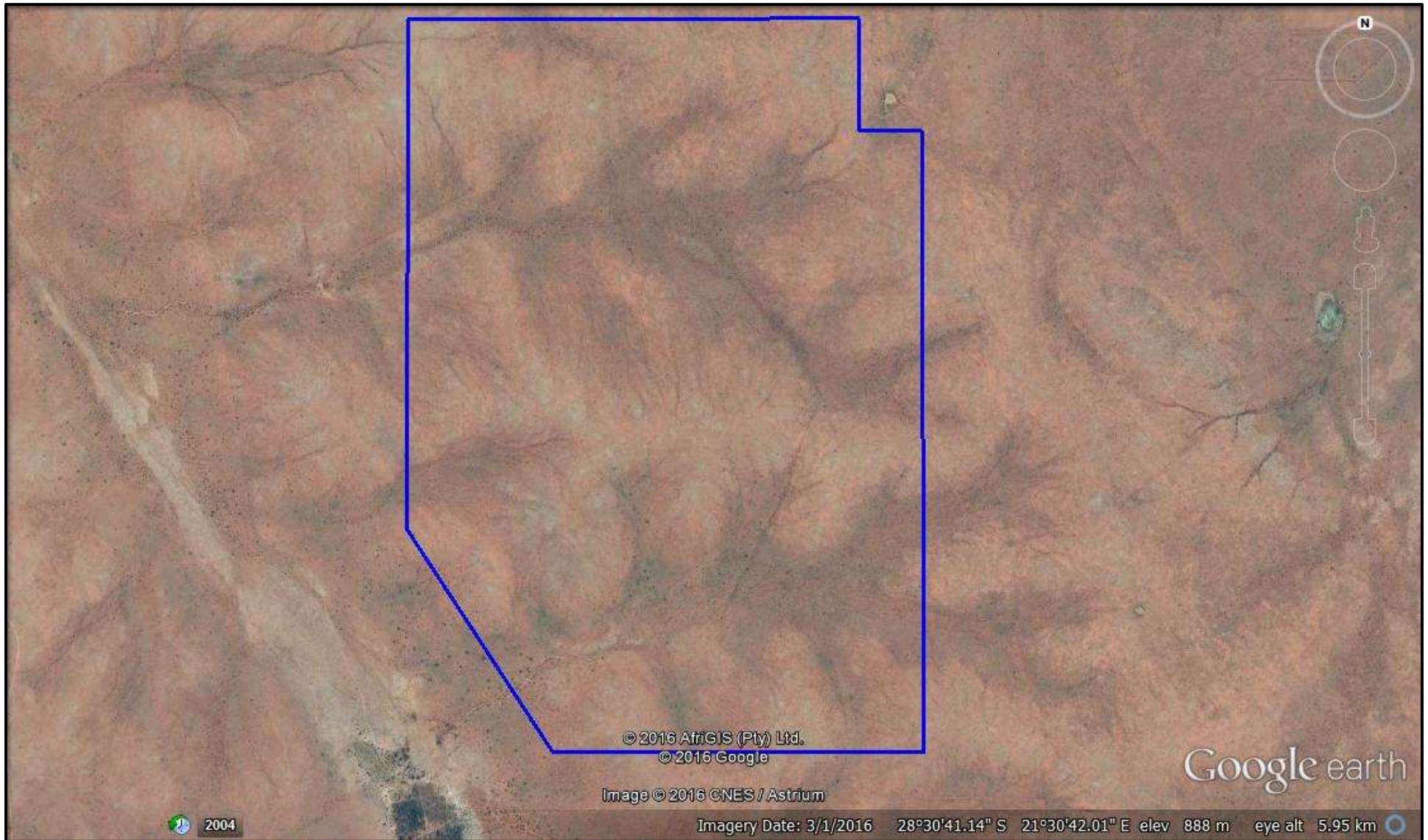
Figure 3. Google image of the study area.