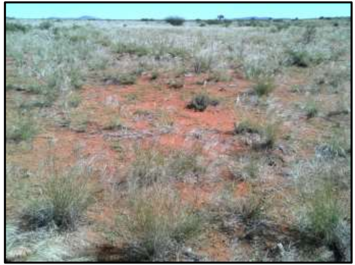
Figure 5. Site conditions in the Karoshoek CSP study area.