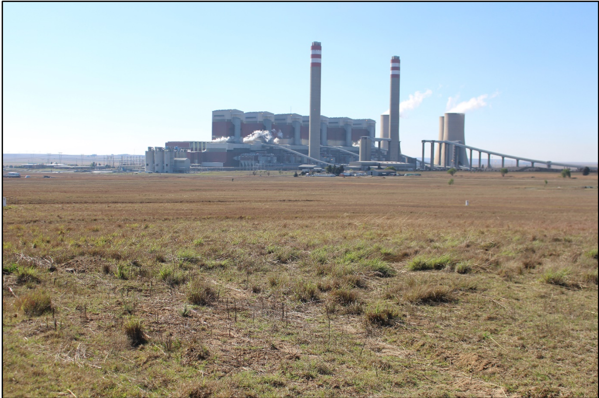
Figure 5. Majuba power facility station, Gert Sibande Magisterial District, Seme Local Municipality, Mpumalanga Province.