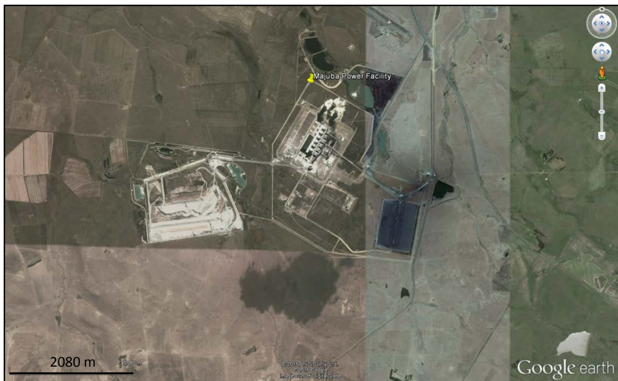
Figure 1: Satellite image of the Majuba power station and Solar panel development area.

Eskom Holdings (SOC) Ltd has appointed Savannah Environmental (Pty) Ltd to undertake a full Environmental Impact Assessment of the proposed Majuba Solar PV. Savannah Environmental selected the National Museum, Bloemfontein to conduct the Phase 1 Palaeontological Impact Assessment which will form part of the final Heritage Impact Report. The surface area of the proposed project area is approximately 96.6 ha.