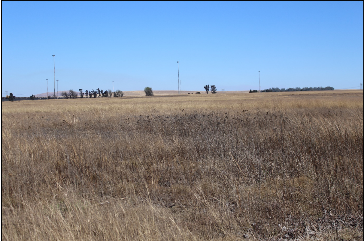
Figure 4. Lush, grass vegetation at the proposed new development at Majuba power facility station, Gert Sibande Magisterial District, Seme Local Municipality, Mpumalanga Province.