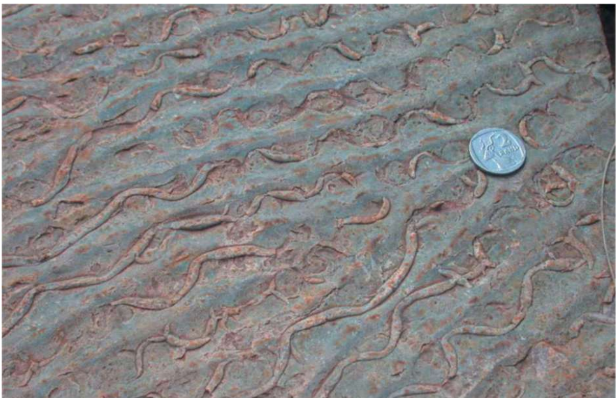
Figure 5: Vermiform trace fossil Manchuriophycus from a bedding plane in the Magaliesberg Formation east of Pretoria. Figure taken from Bosch and Eriksson (2017; Fig 7).