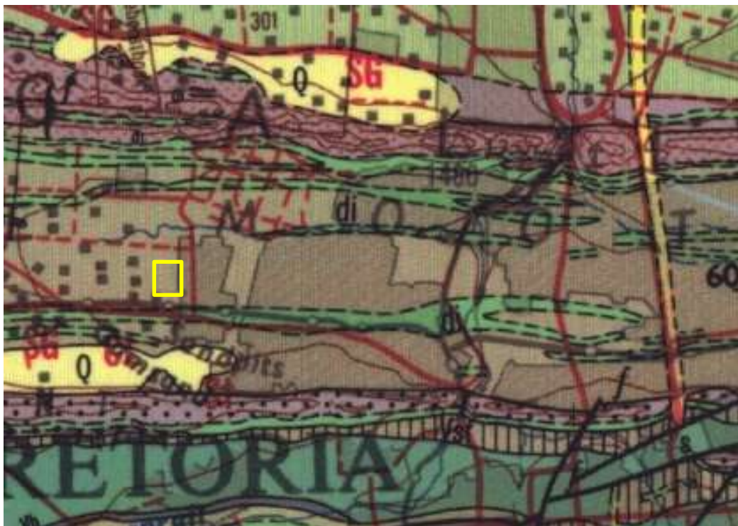
Figure 2: Geological map of the area around the Farms Zandfontein, northwest of Pretoria shown in yellow. Abbreviations are explained in Table 2. Map enlarged from the Geological Survey 1: 250 000 map 2528 Pretoria.