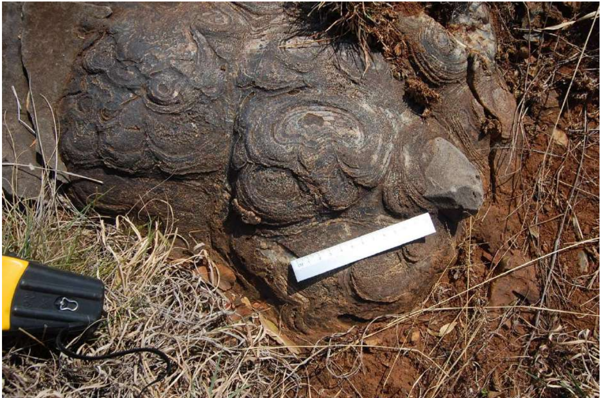
Figure 4: Stromatolites as seen from the surface.