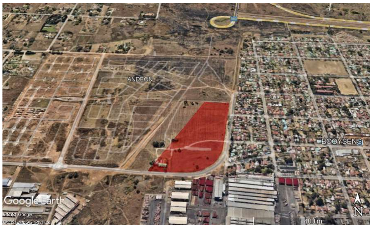
Figure 1: Google Earth map of the proposed residential township, Andeon X47, on Portion 183 (a Portion of Portion 179) of the Farm Zandfontein 317-JR, Tshwane, indicated in the red polygon.