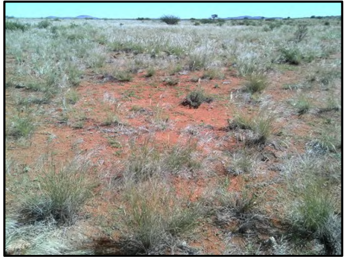
Figure 5. Site conditions in the Karoshoek CSP study area.