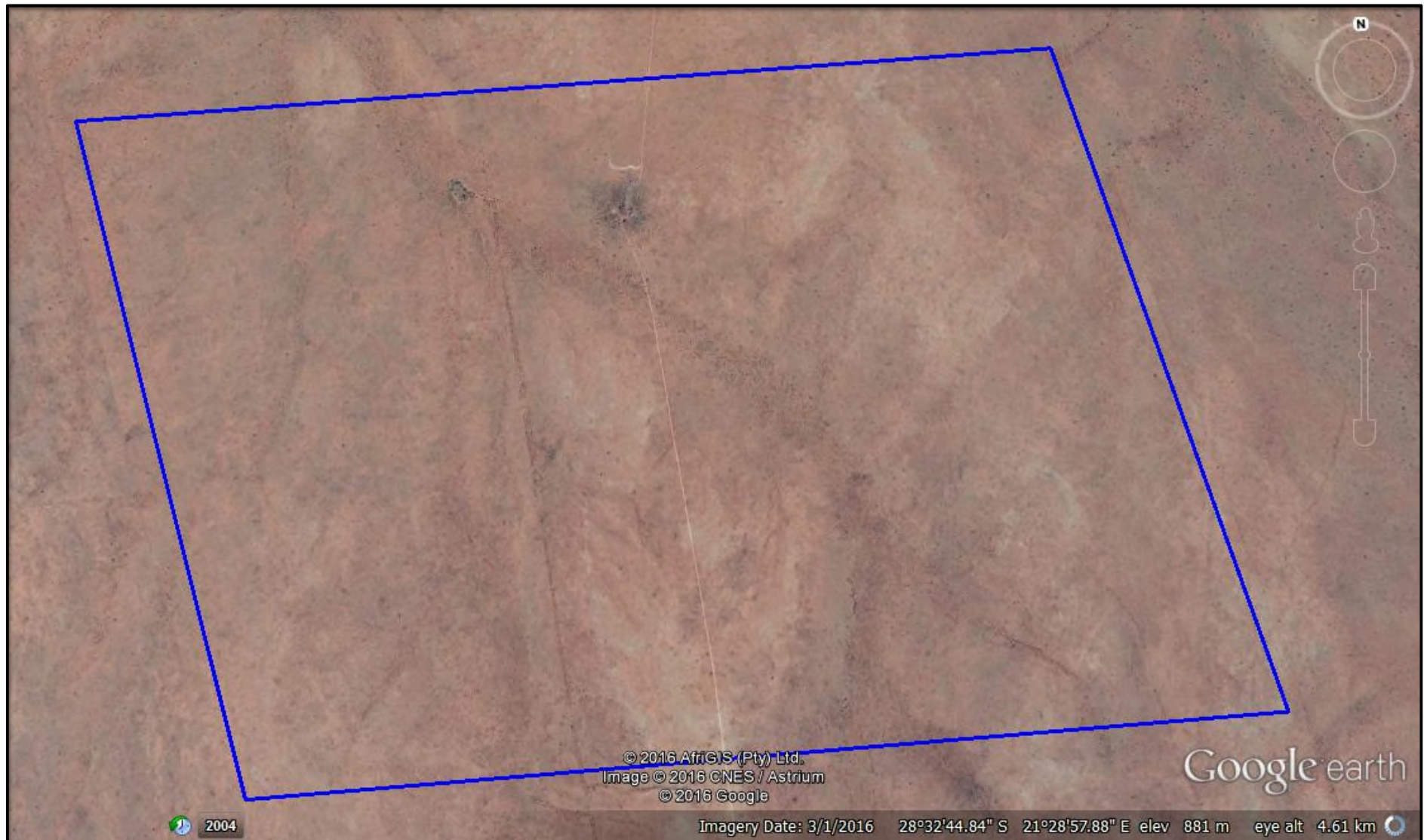
Figure 3. Google image of the study area.