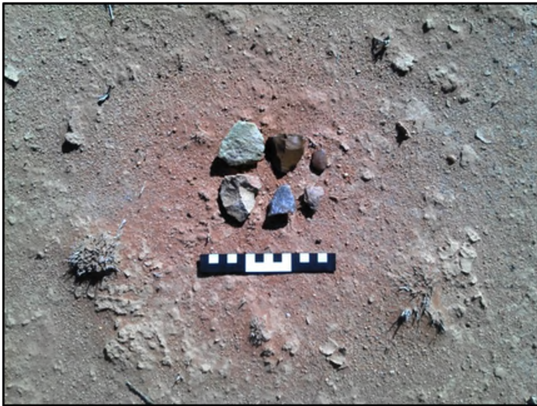
Figure 6. Range of raw materials and isolated MSA and LSA flakes.