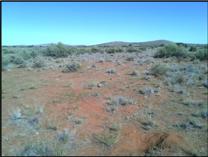
Figure 4. General Site conditions