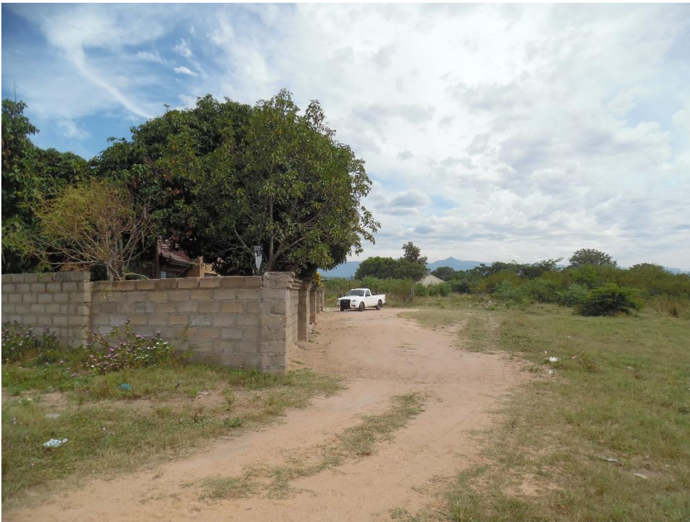
Photograph 3: Site characteristics