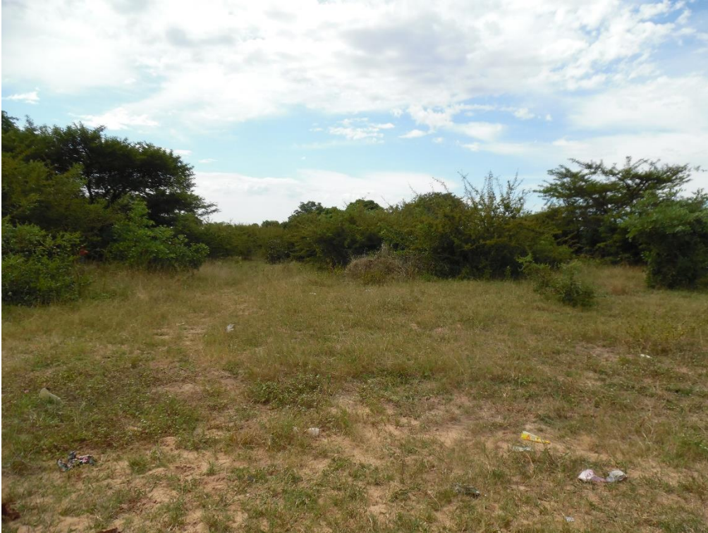
Photograph 2: Site characteristics