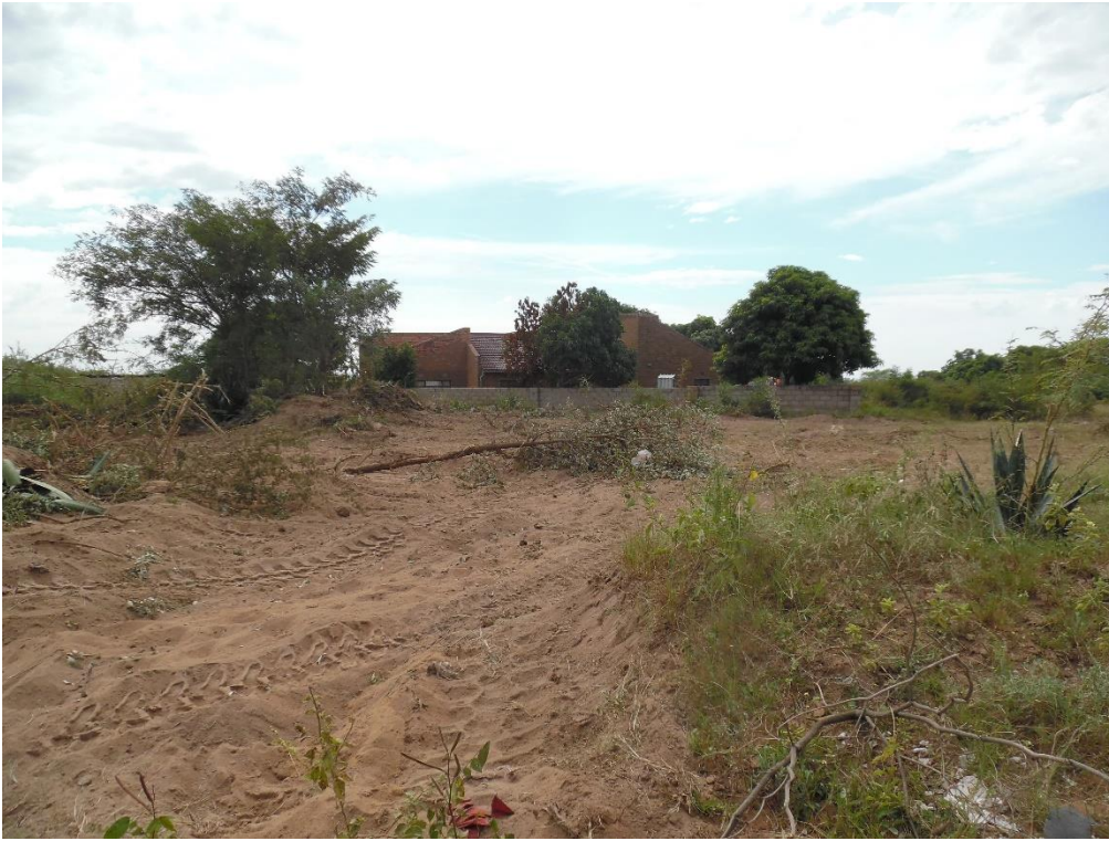
Photograph 6: Site characteristics