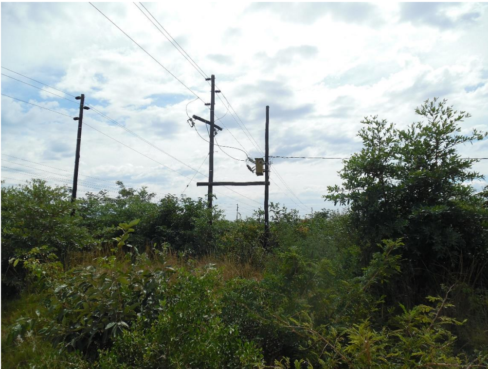
Photograph 9: Site characteristics