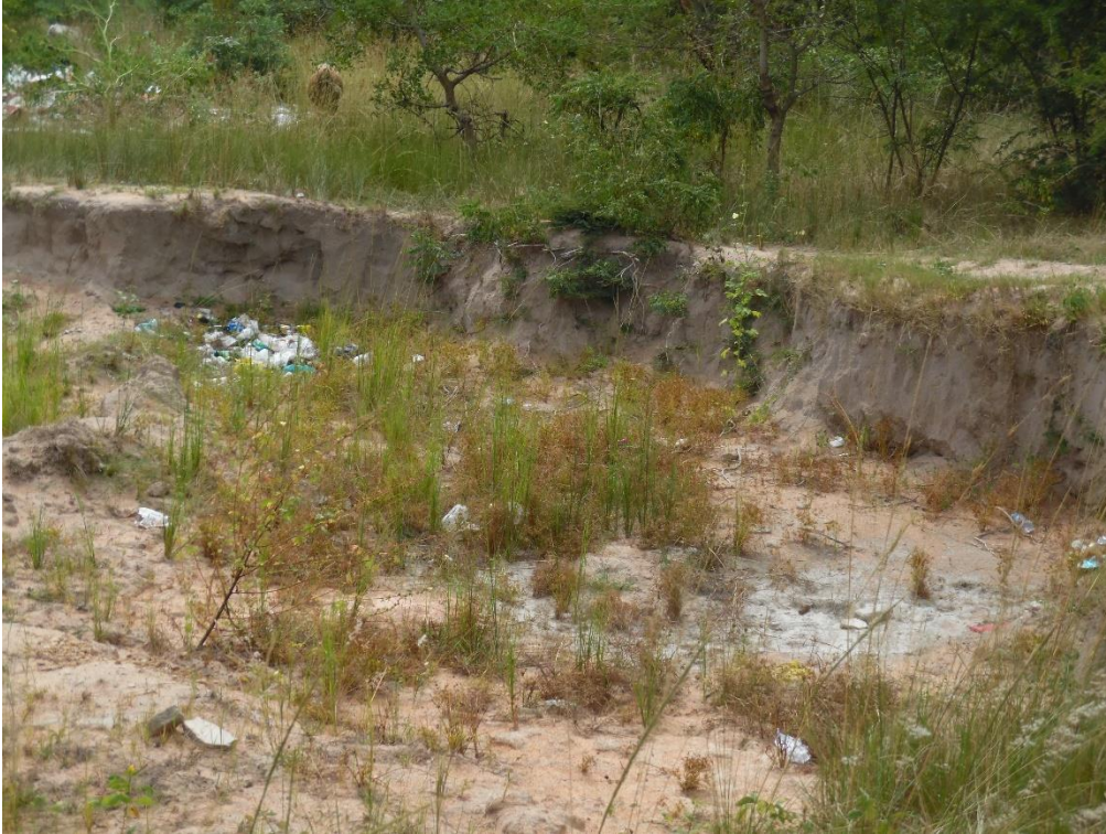
Photograph 8: Site characteristics