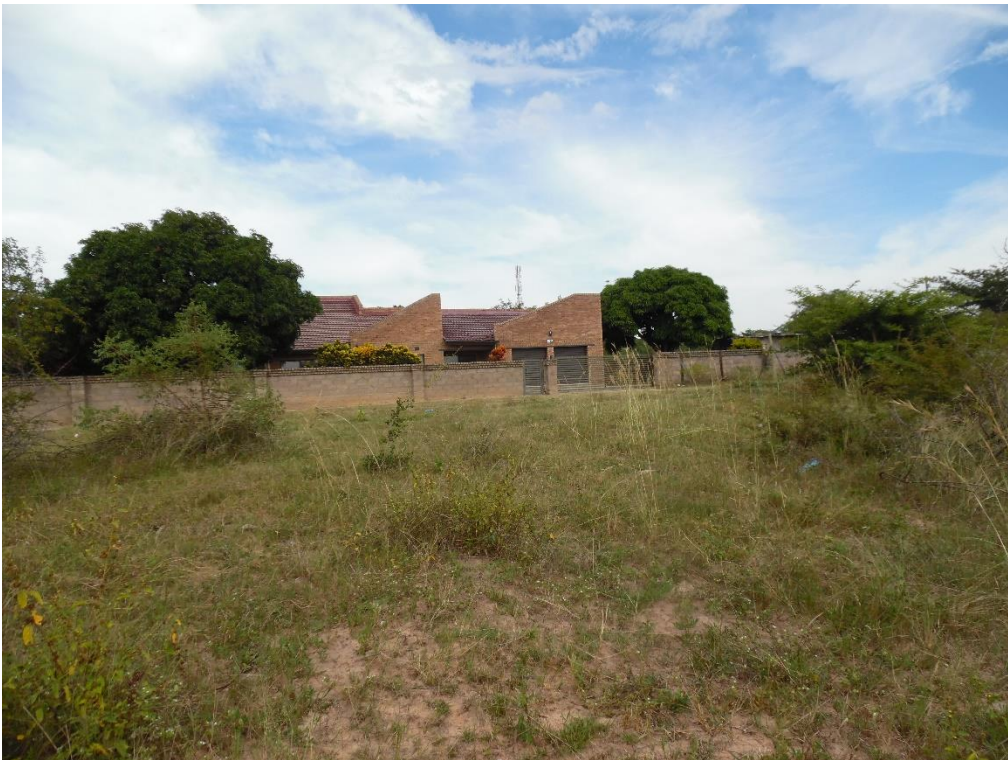
Photograph 5: Site characteristics