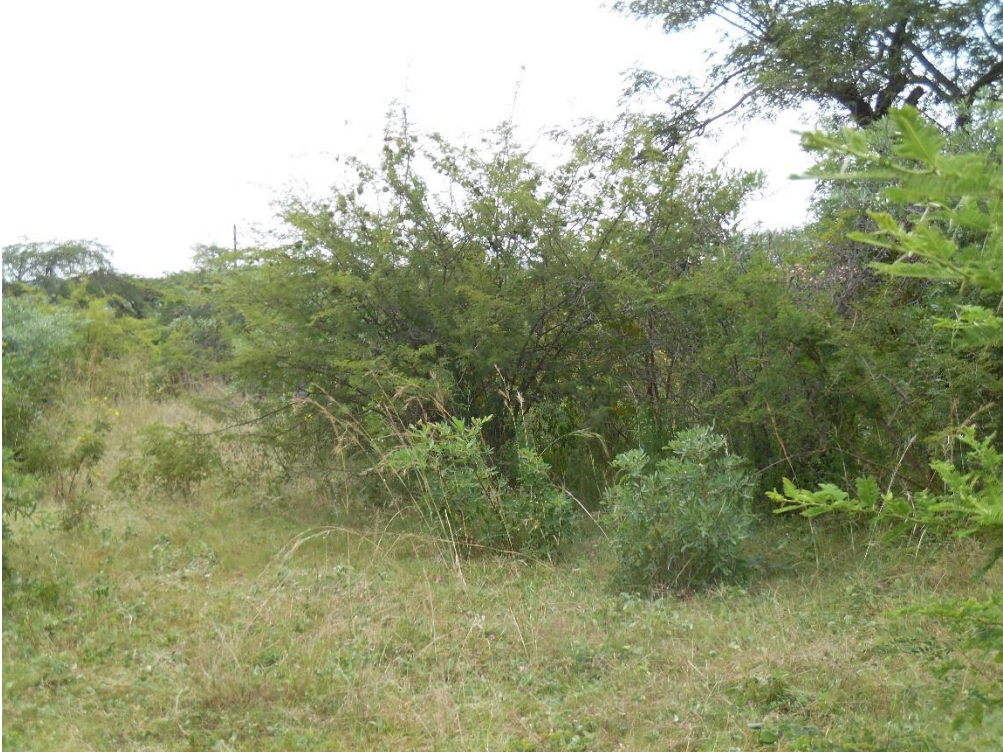
Photograph 7: Site characteristics