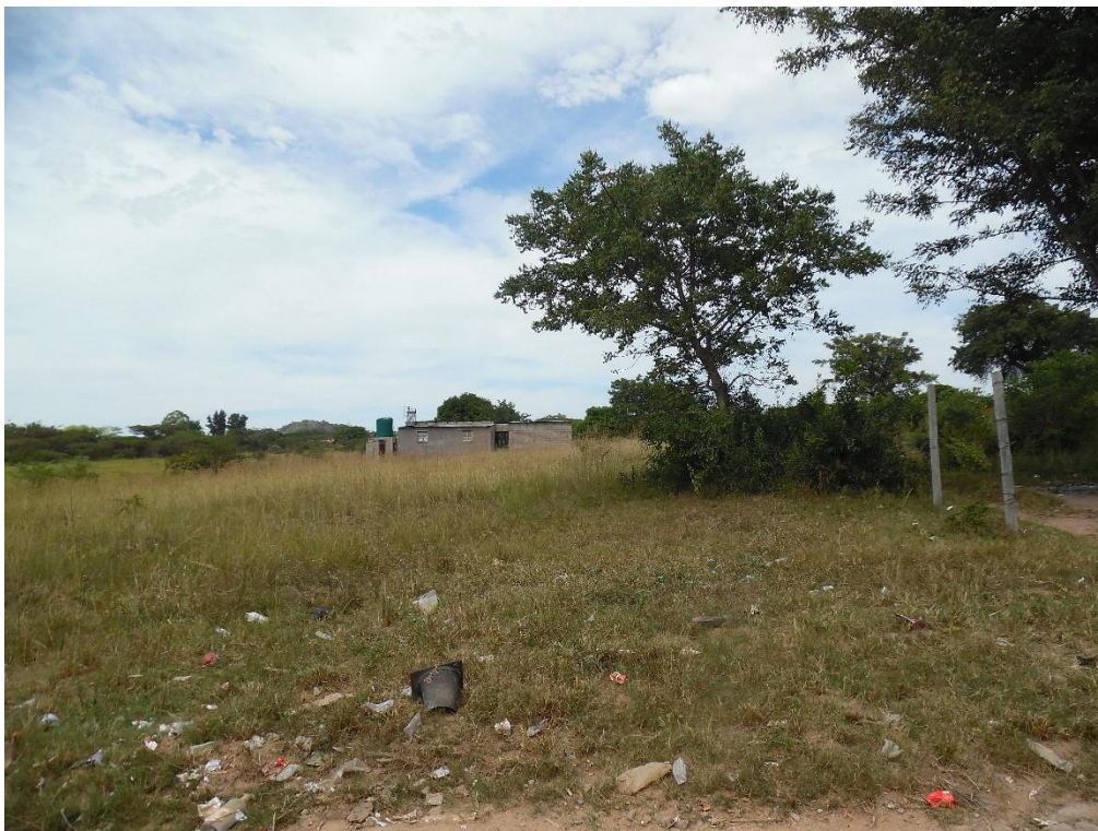
Photograph 1: Site characteristics