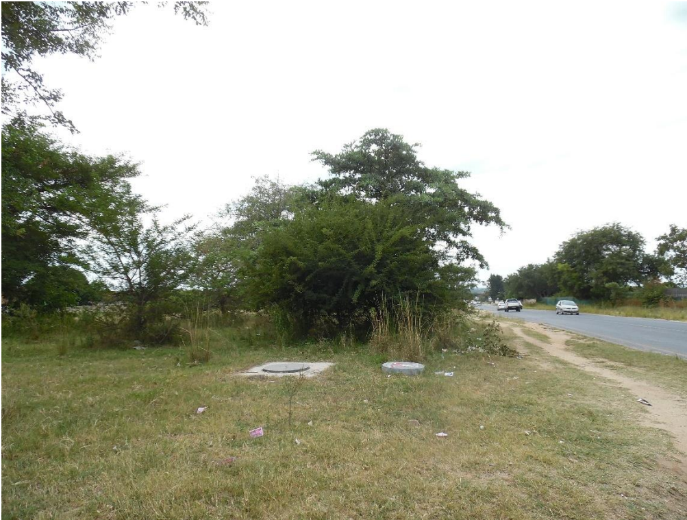
Photograph 10: Site characteristics