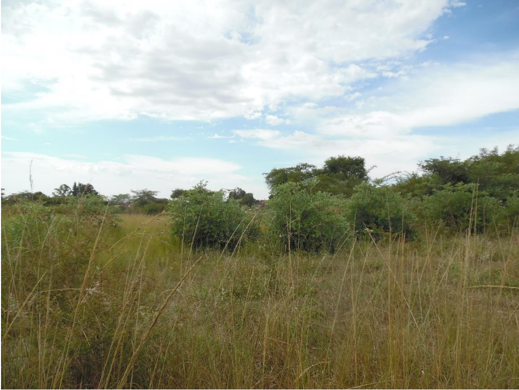
Photograph 4: Site characteristics