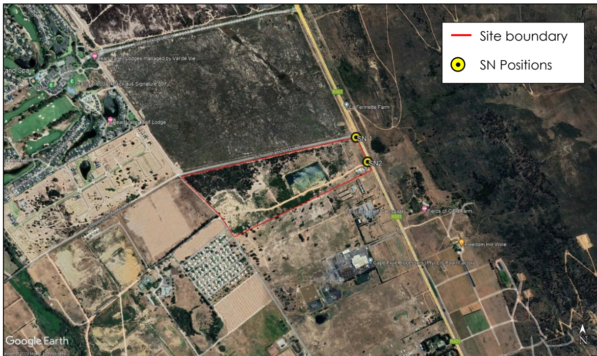
Figure 1: Position of the site notices.