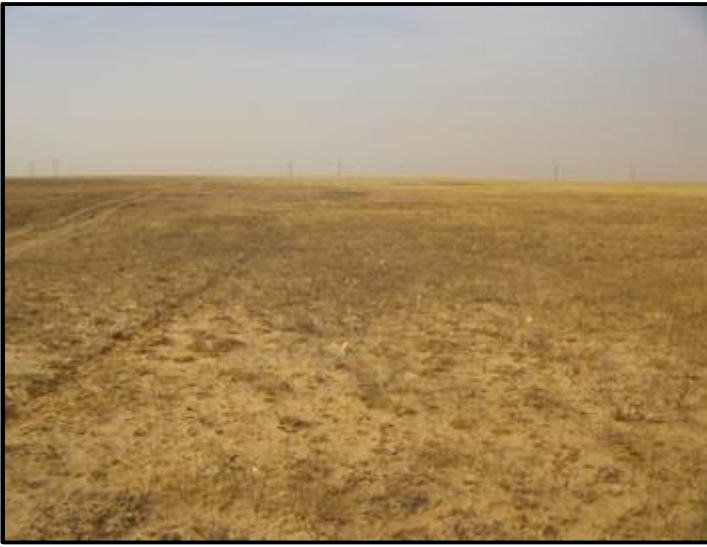
Figure 4 General Site conditions in the centre portion of the study area.