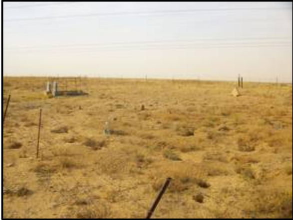
Figure 8: Site 1 viewed from the east.