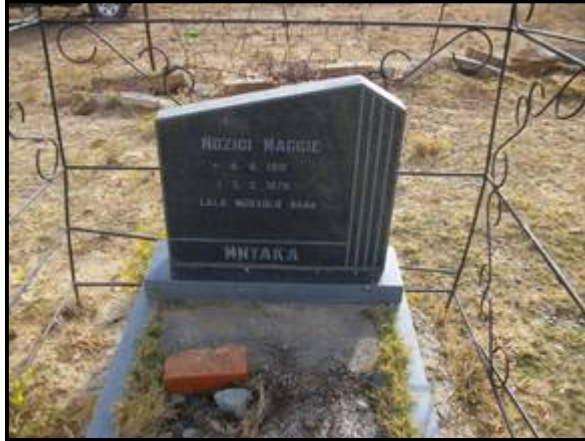
Figure 9: Oldest visible date on site.