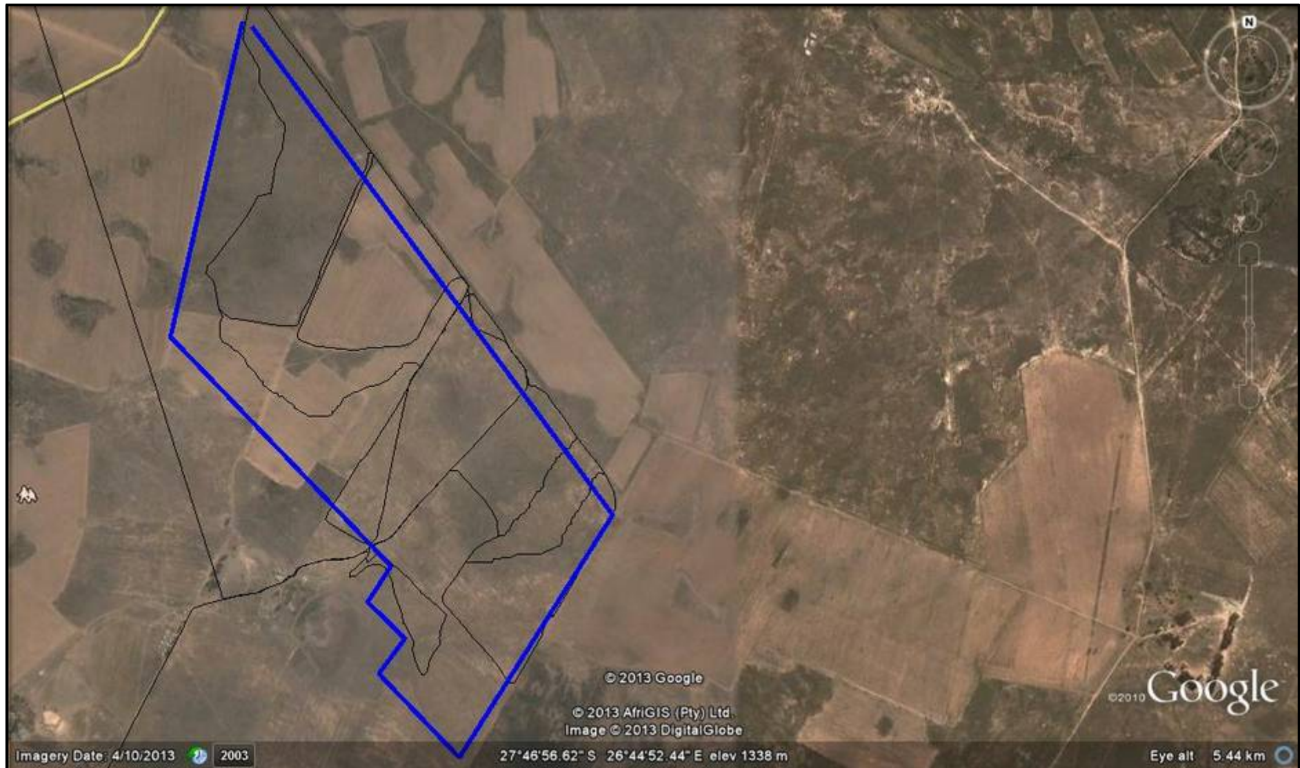
Figure 2: Google Image showing the development footprint (blue) and track log (black) of the areas that were covered during the survey.