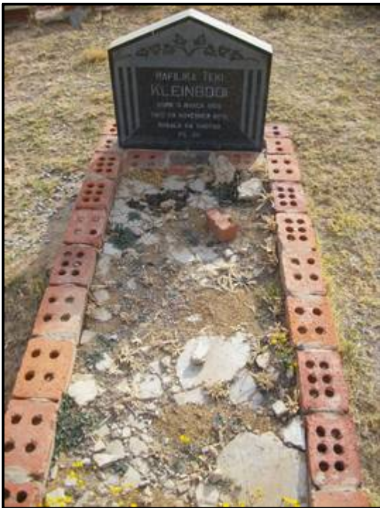
Figure 10: Granite headstone.