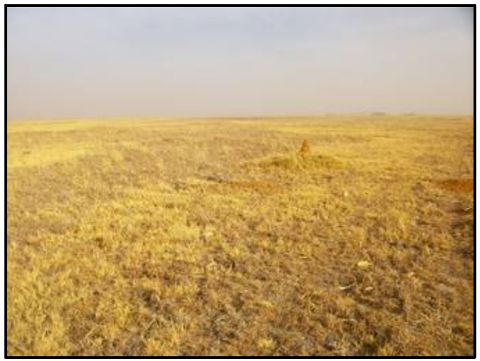
Figure 7. General site conditions in the south western portion of the study area.