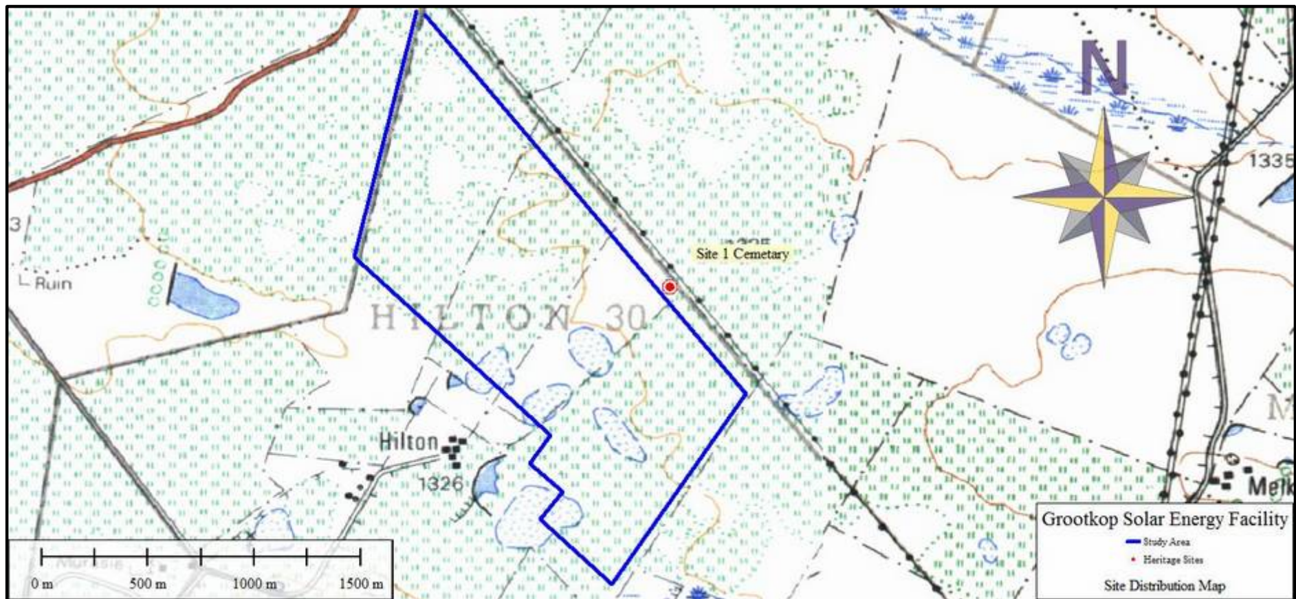
Figure 3: Showing the location of the identified site in relation to the proposed PV panel area.