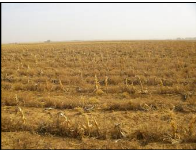
Figure 6. Current agricultural activities in the western portion of the study area.