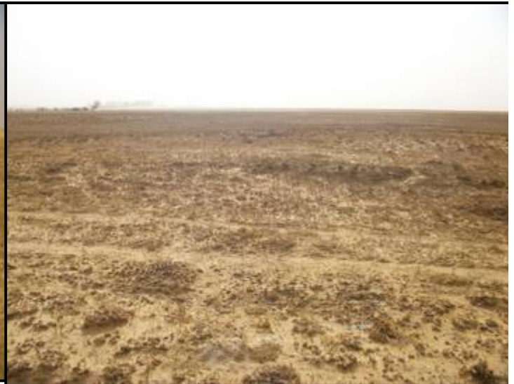
Figure 5. General Site conditions in the north eastern portion of the study area.