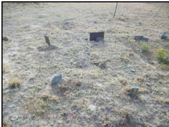
Figure 11: Range of grave markers at Site 1.